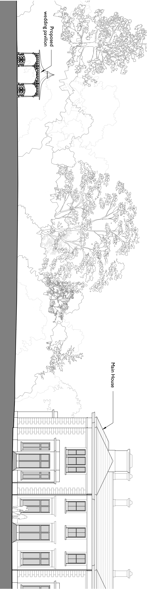
2 Proposed East Elevation 2010 1:200 @ A3