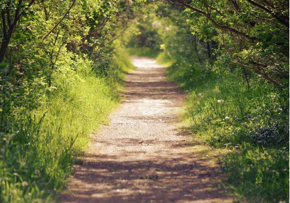
Link through Woodland Buffer