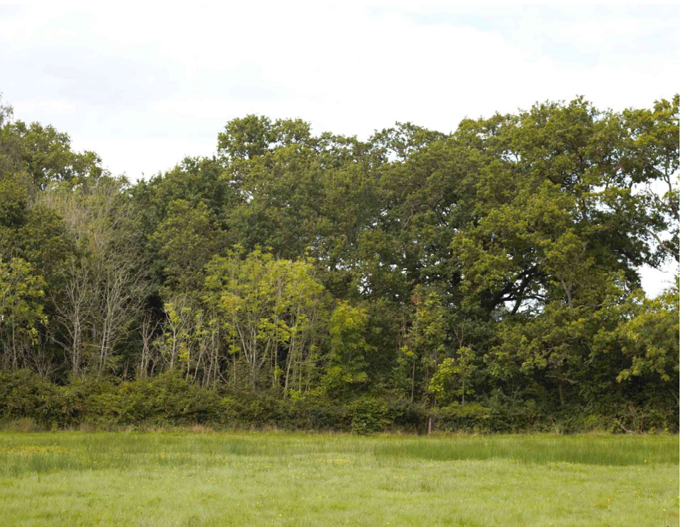
Woodland Edge Ecotone