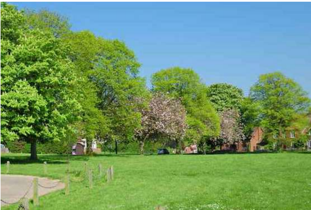
Community Open Space with Timber Bollards