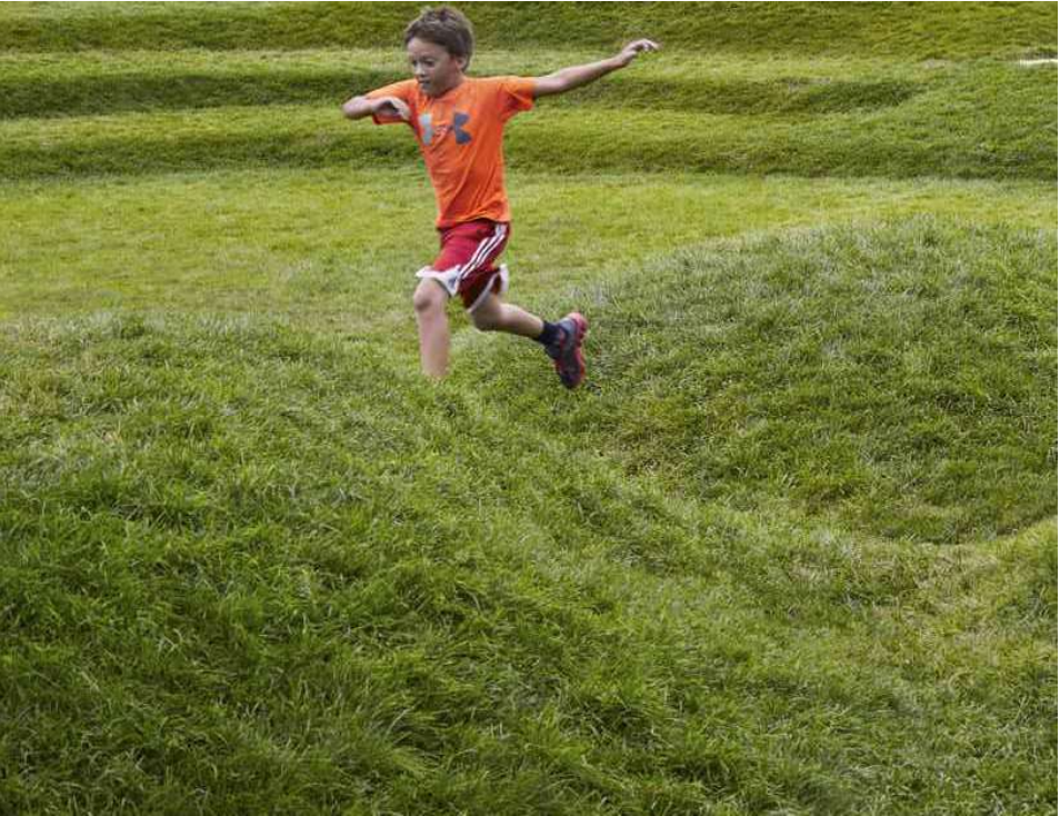
Play grass mounds