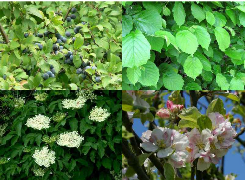
Mixed native hedging