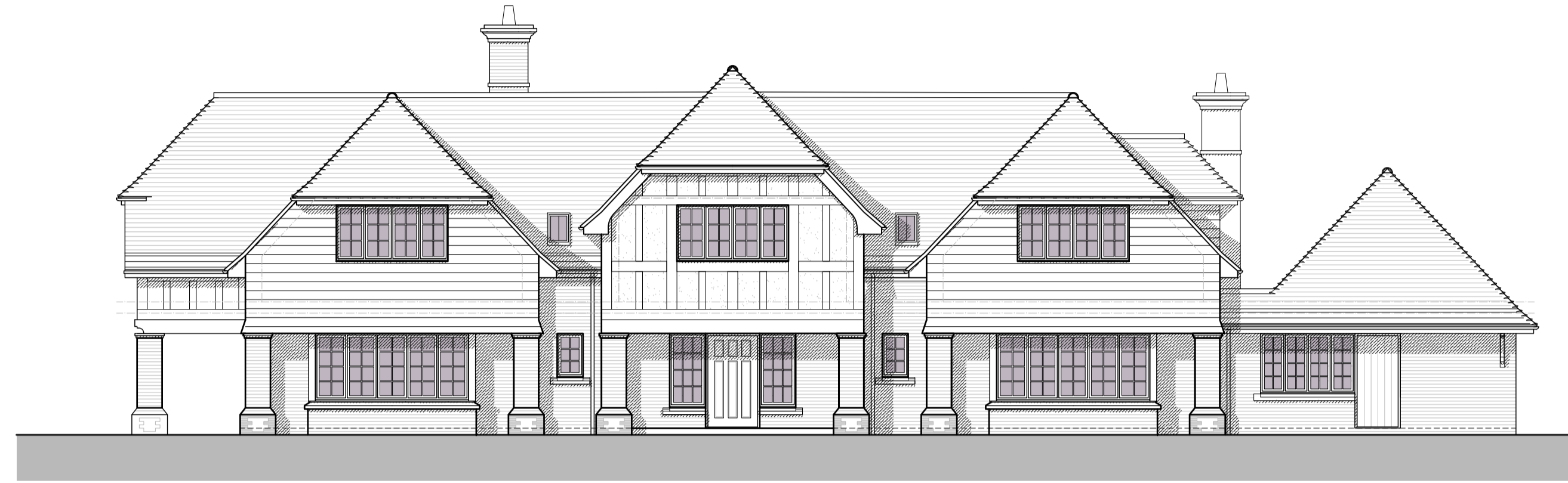
EAST ELEVATION AS PROPOSED