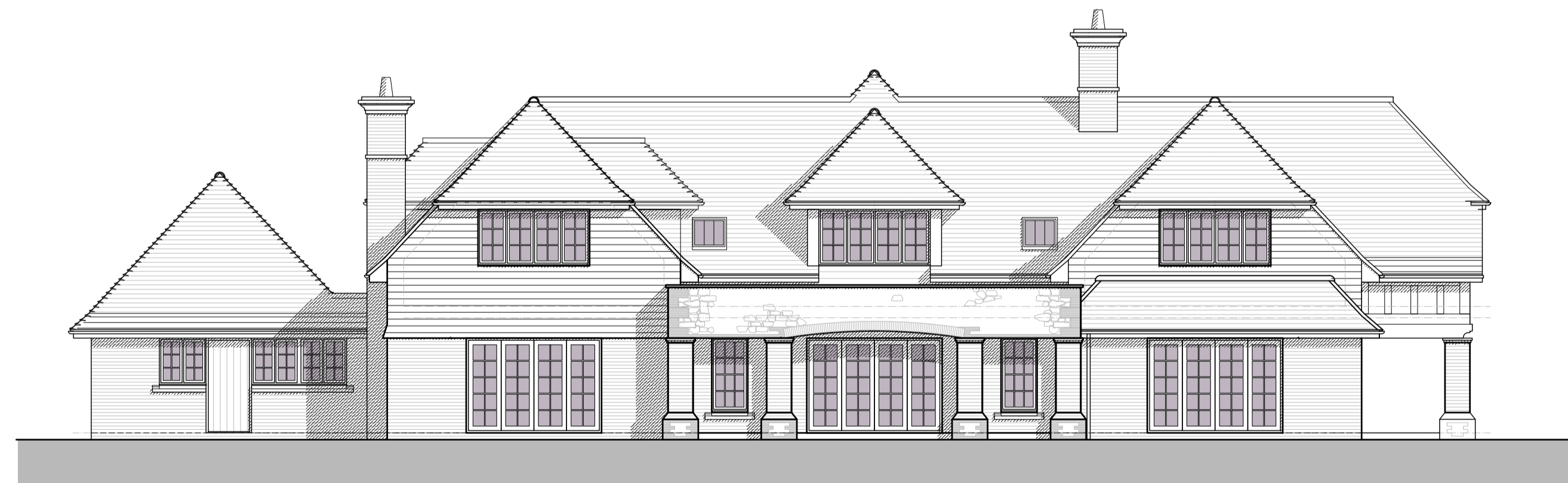
WEST ELEVATION AS PROPOSED

A - Planning Issue. Boot room porch amended. - 02.12.2025