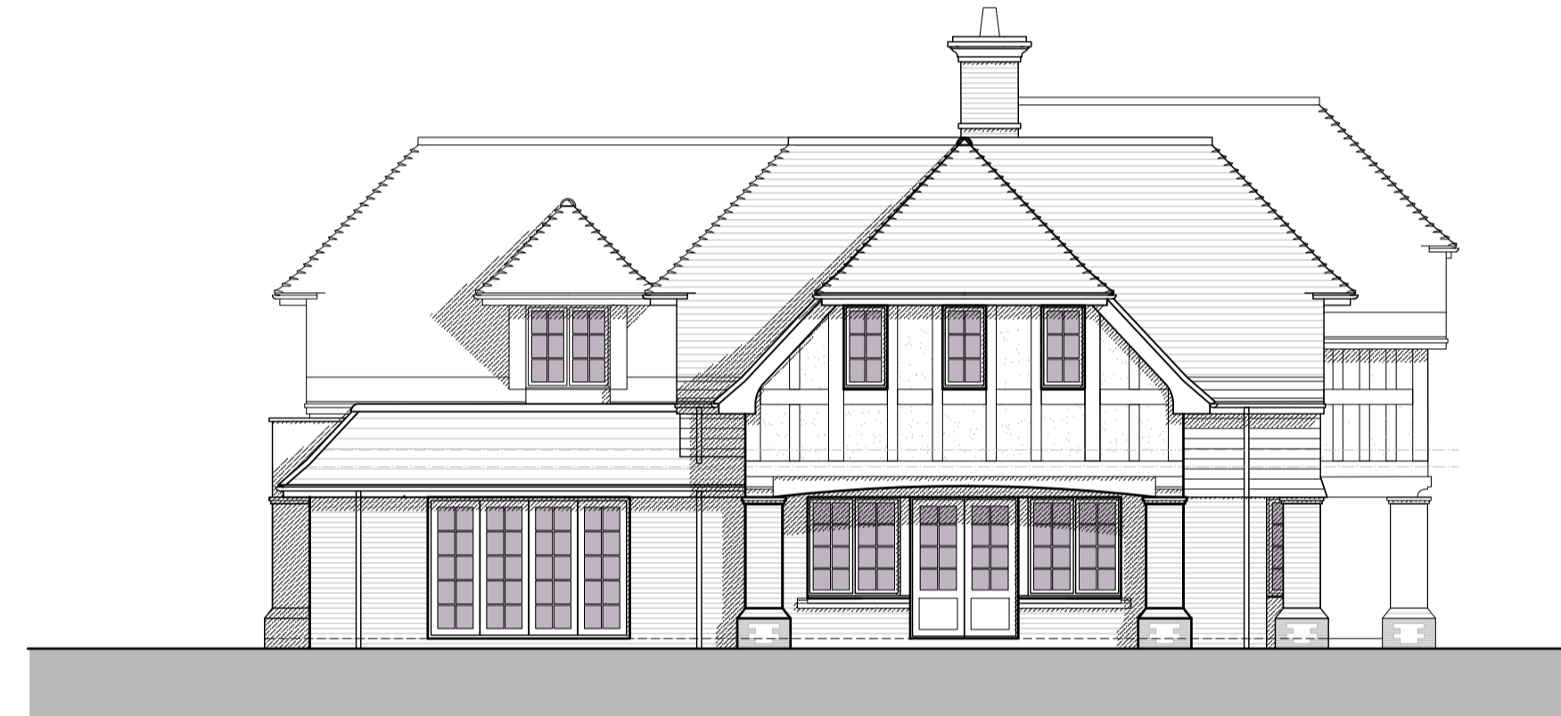
SOUTH ELEVATION AS PROPOSED