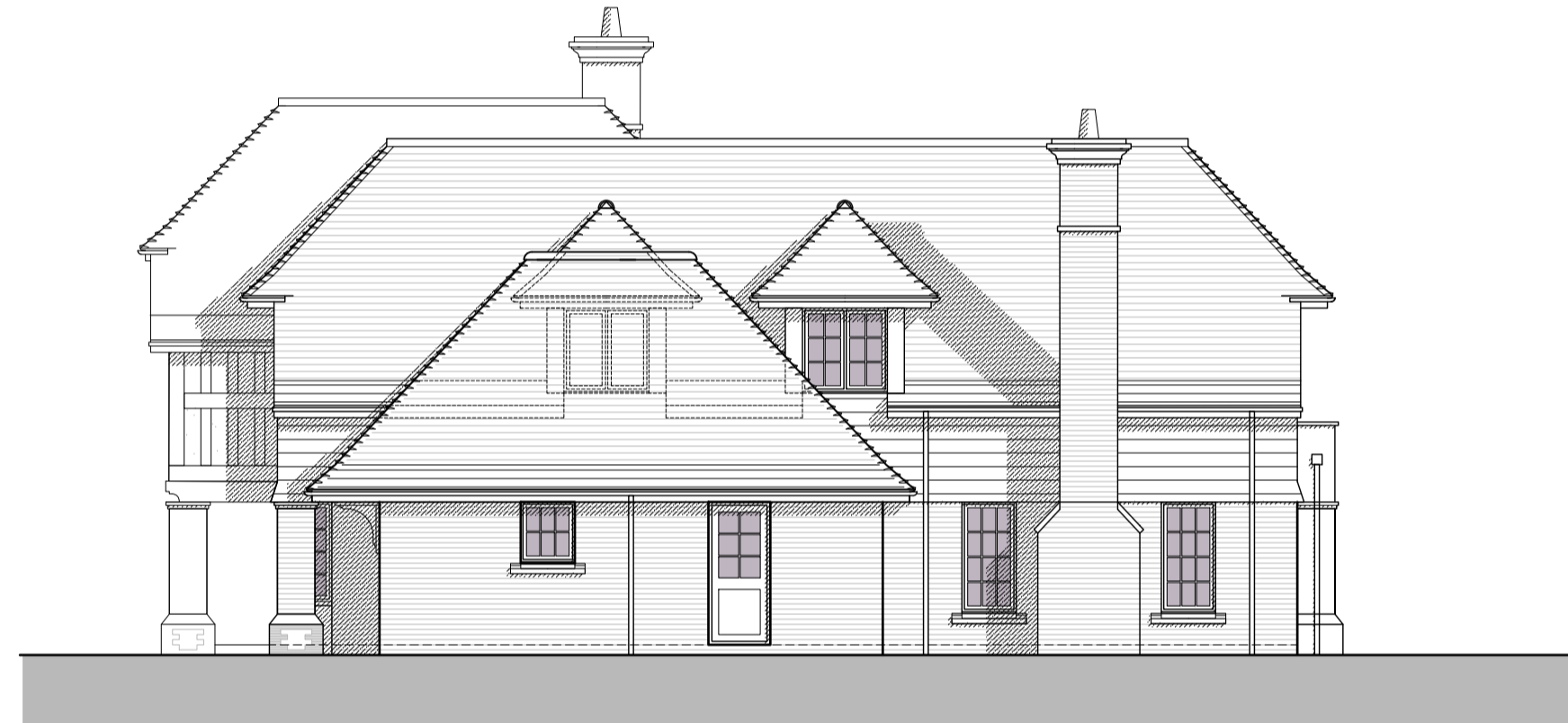
NORTH ELEVATION AS PROPOSED