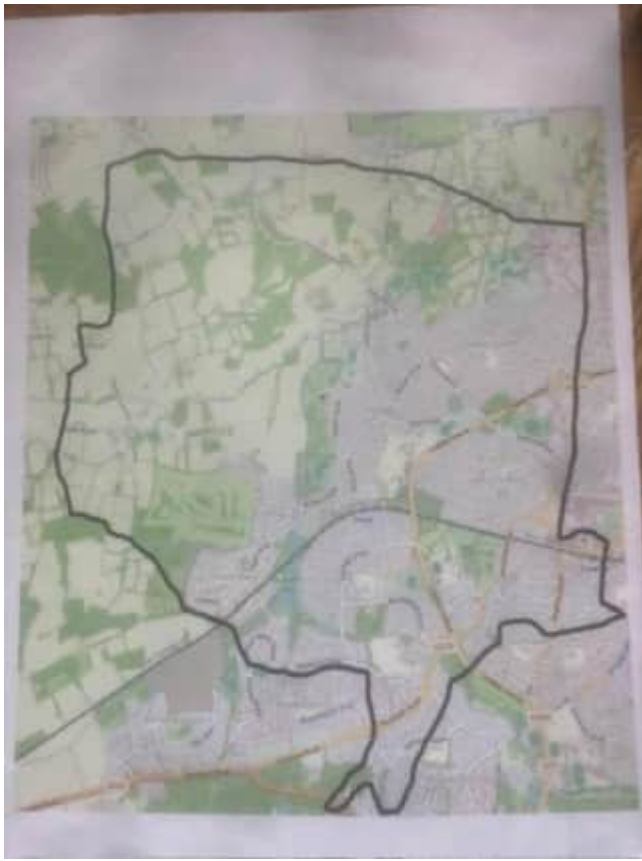
The ancient Parish of Ifield (boundary in black)