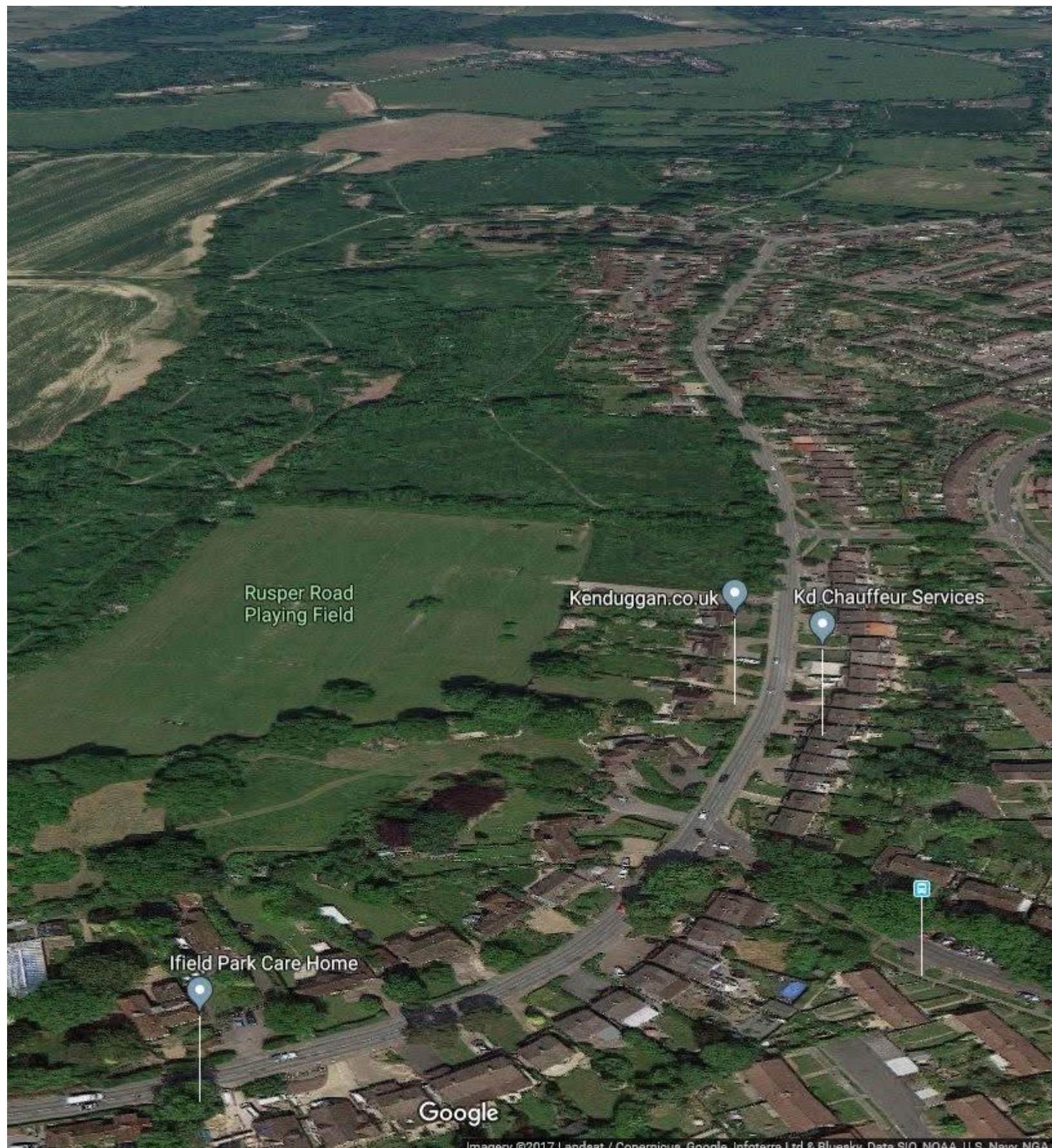
Ifield Brook Meadows