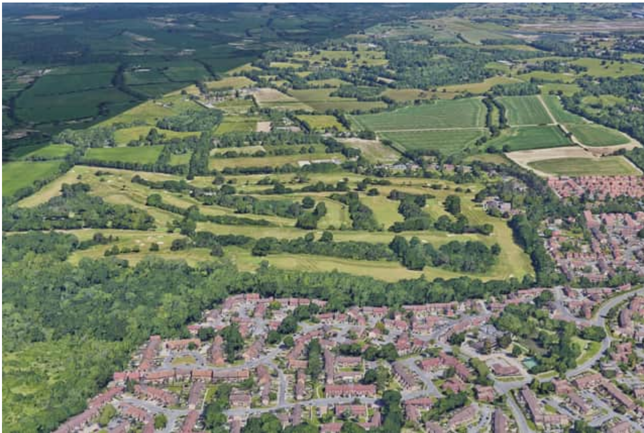
West of Ifield within ancient Parish