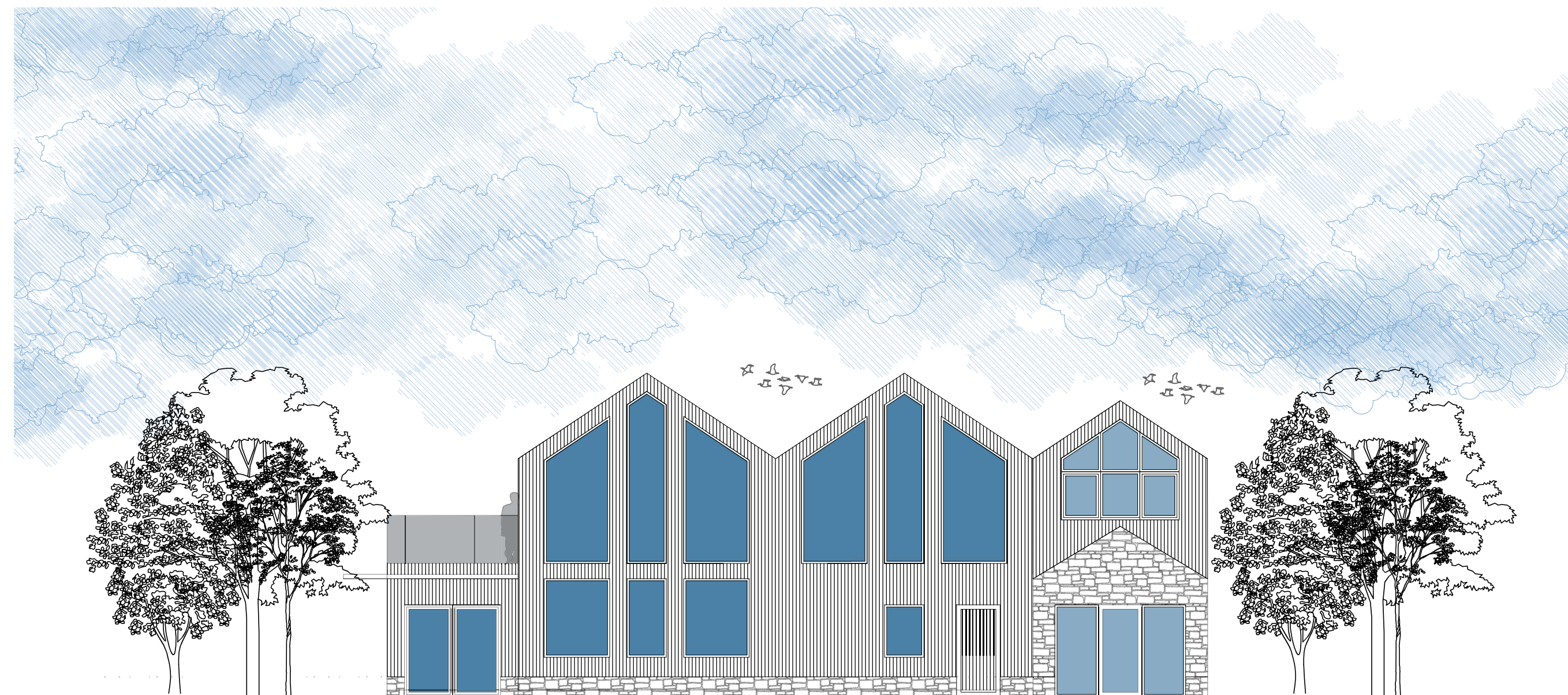
Proposed South Elevation - 1:100