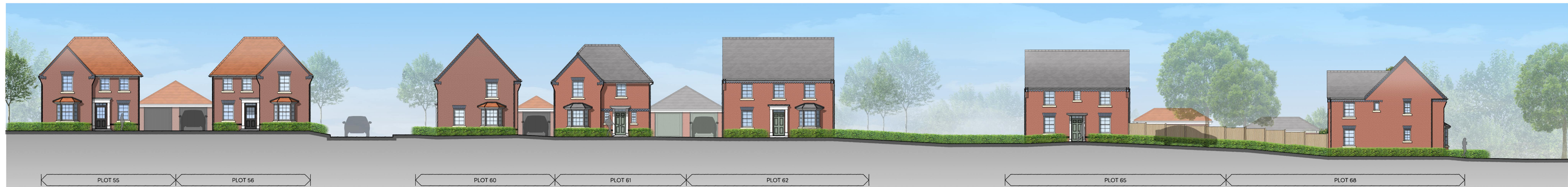
STREET SCENE - D