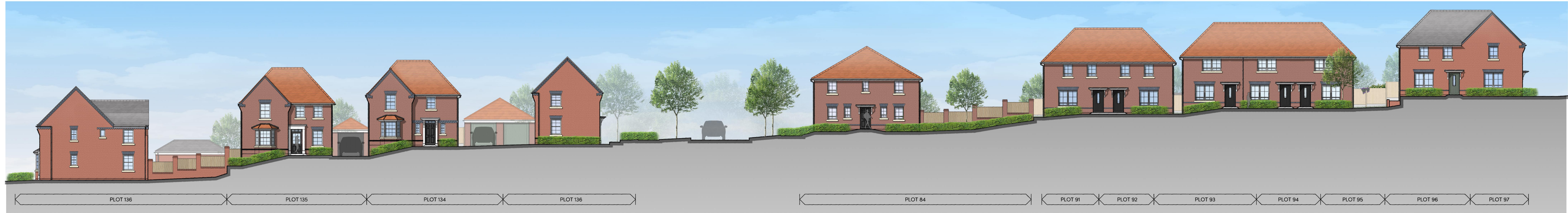
STREET SCENE - B