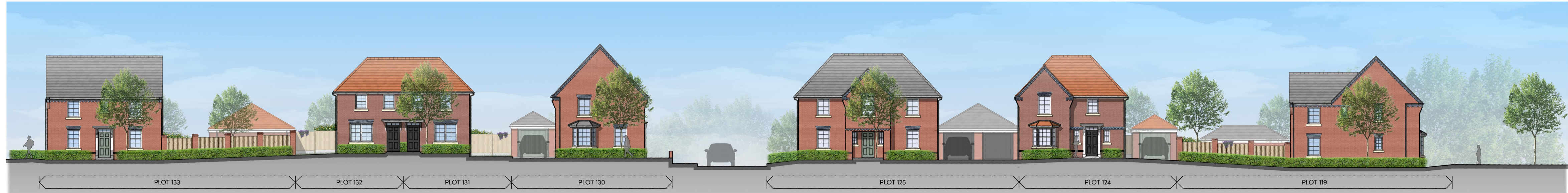
STREET SCENE - C