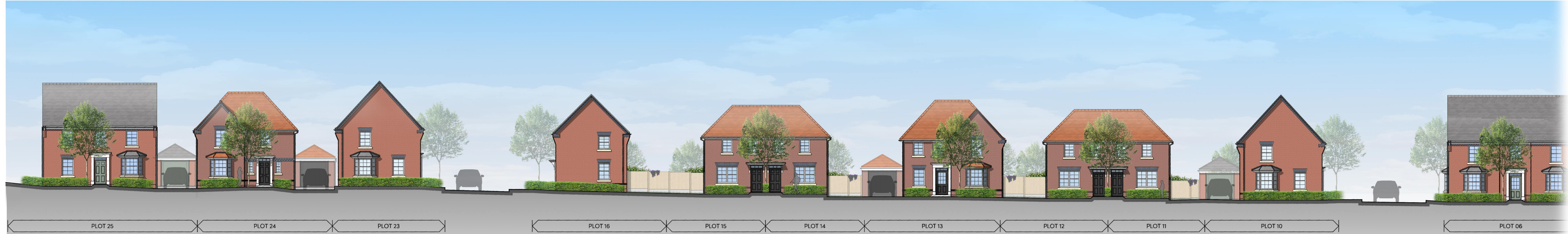
STREET SCENE - A