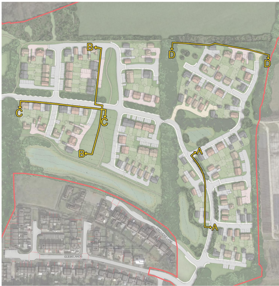
STREET SCENE LAYOUT PLAN (NTS)