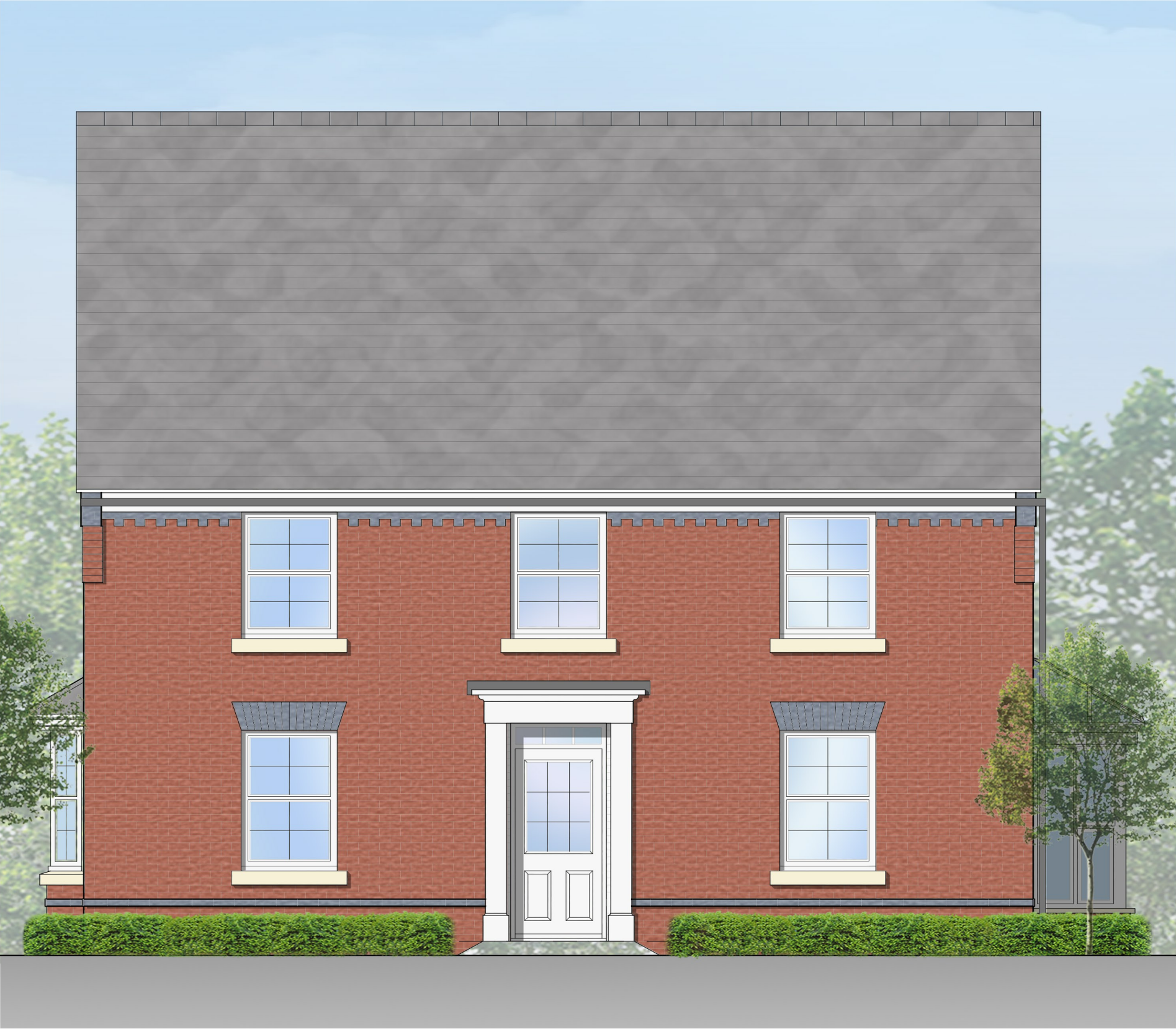
FRONT ELEVATION TYPE A