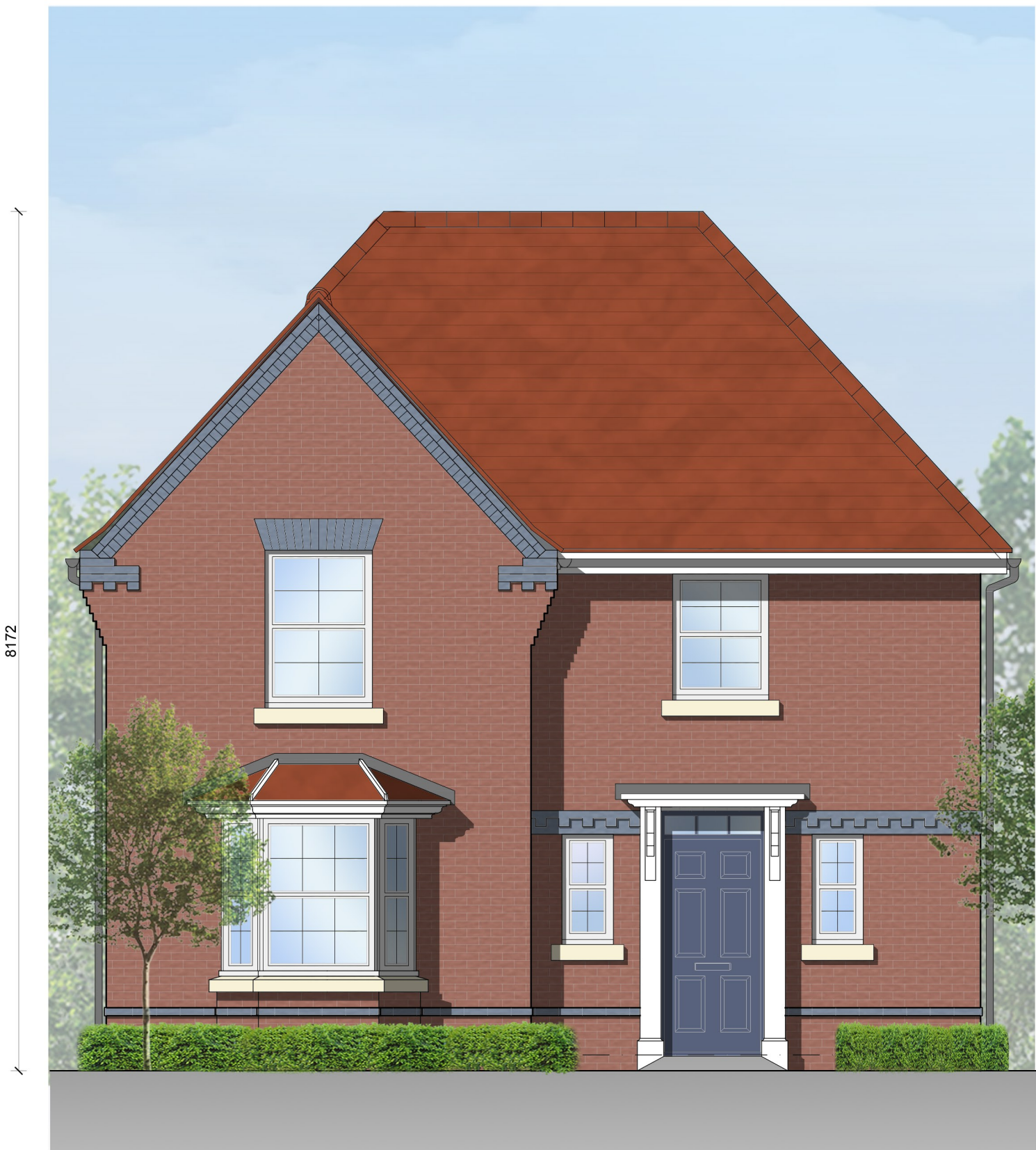
FRONT ELEVATION TYPE A