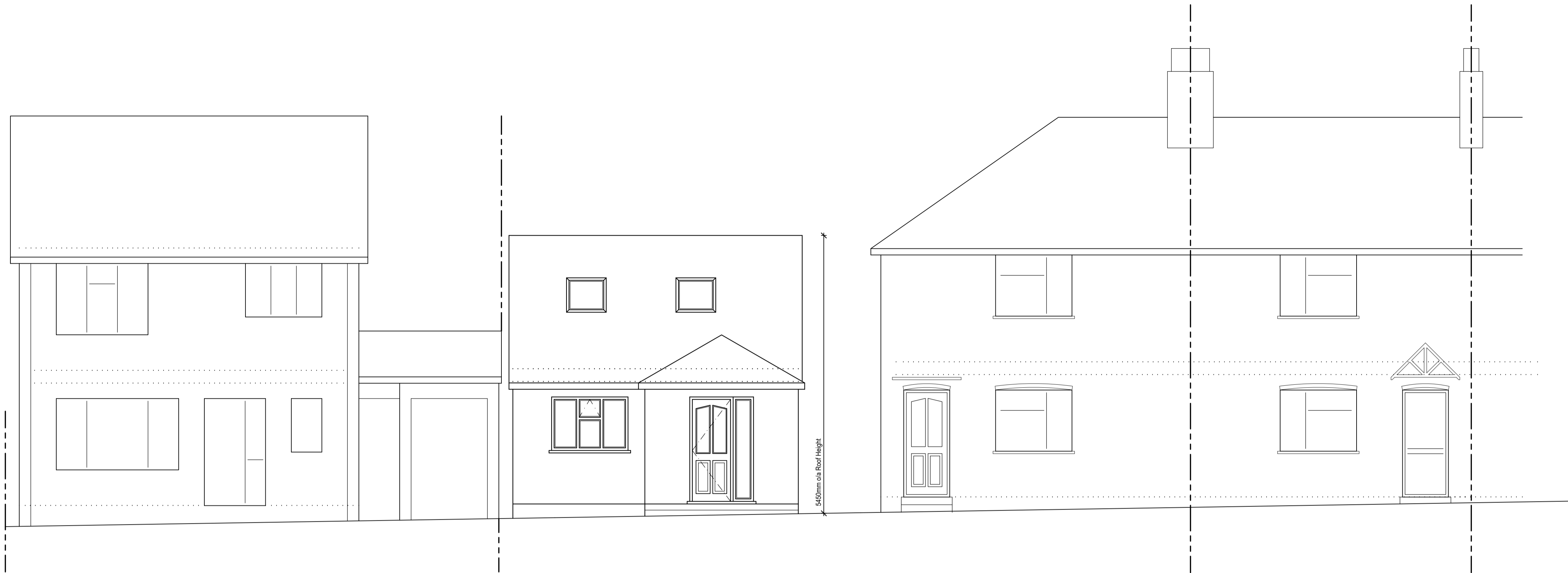
PROPOSED STREET SCENE