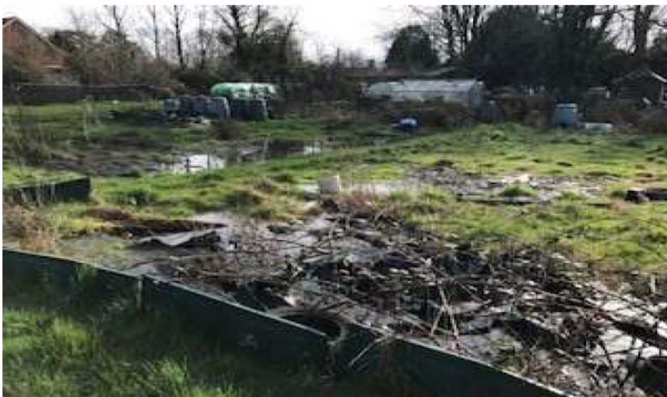
Ifield Allotment flooded