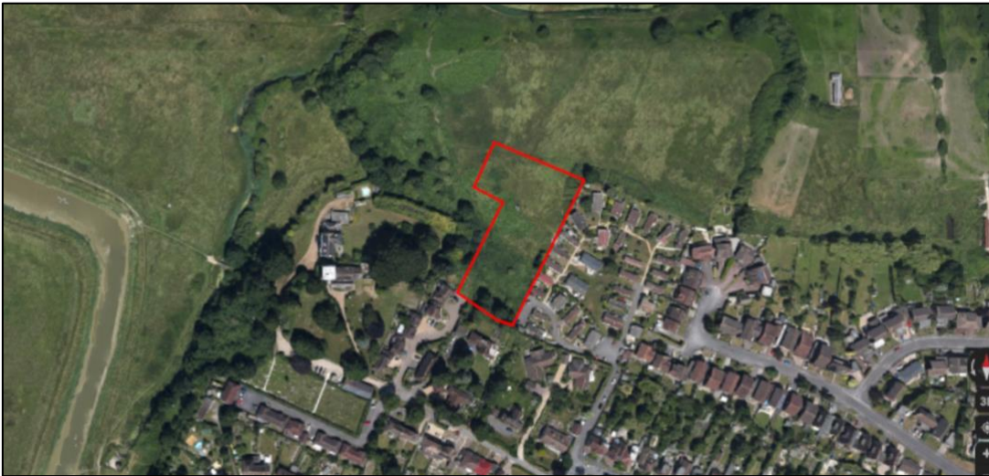
Figure 2. Ariel image showing the location of the site.

In summary, the results of the 2021/22 surveys identified that the site supports a field of dense bramble Rubus fruticosus agg. scrub with scattered shrubs and trees. The site lies within the River Adur Water Meadows & Wyckham Wood Local Wildlife Site. The bramble scrub had been cleared in-between the two visits to the site in 2021.