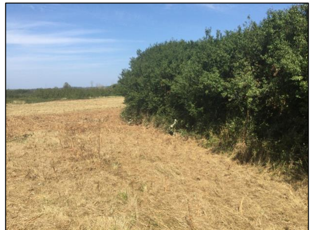
Photograph 2. Blackthorn scrub to the northeastern boundary of the site.