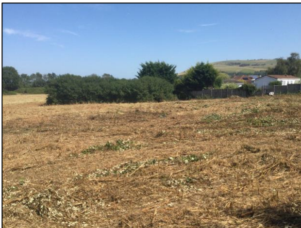
Photograph 1. View across the northern section of the site.

The results of the reptile survey undertaken during 2022 identified that the site supports populations of slow worms Anguis fragilis (maximum count of six) and grass snakes Natrix helvetica (maximum count of 1). The results of the bat activity surveys identified that the site supports foraging habitat utilised primarily by common pipistrelle Pipistrellus pipistrellus and soprano pipistrelle Pipistrellus pygmaeus , with infrequent passes noctule Nyctalus noctule and Myotis sp. bats and a single recorded pass by a barbastelle Barbastella barbastellus .