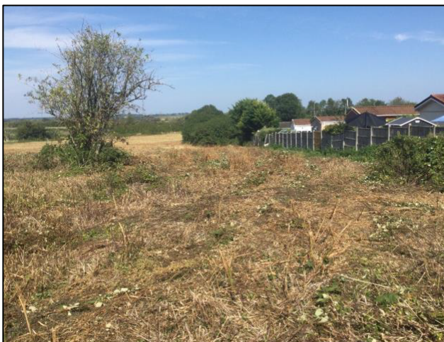
Photograph 3. View from the southern boundary.