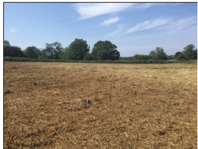
Photograph 4. View from the northern boundary looking east.