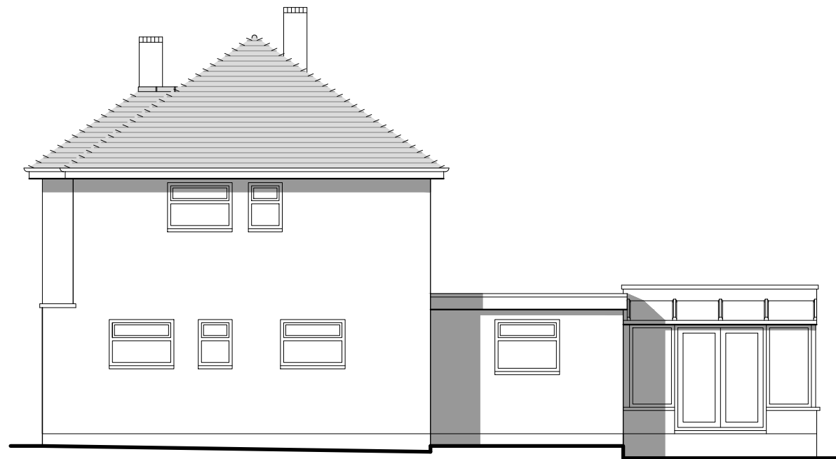
North east elevation