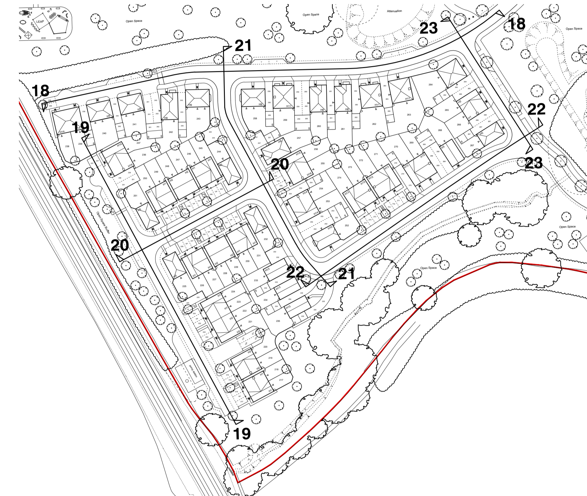
Key Plan (not to scale)