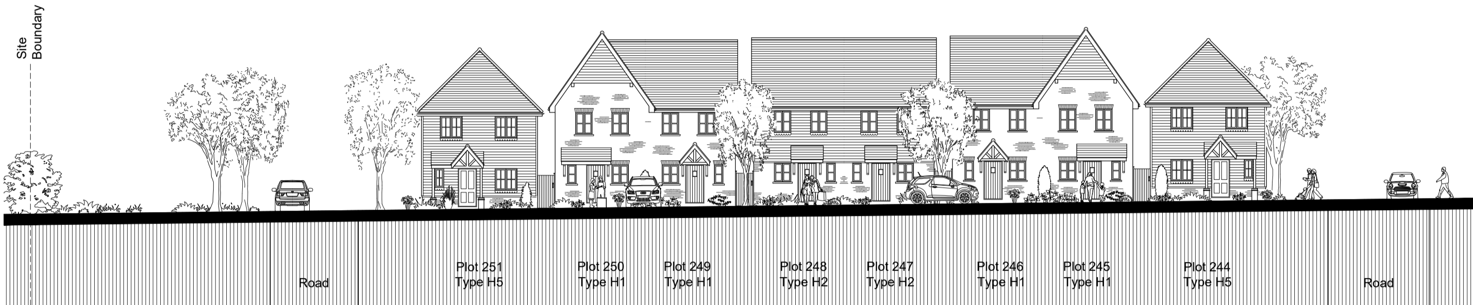
Section 20 - 20