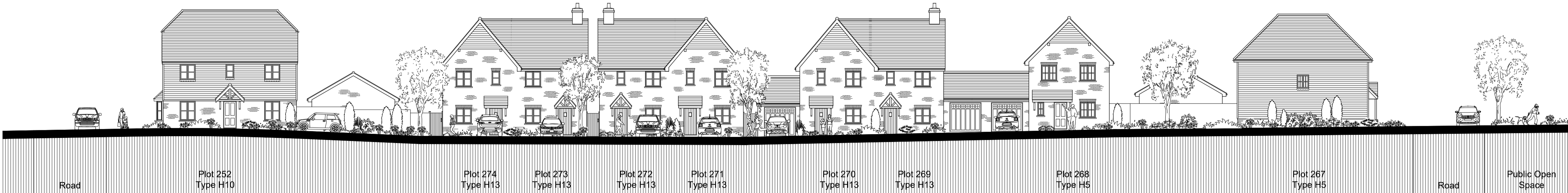
Section 22 - 22