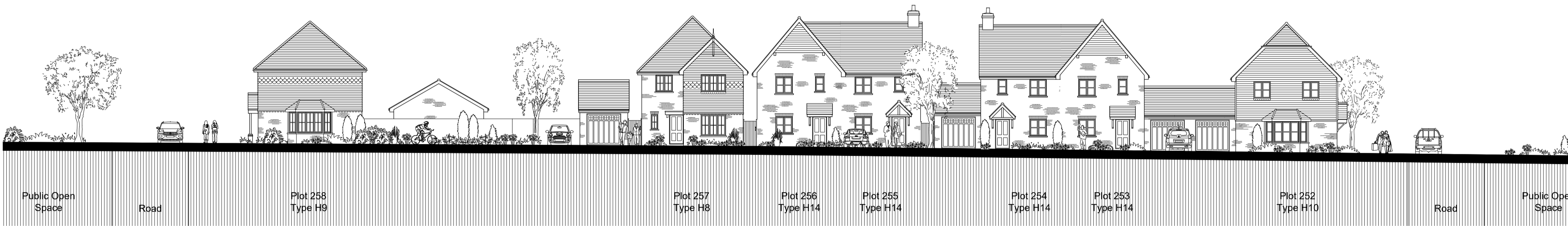
Section 21 - 21