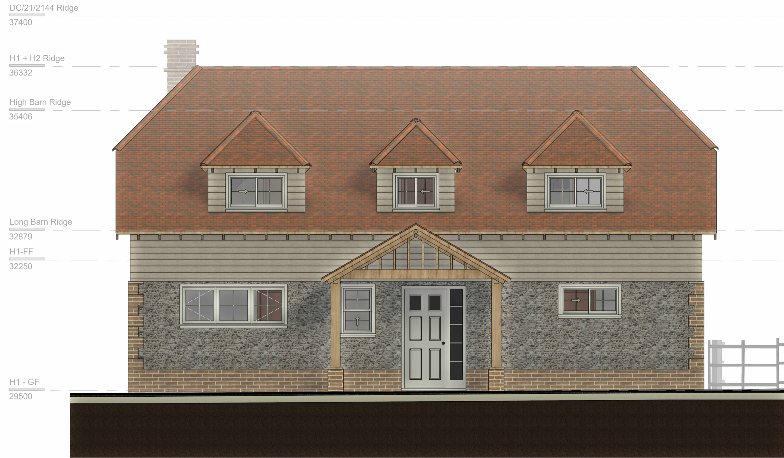
1 House Type 1 - West Elevation 1 : 50