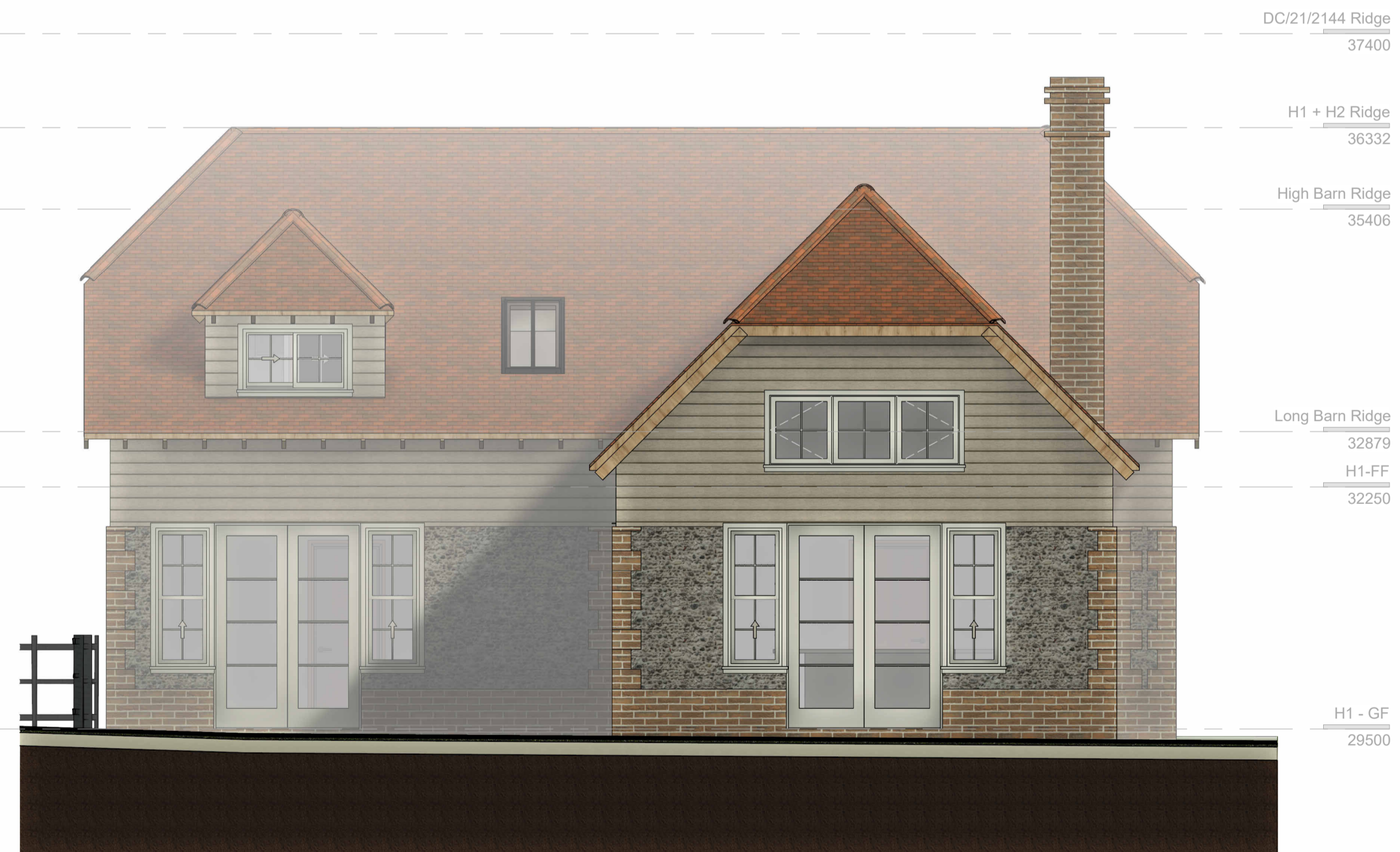
4 House Type 1 - East Elevation 1 : 50