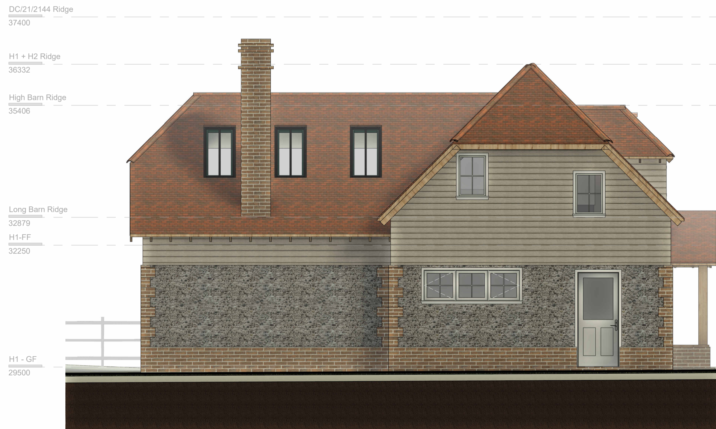
3 House Type 1 - North Elevation 1 : 50