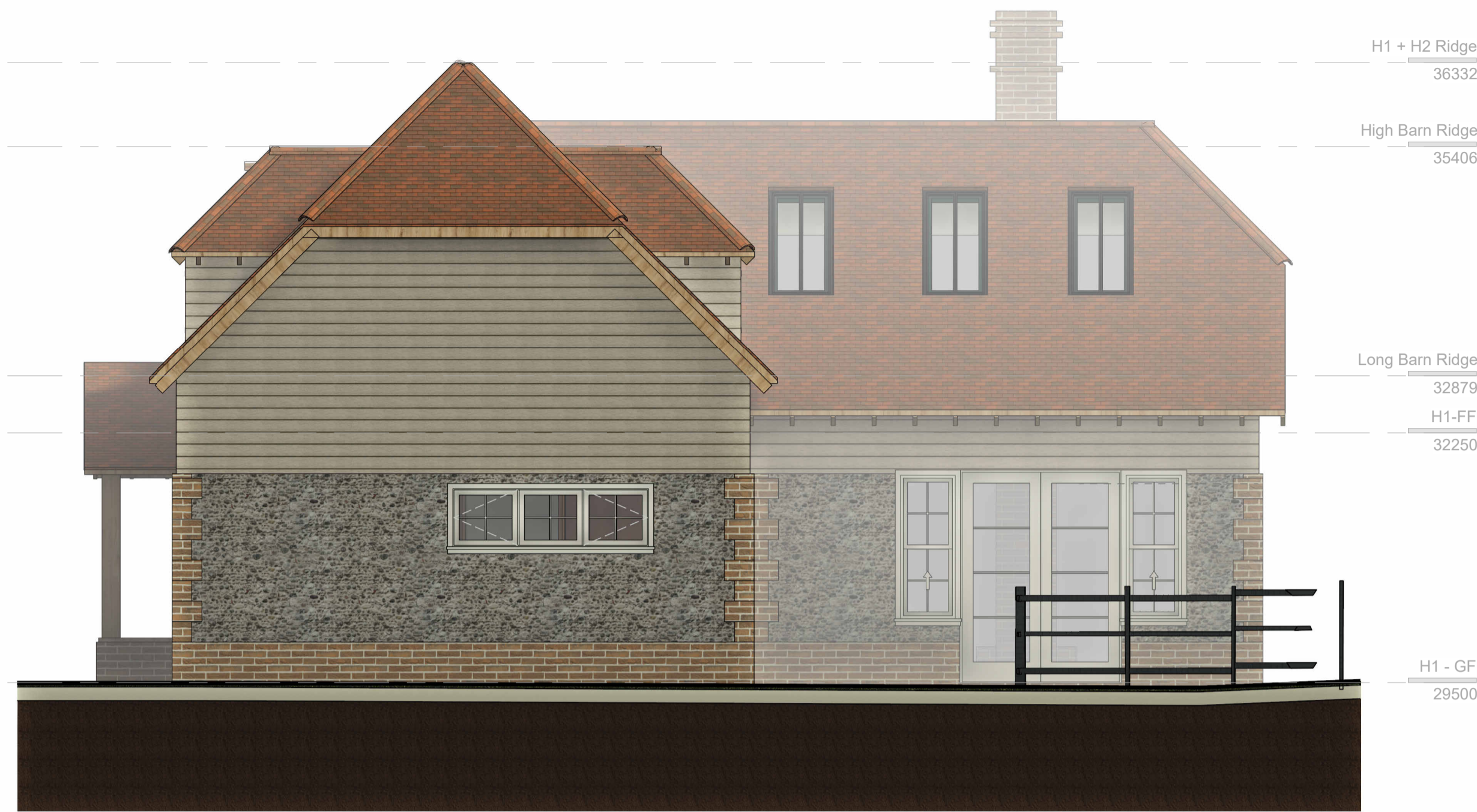
2 House Type 1 - South Elevation 1 : 50