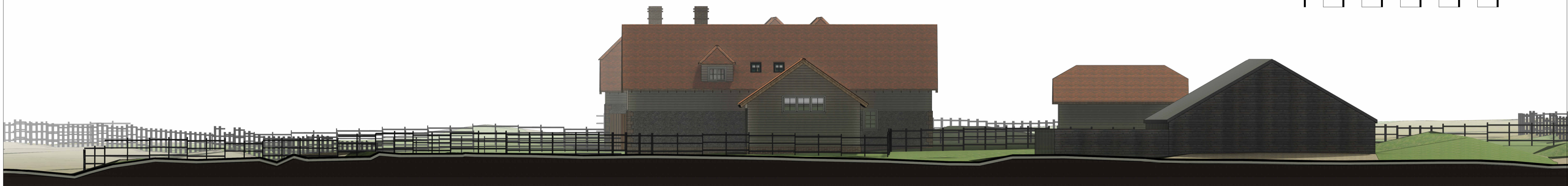
3 Site North "Showing Granted Application - DC/25/0446 on The Location of High Barn" 1 : 100