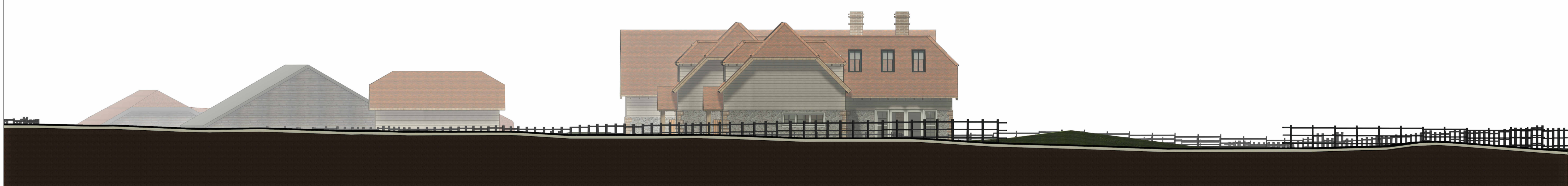
4 Site South "Showing Granted Application - DC/25/0446 on The Location of High Barn" 1 : 100