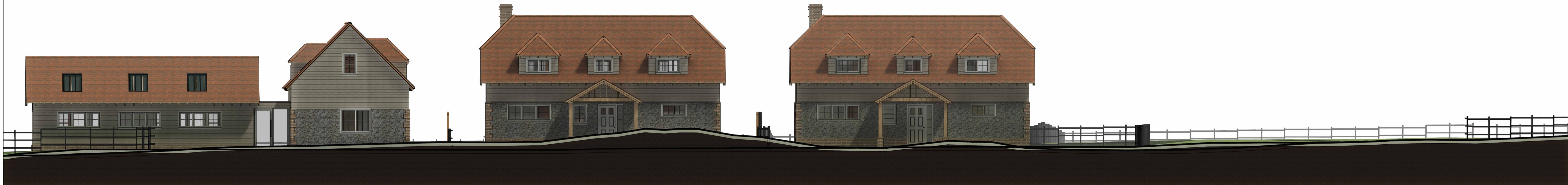
2 Site West "Showing Granted Application - DC/25/0446 on The Location of High Barn" 1 : 100