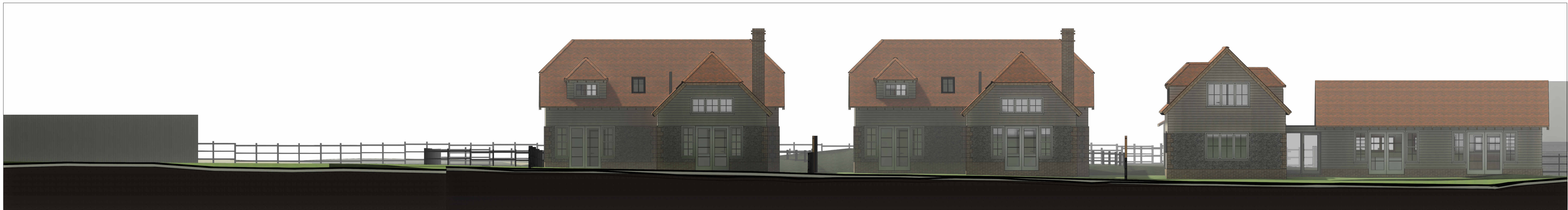
1 Site East "Showing Granted Application - DC/25/0446 on The Location of High Barn" 1 : 100