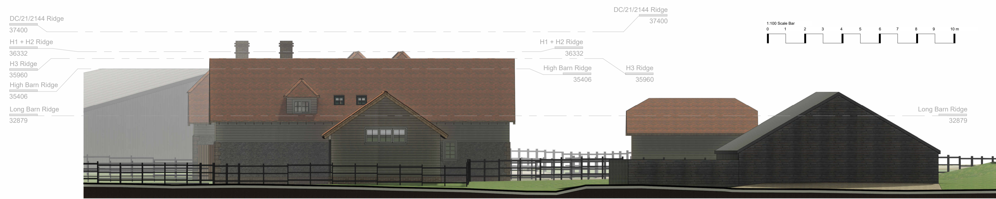
3 Site North 1 : 100