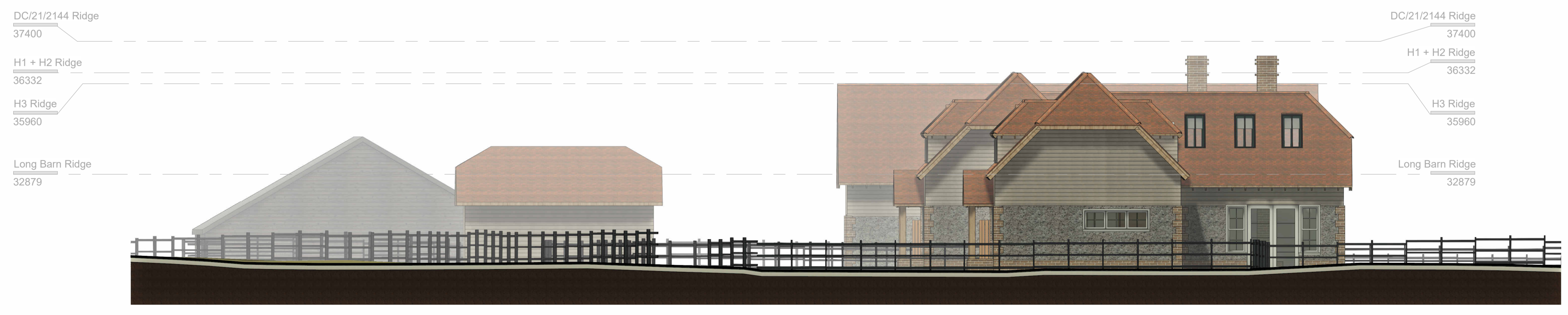
4 Site South 1 : 100