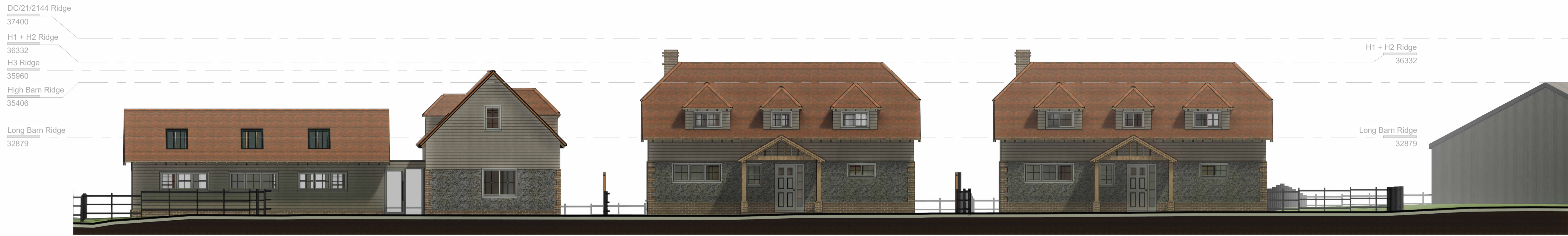
1 Site West 1 : 100