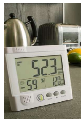
Figure 5: Image of OWL monitor