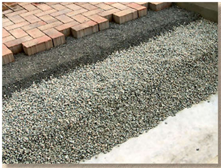
Figure 8: Typical permeable paving solution