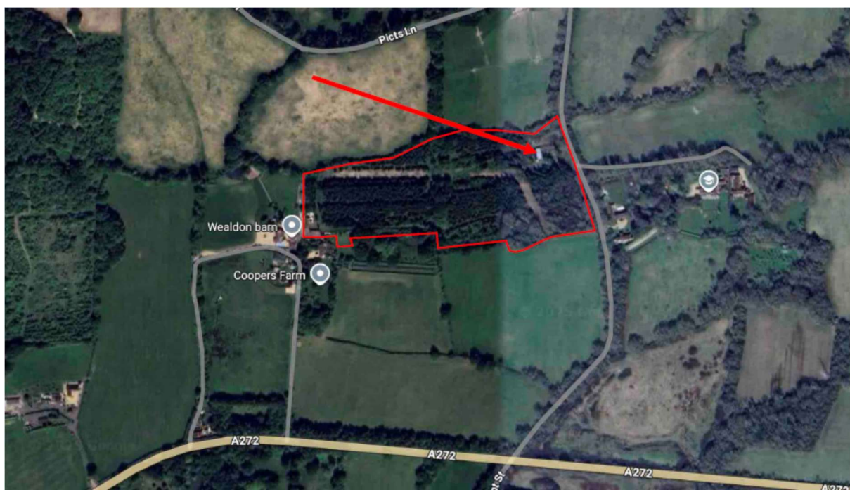
Figure 1: Aerial photo of site location and area