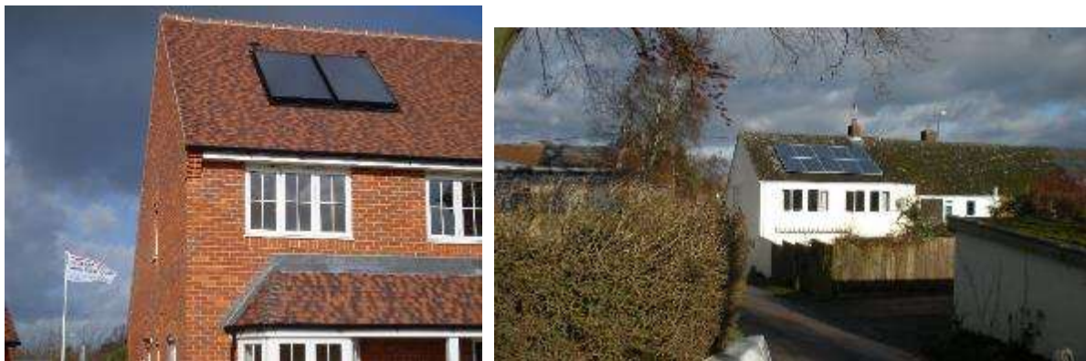
Figures 3 & 4: Solar thermal and solar PV installations on roofs