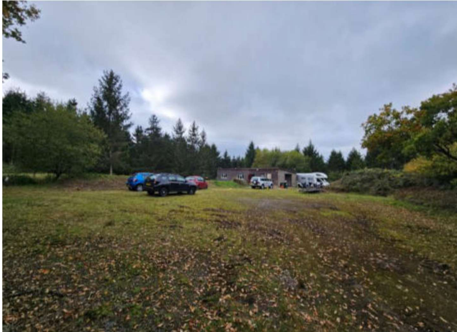
Figure 10: View of the sparsely vegetated urban land habitat in the NE of the site