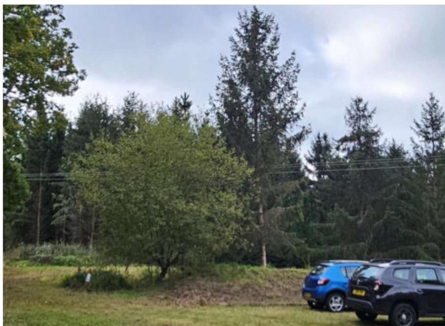
Figure 11: Scattered trees on the site