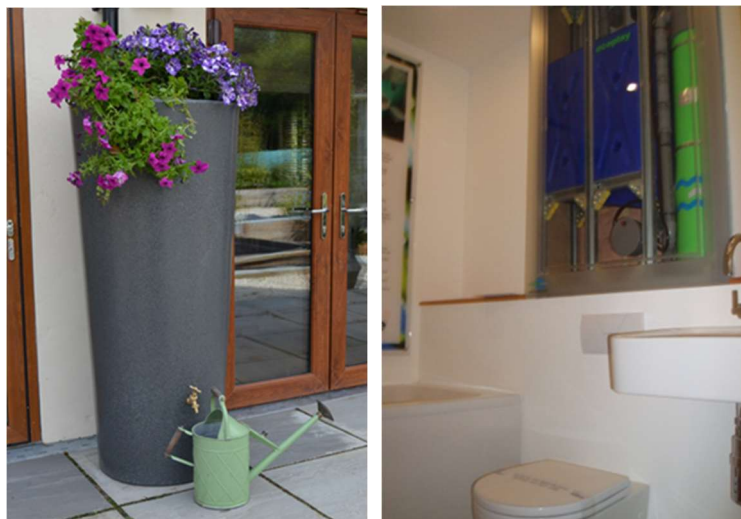
Figures 6 & 7: External rainwater harvesting butt & EcoPlay unit above WC