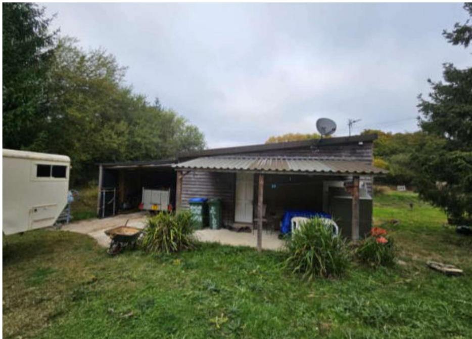
Figure 9: View of the building to be demolished