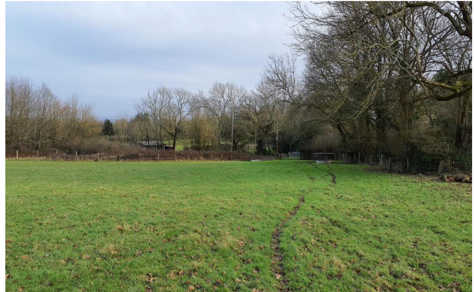
Plate 16: View from the centre of site looking east