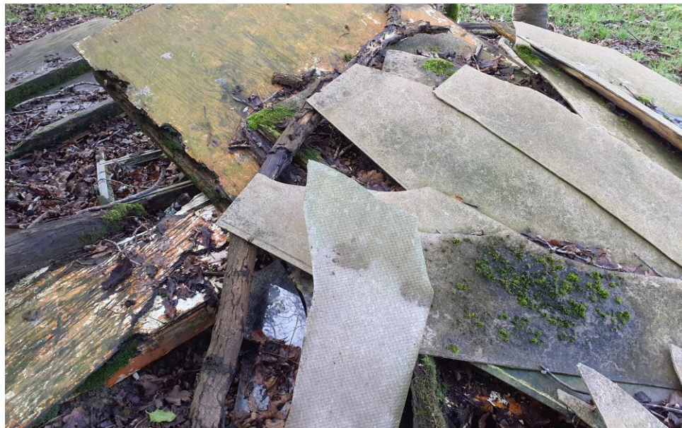
Plate 33: Wider shot of the potential ACM