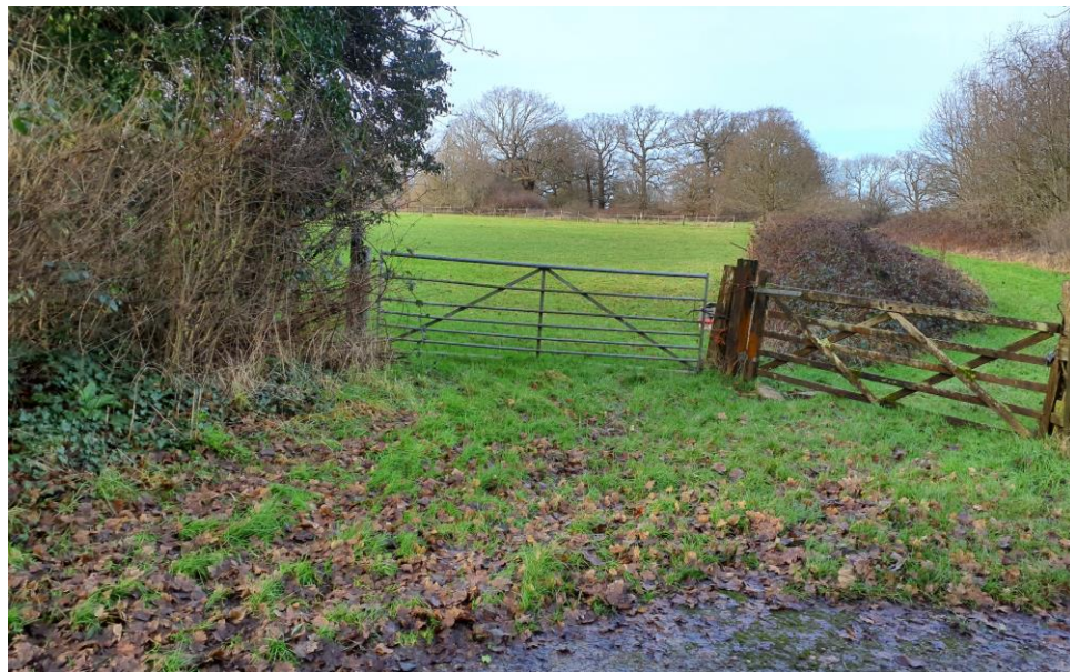
Plate 3: Access Gate into the site in the southeast corner