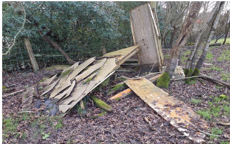
Plate 30: A further stockpile of sheeting material