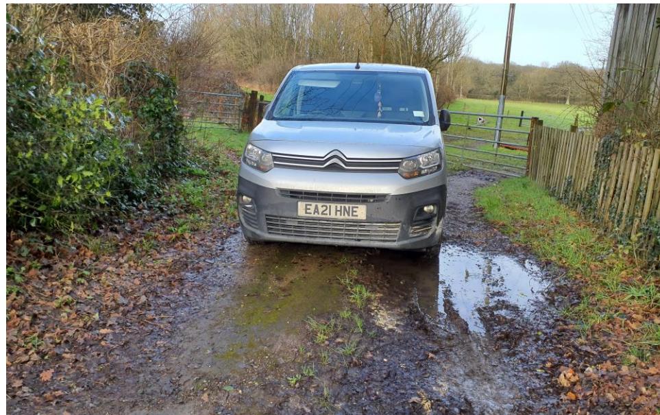
Plate 2: Access path showing shared access onto site and into adjacent field