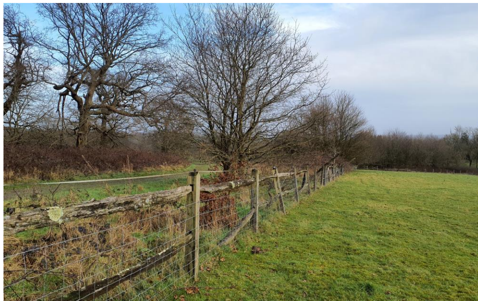
Plate 41: Northern boundary fence