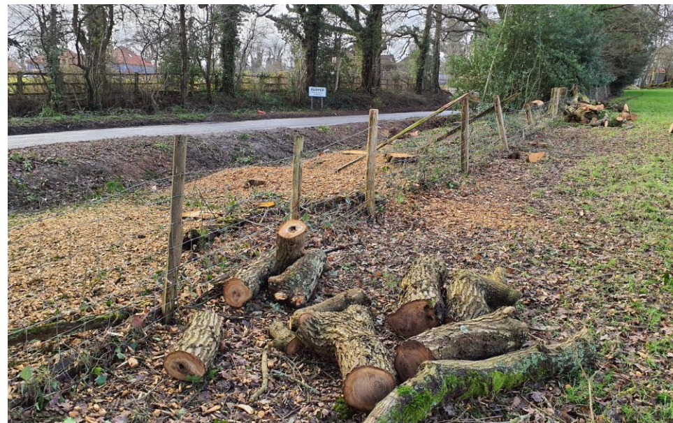
Plate 14: Timber left from removal of boundary trees