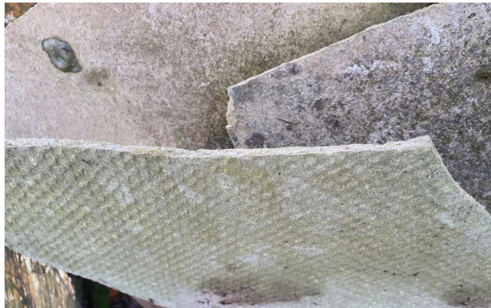
Plate 32: Close-up of potential Asbestos Containing Material (ACM) sheeting