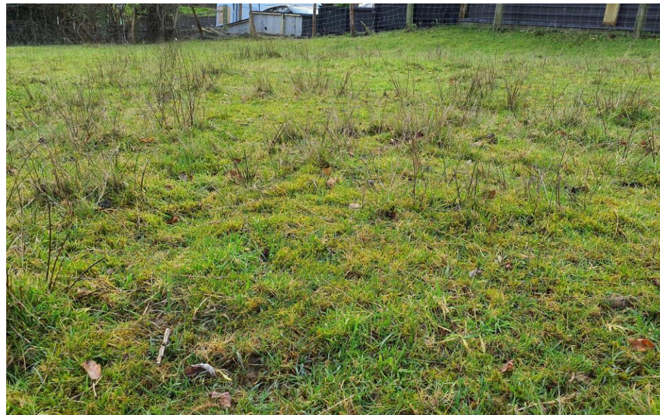
Plate 36: Low level vegetation