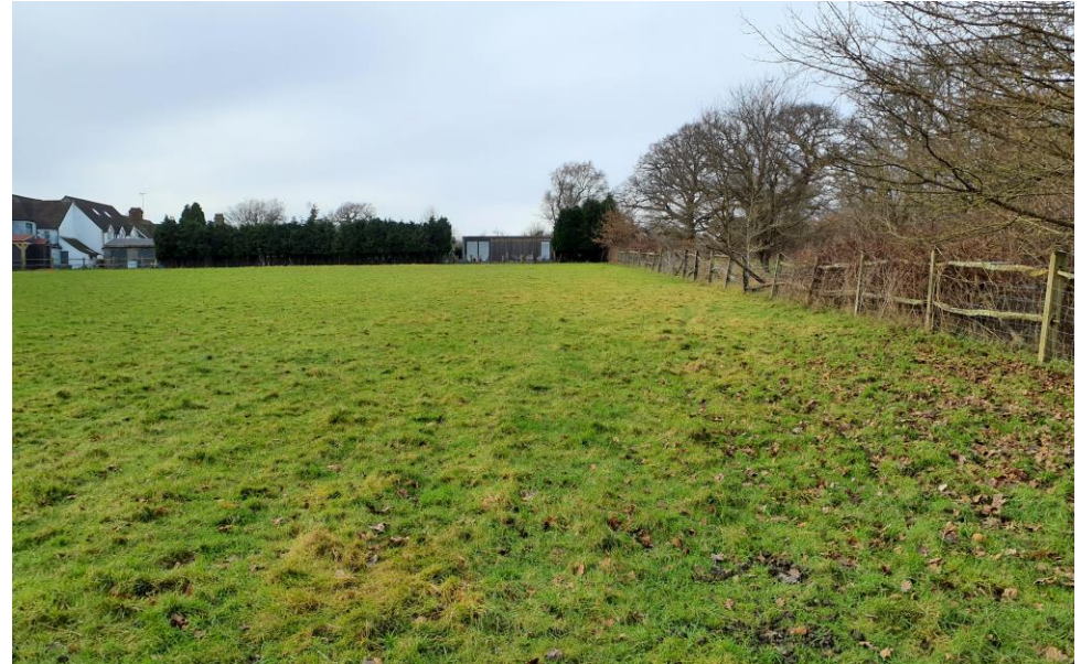
Plate 46: Northeast corner looking west