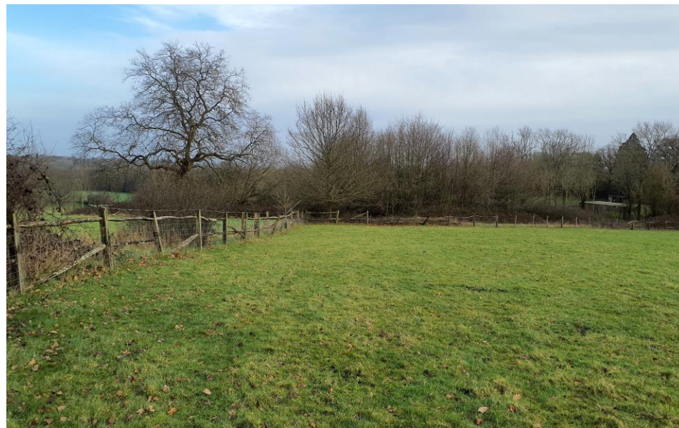
Plate 44: View of the northeast corner of the site