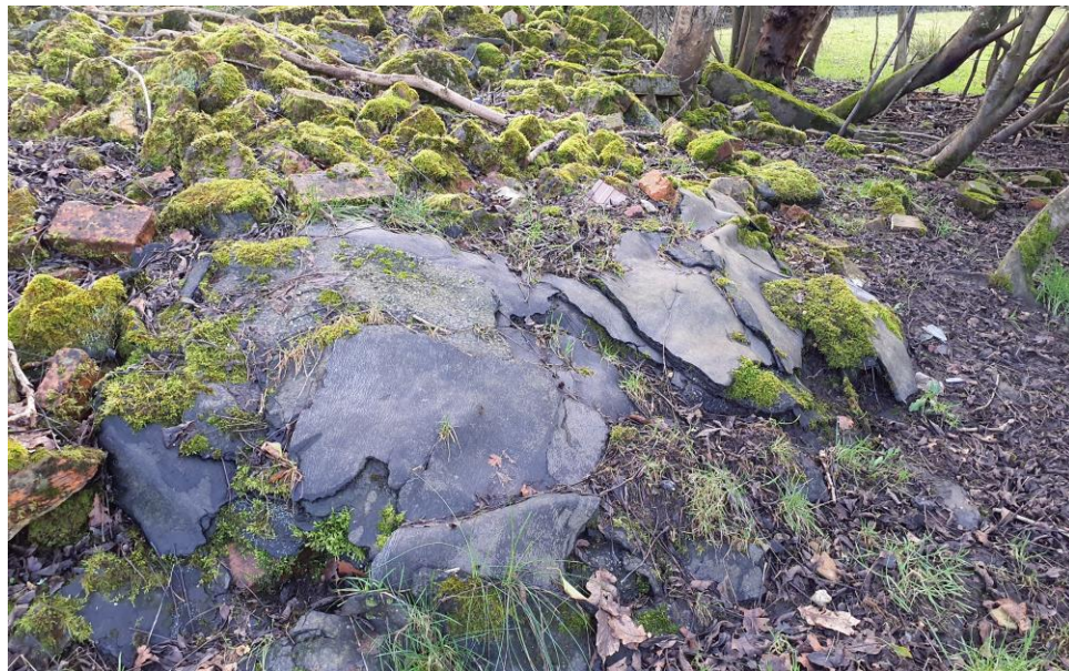
Plate 35: Further shot of the made ground