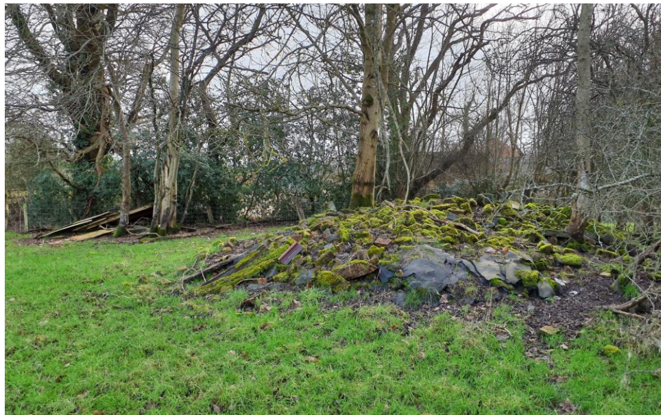
Plate 27: Made Ground Stockpile in the southern centre portion of site