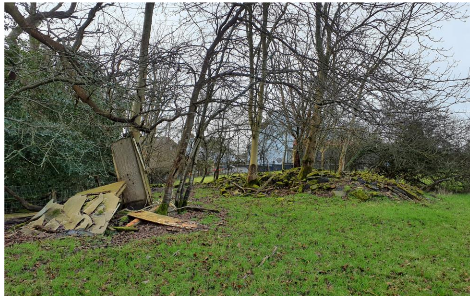
Plate 34: Wide shot of the two areas of made ground and potential ACM surrounded by mature trees c.15m in height