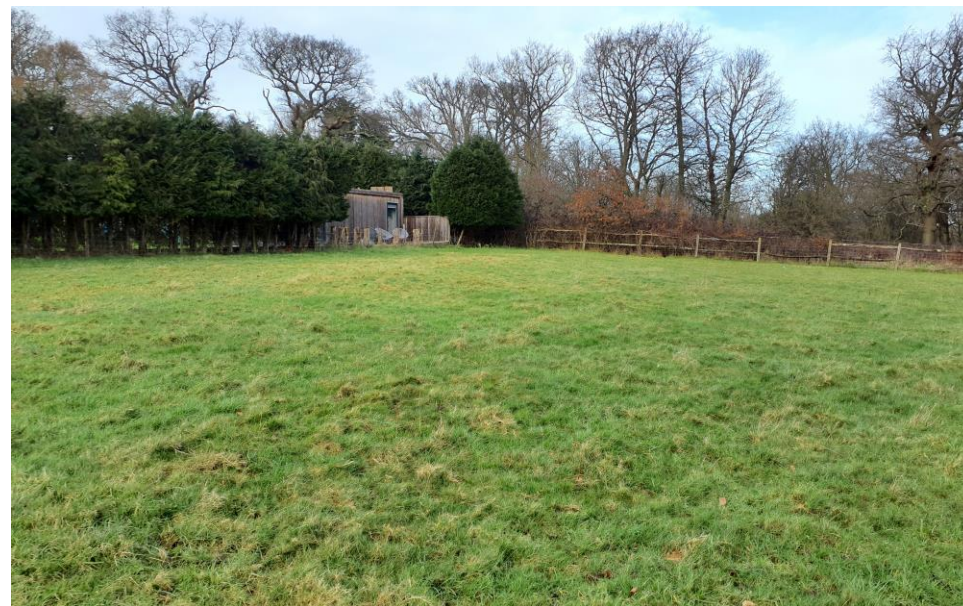
Plate 24: View of the northwestern corner of site, showing the northern boundary defined by vegetation and wooden fence. With the western boundary defined by a hedgerow and wooden fence