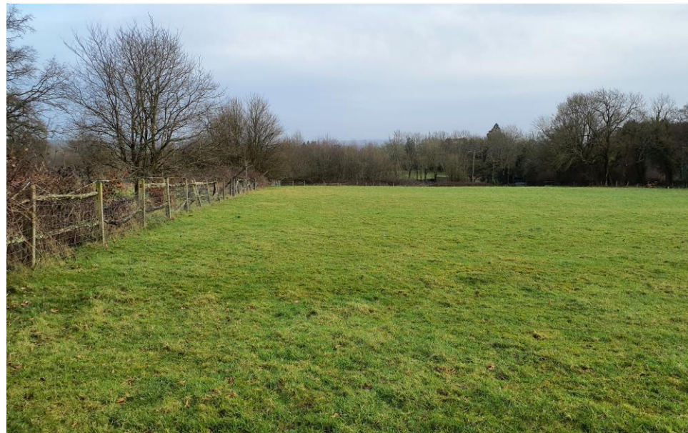
Plate 40: Northwest corner looking east