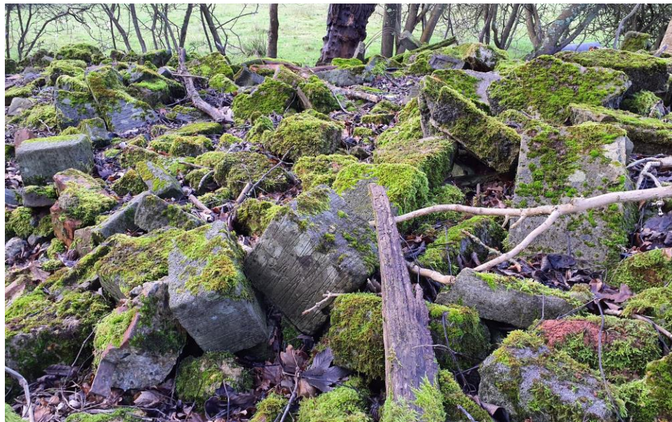
Plate 29: Further image of the made ground stockpile showing the materials