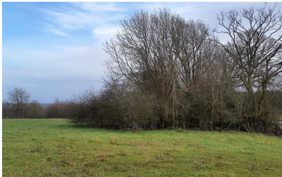
Plate 37: Area of vegetation in the southern central portion of the field