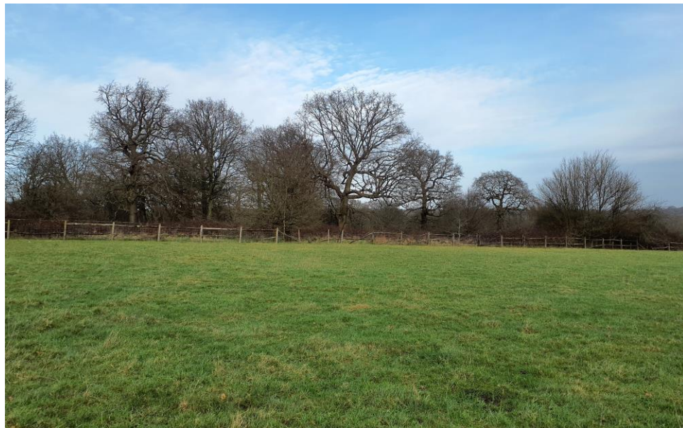
Plate 25: Northern boundary with mature trees and fencing