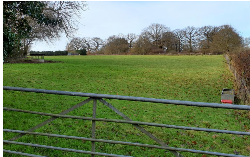
Plate 4: View into site from access gate