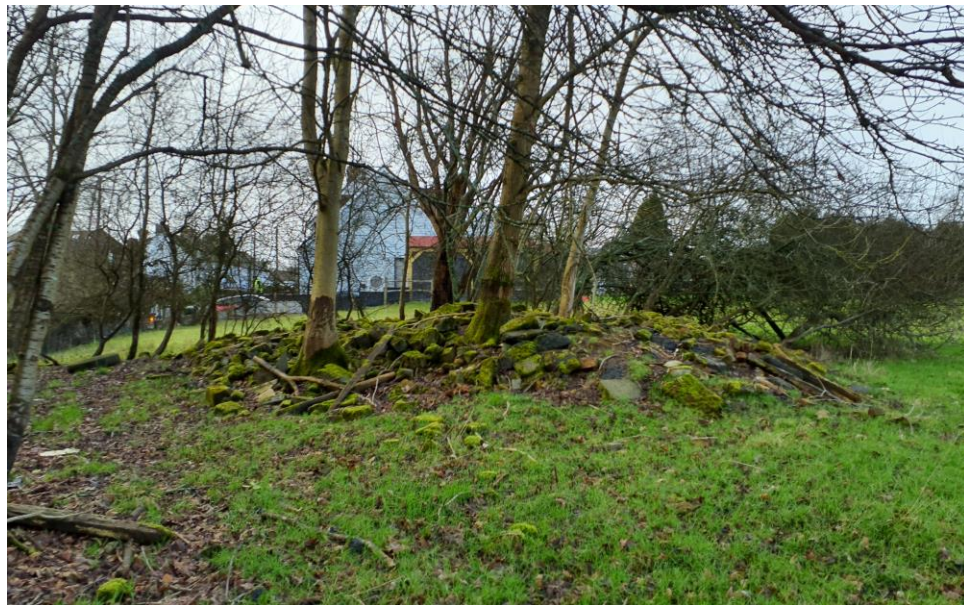
Plate 31: Made ground stockpile looking west