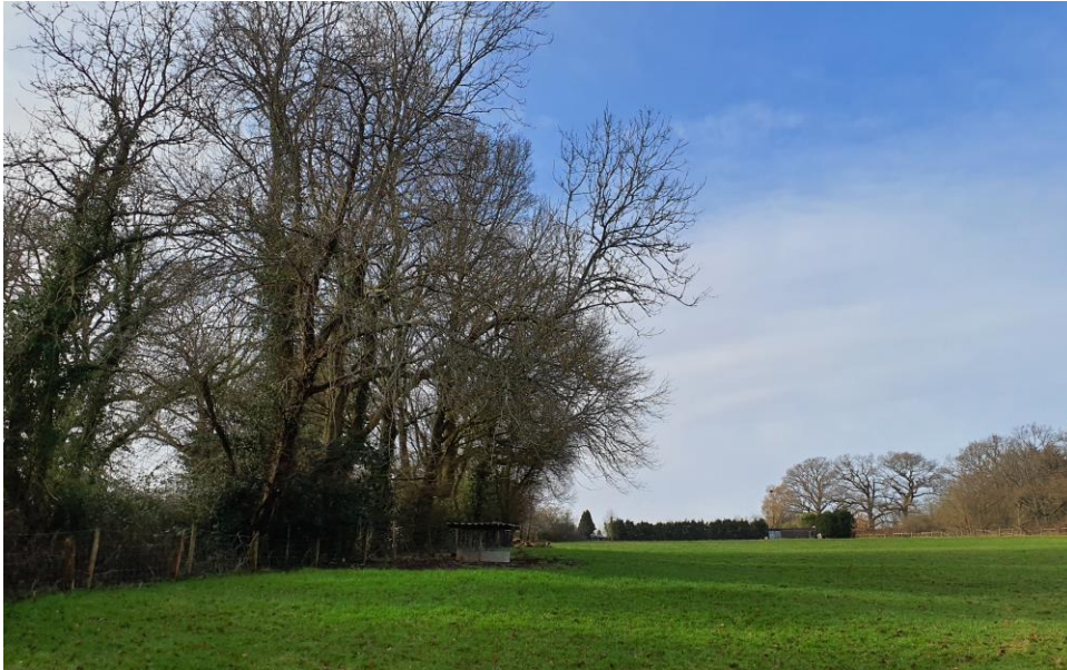
Plate 11: Mature trees along southern boundary