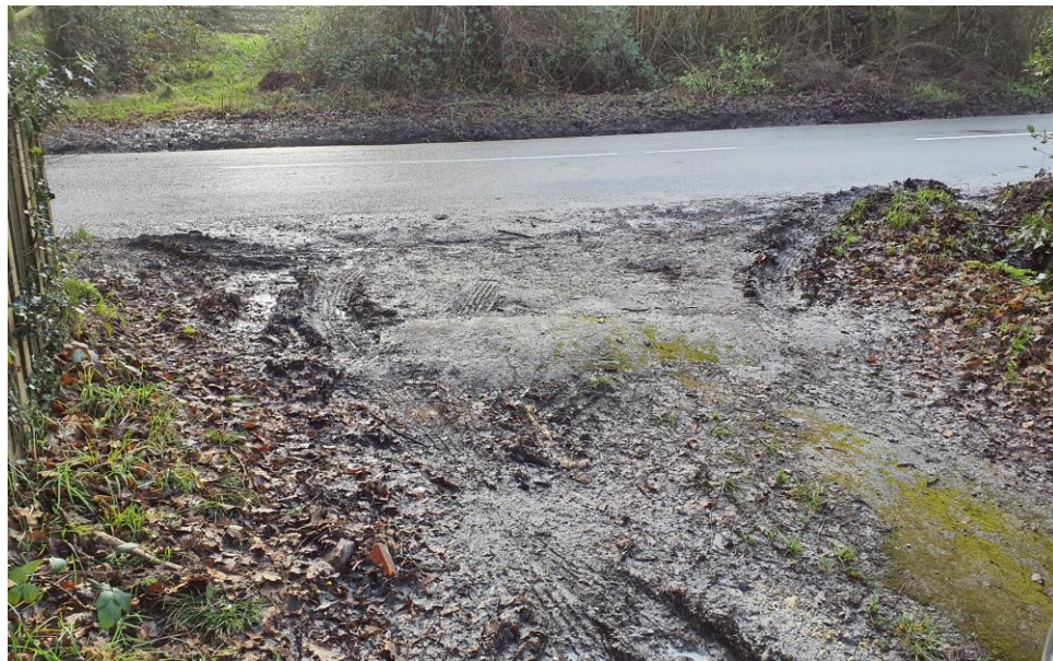
Plate 1: Access Path from East Street, Rusper