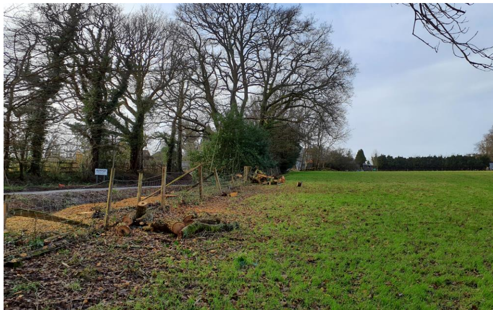
Plate 13: Southern boundary with East Street showing the boundary fence and signs of tree felling