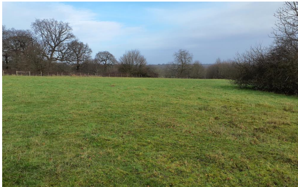
Plate 39: West boundary looking east