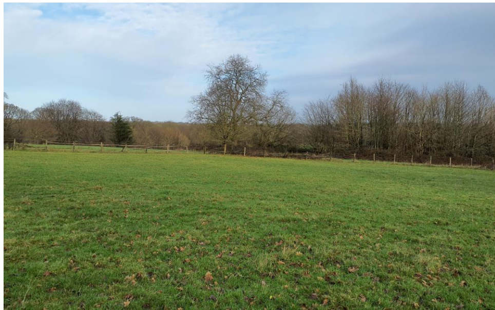
Plate 17: View from the centre of the site to the northeast corner