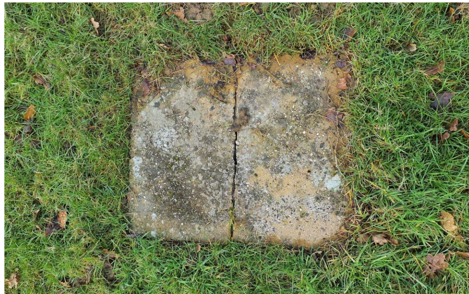
Plate 20: Concrete cover, could not be lifted