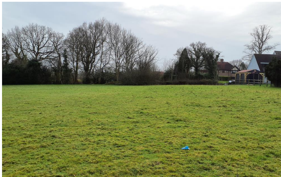
Plate 43: North looking south