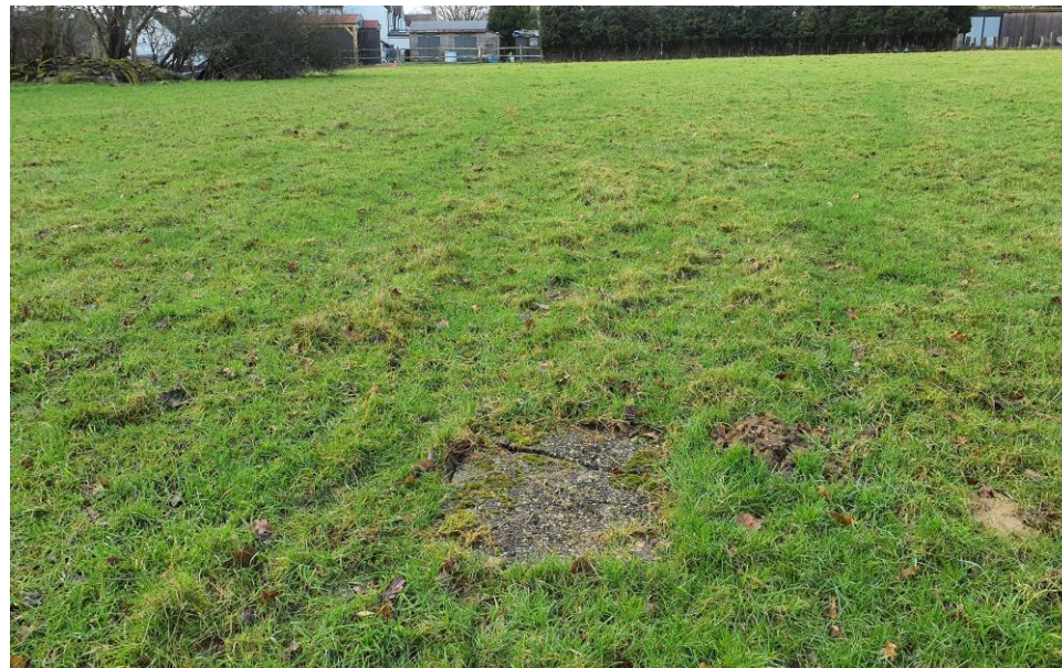
Plate 18: Concrete cover present in the centre of the site area