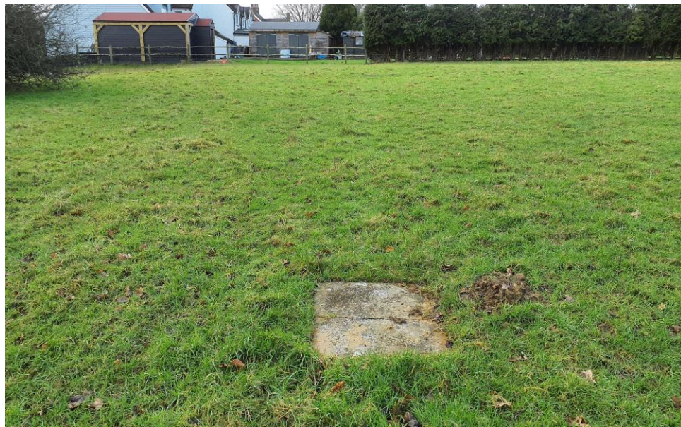
Plate 19: Second concrete cover