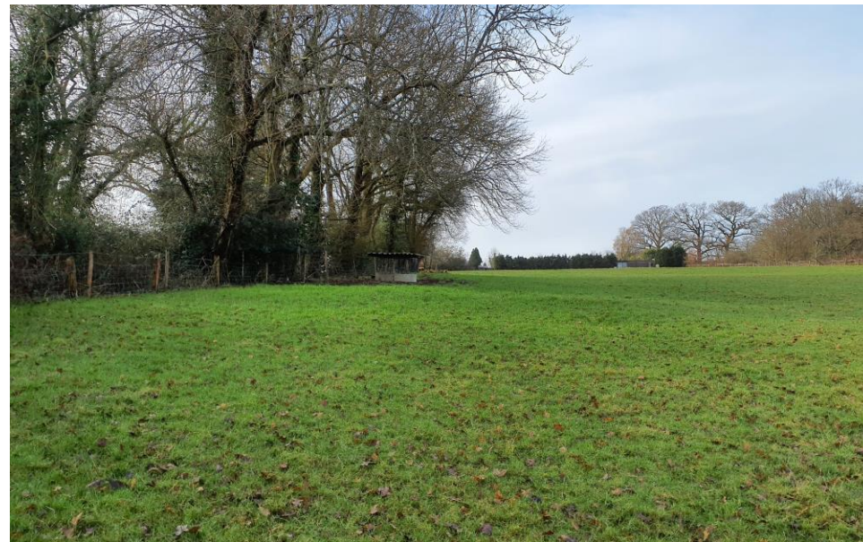
Plate 8: View from east looking west showing mature trees c.15m in height running along the southern boundary