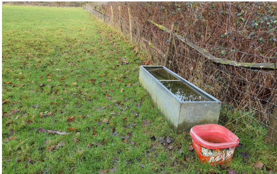
Plate 7: Trough located along eastern boundary