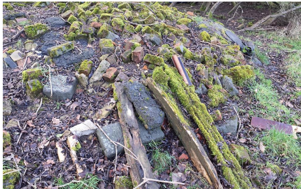
Plate 28: Made Ground in stockpile included brick concrete and wooden fragments among others