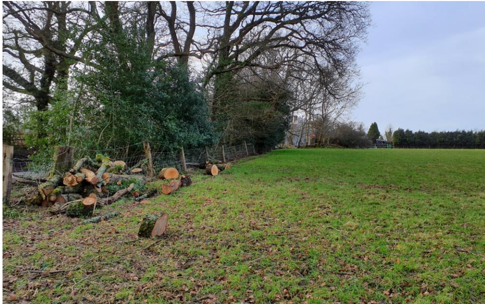
Plate 15: Further timber from tree removal. Southern boundary from the centre of site looking west