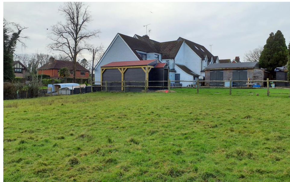
Plate 22: The western boundary is defined by a residential property with a wooden fence c.1.5m tall