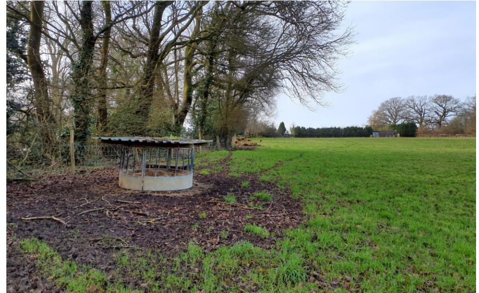
Plate 12: Feed trough along the southern boundary