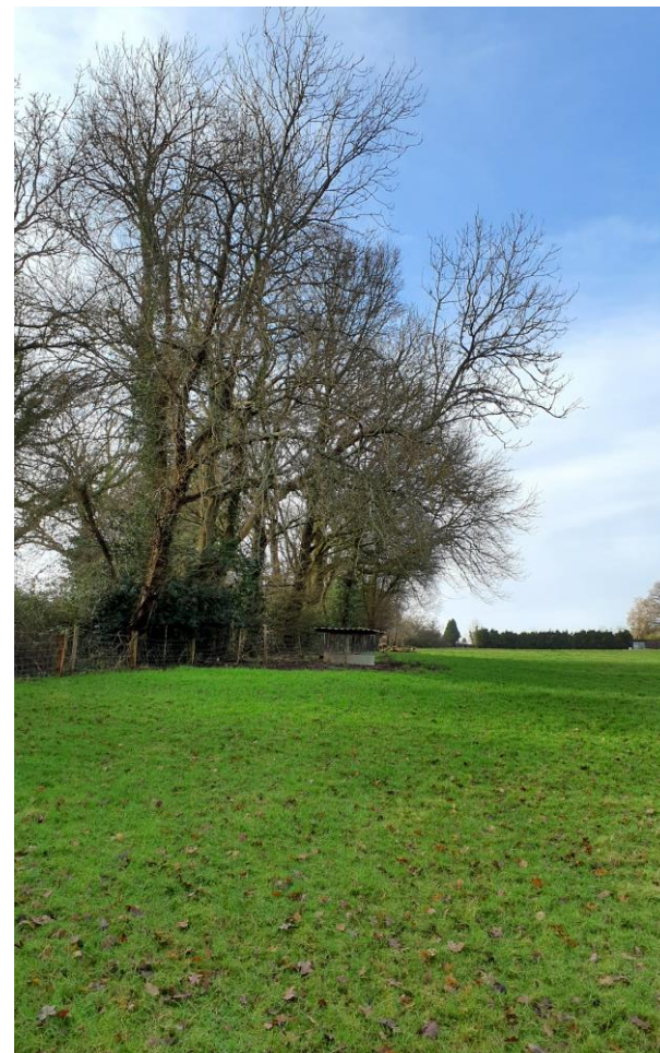
Plate 10: Mature trees c.15m in height along the southern boundary a feed trough is noted