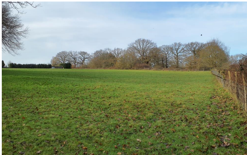
Plate 9: View from the southeast corner looking northwest showing mature trees c.12-15m in height running along the northern boundary