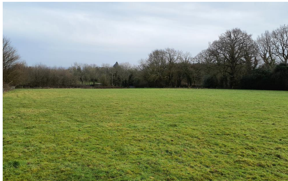
Plate 42: Northern centre of the site looking southeast