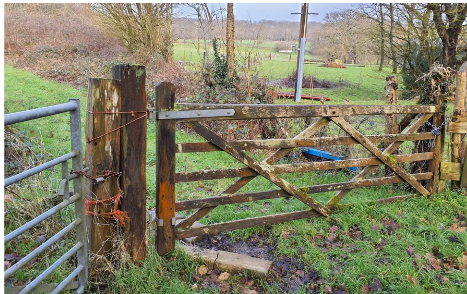
Plate 6: Adjacent access gate to pathway which runs adjacent to the site