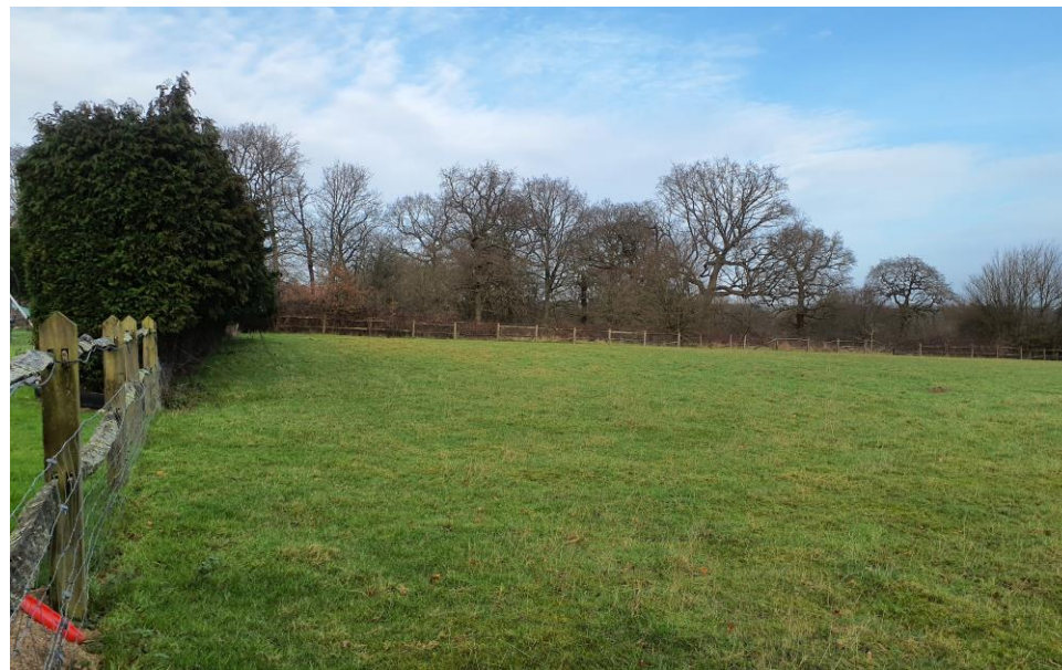
Plate 38: Southwest corner looking toward the northwest corner