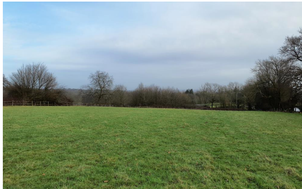
Plate 26: Northeast corner of the site