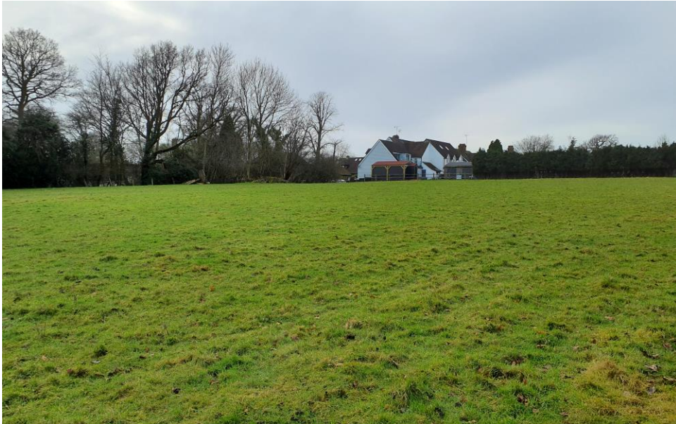
Plate 45: Northeast corner of the site looking southwest