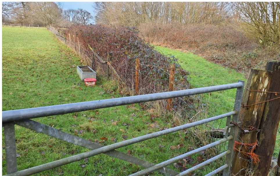
Plate 5: Fencing runs along boundary c.1m in height