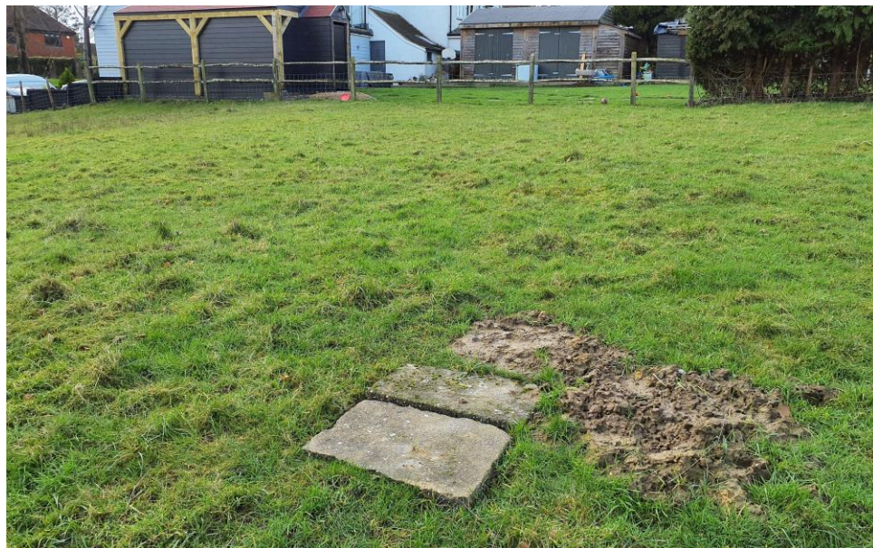
Plate 21: Third concrete cover could also not be lifted