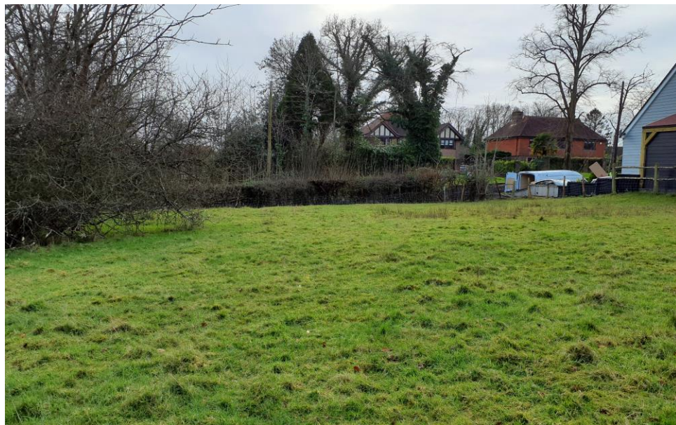
Plate 23: View of the southwestern corner of site, showing the boundary with East Street defined by a hedgerow c.2m in height