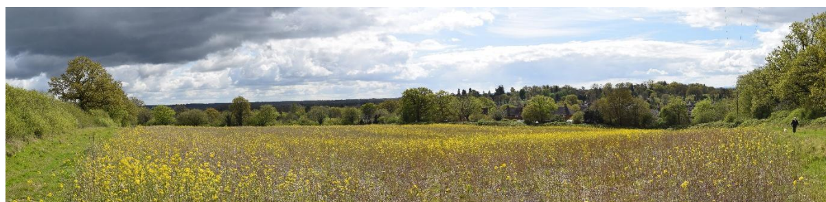
View from the Northwest corner of the site, looking over and beyond the site, onto Warnham.