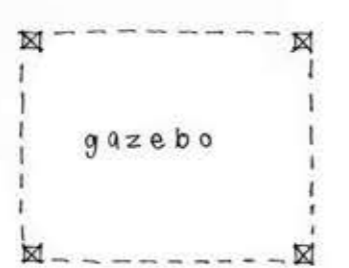
GROUND FLOOR PLAN 1:100 @ A3 0 1 2 3 4 5m metres