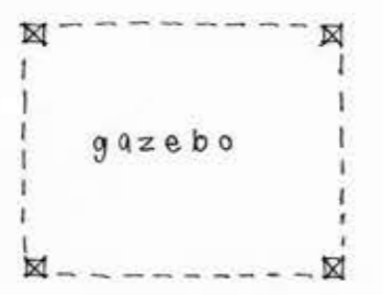
GROUND FLOOR PLAN 1:100 @ A3