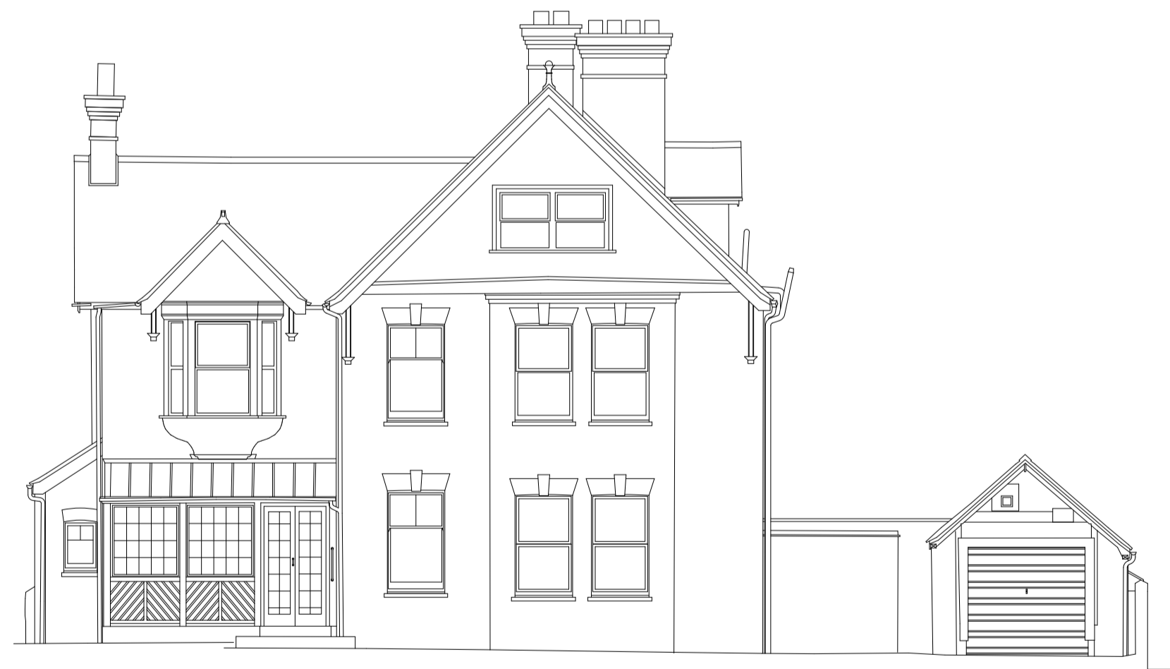
Proposed North West Elevation