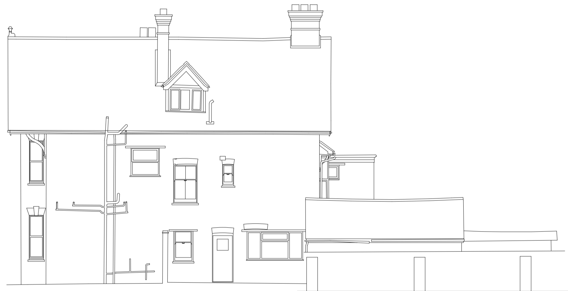
Proposed South West Elevation