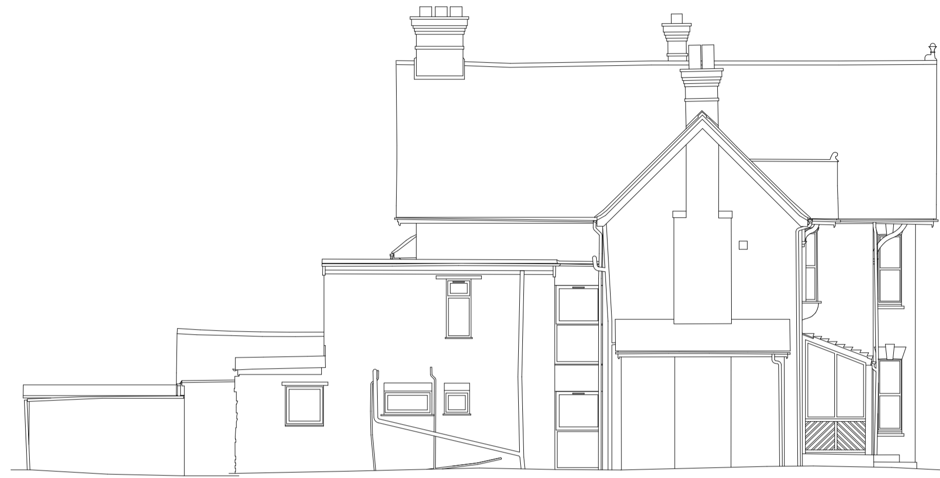
Proposed North East Elevation