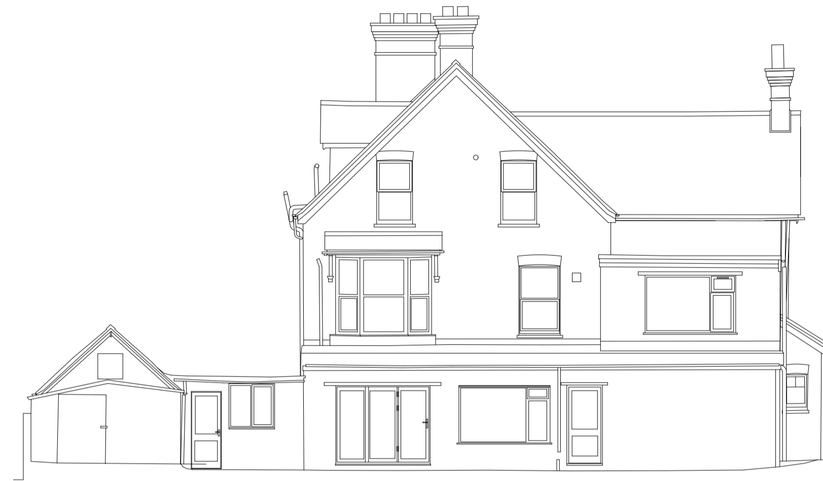
Proposed South East Elevation