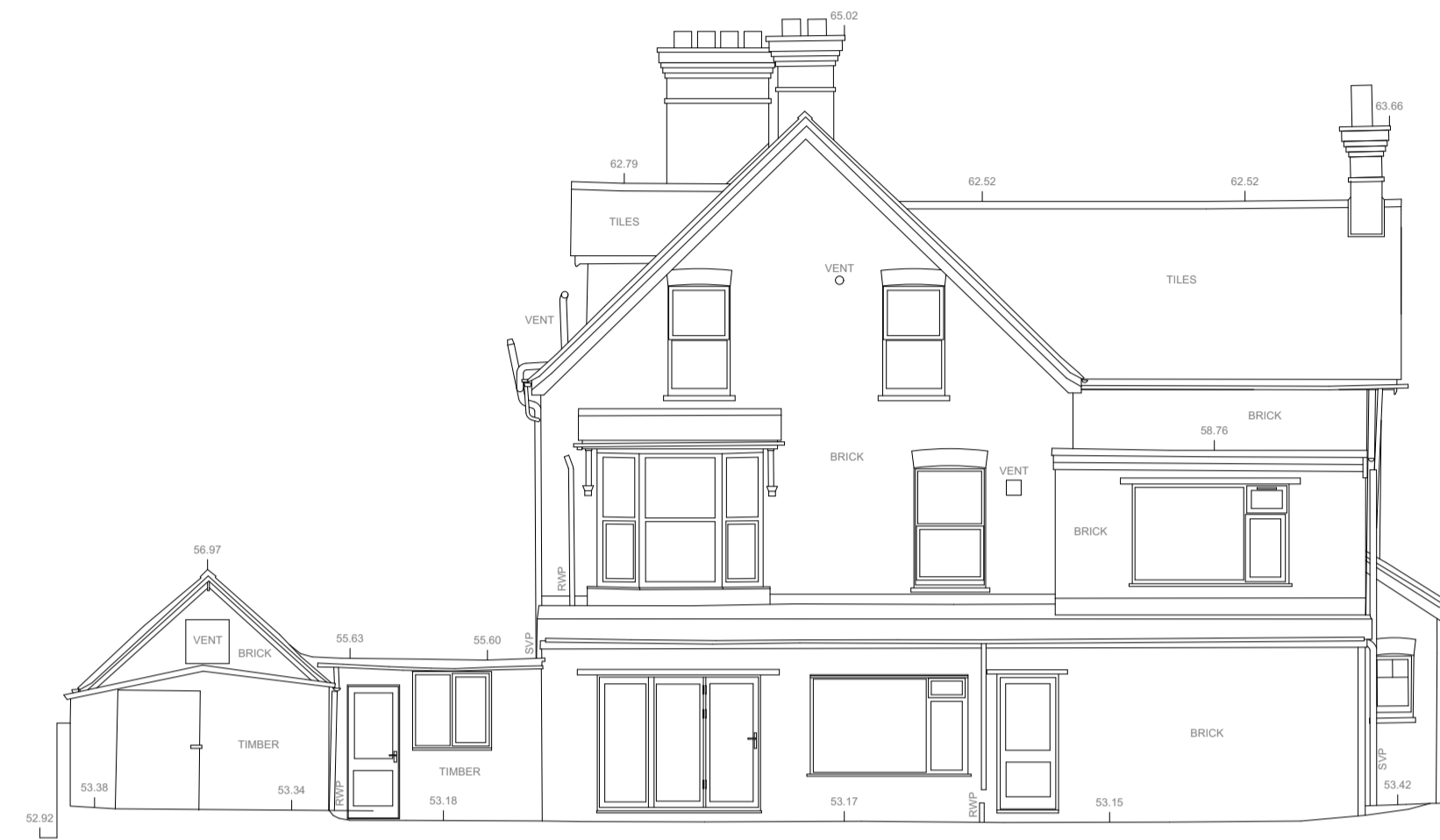
Existing South East Elevation