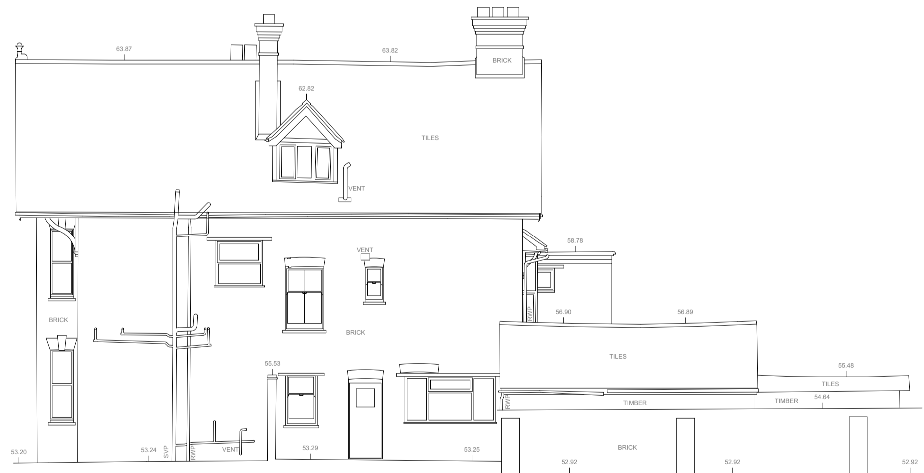
Existing South West Elevation