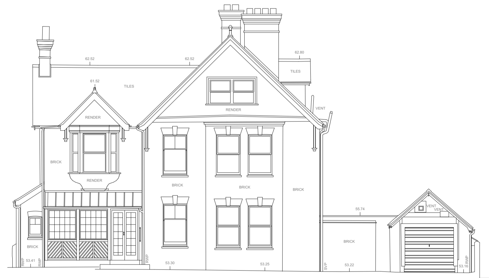
Existing North West Elevation