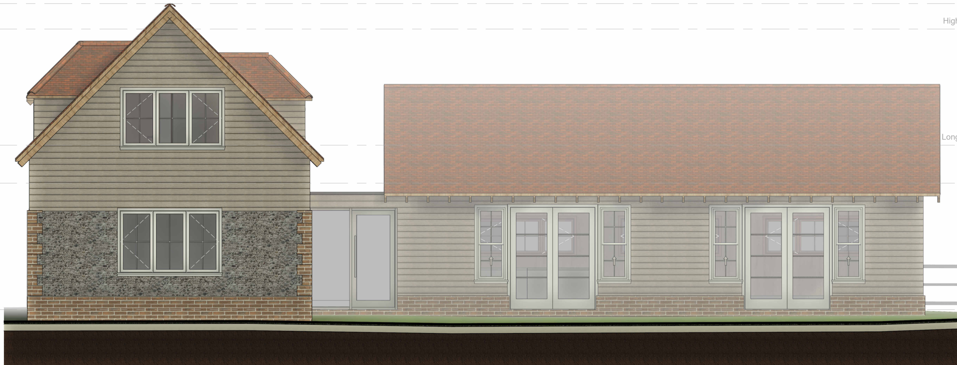
4 House Type 2 - East Elevation 1 : 50