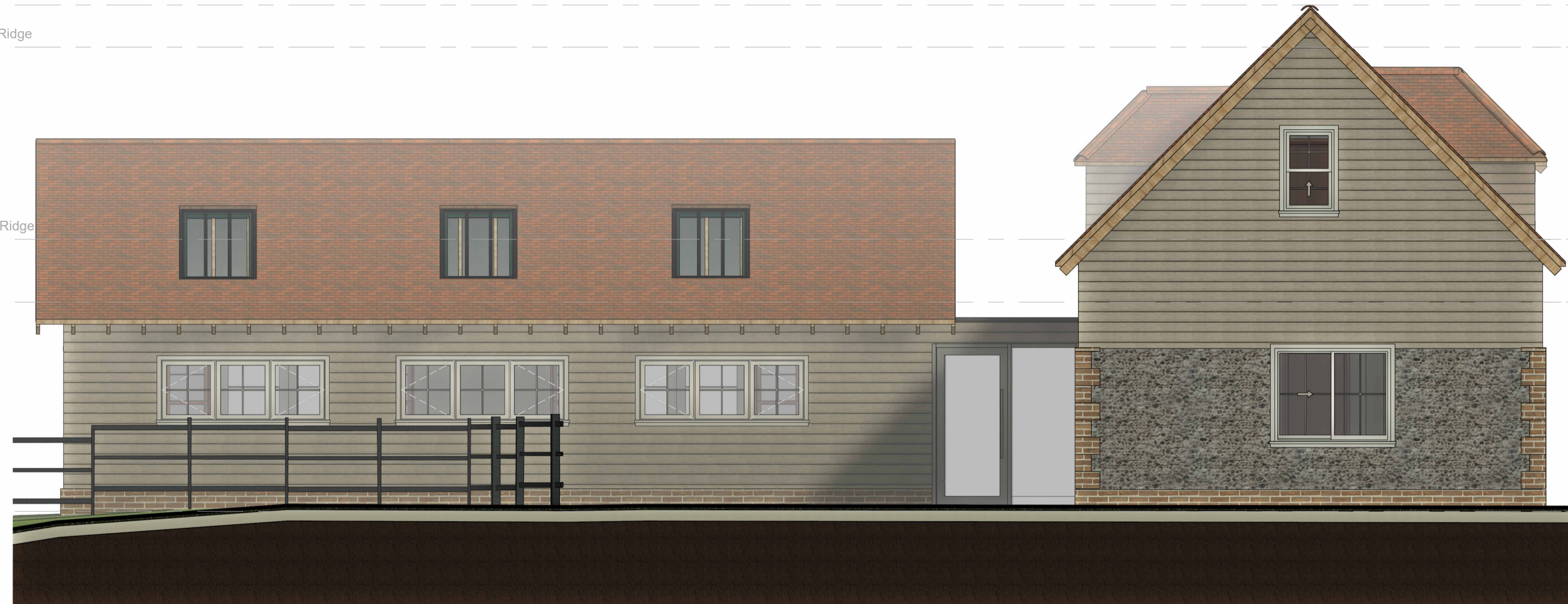
1 House Type 2 - West Elevation 1 : 50