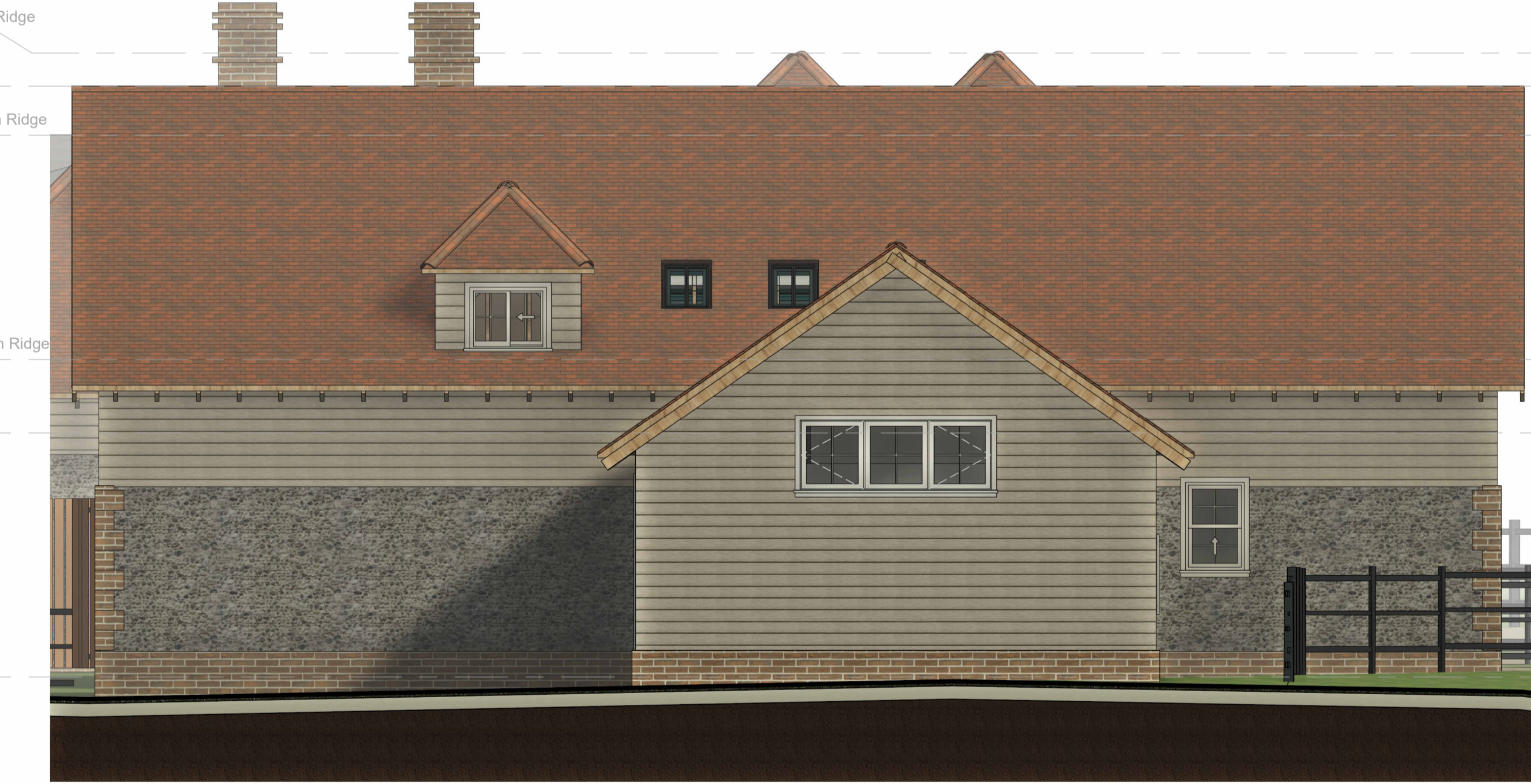
3 House Type 2 - North Elevation 1 : 50