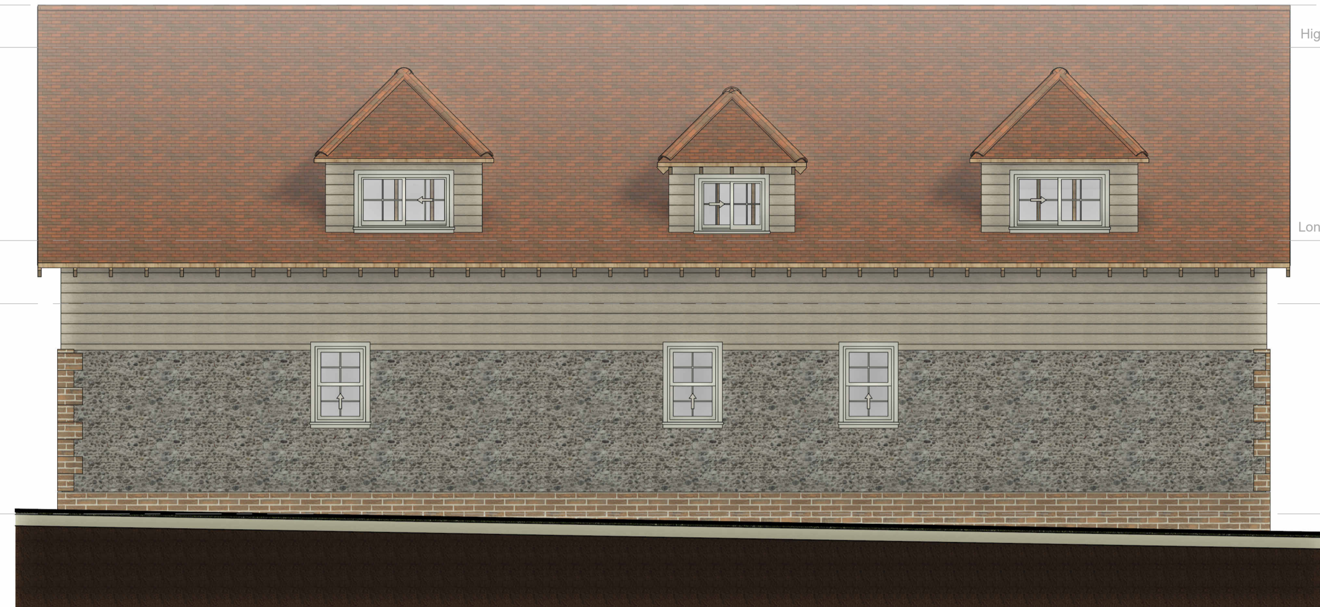
2 House Type 2 - South Elevation 1 : 50