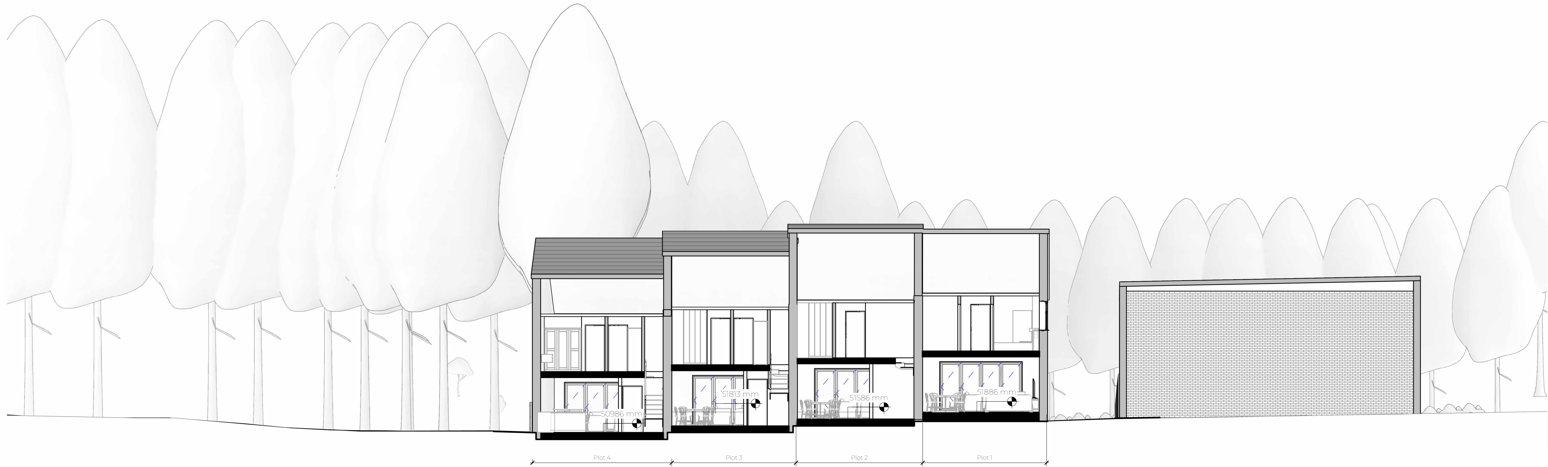
Section A-A 1 : 100