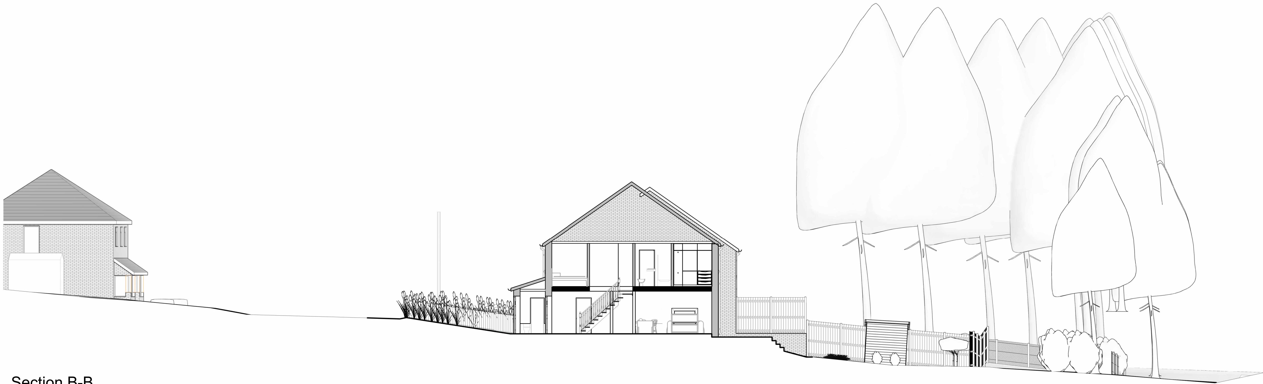
Section B-B 1 : 100