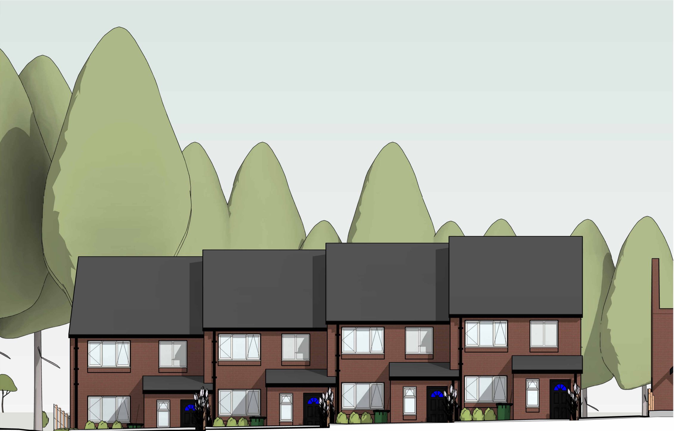
West Elevation 1 : 100