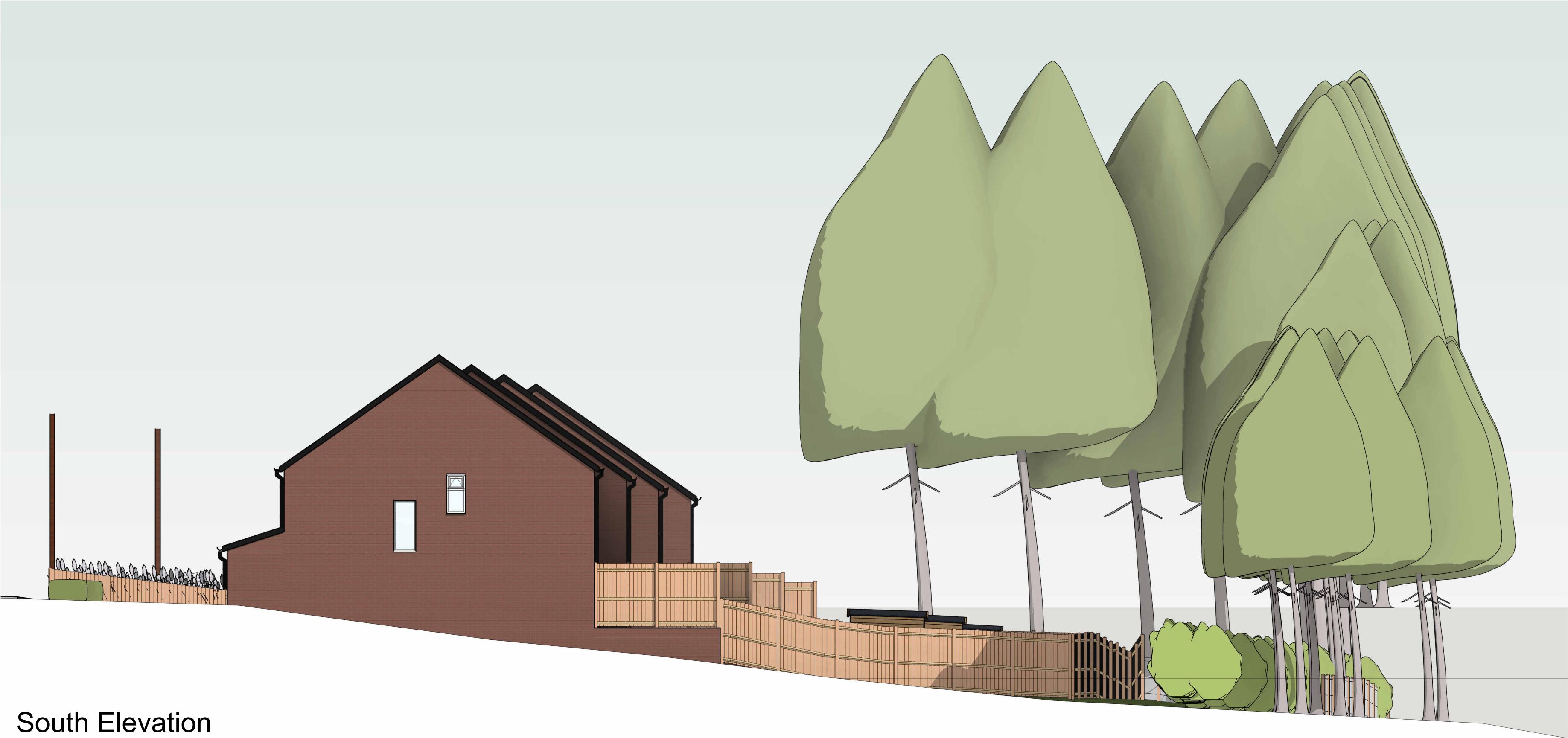
South Elevation 1 : 100