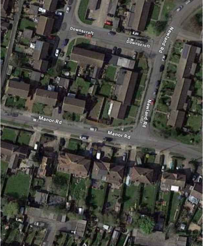
Ariel view (NTS)