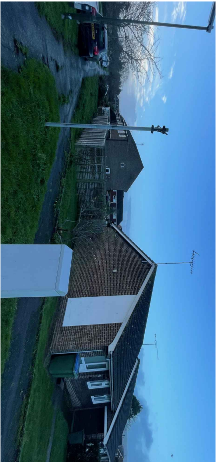
Street view (NTS)