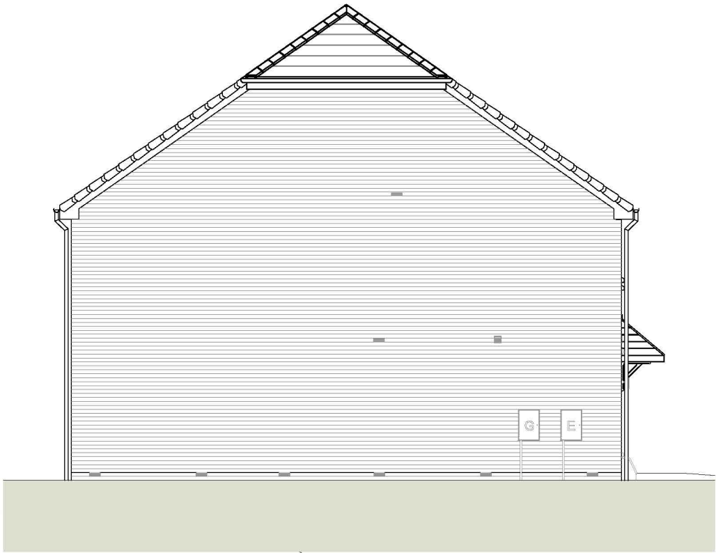
2 Gable Elevation 1 : 100