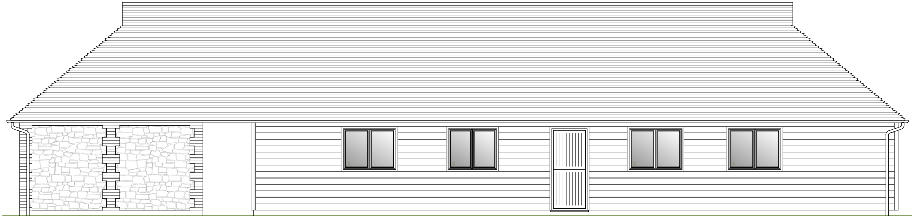
West 1:100 | PROPOSED

This drawing is the copyright of Manorwood Construction Ltd but may be used for planning purposes by the Local Authority without breach of copyright.