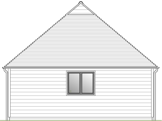
South 1:100 | PROPOSED