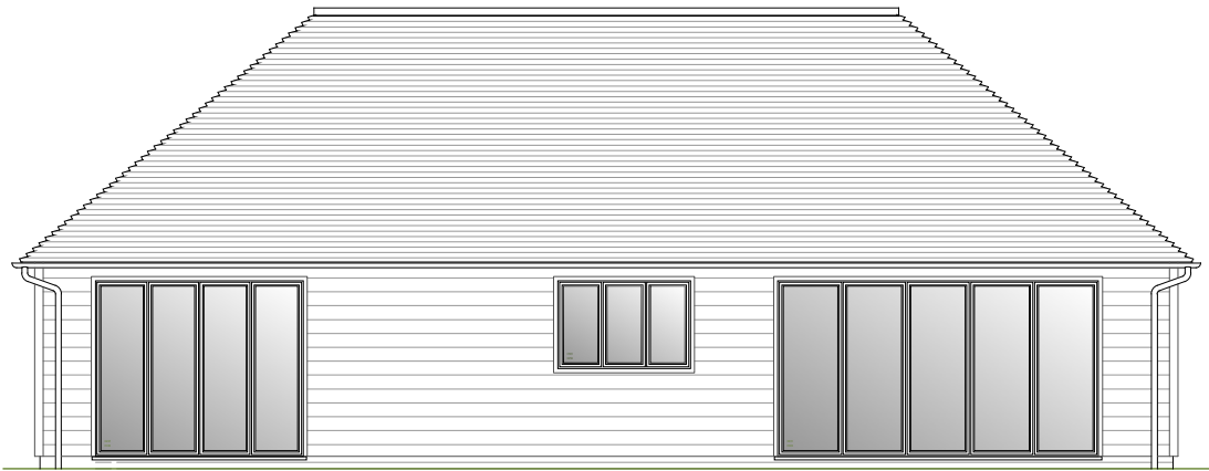
West 1:100 | PROPOSED

This drawing is the copyright of Manorwood Construction Ltd but may be used for planning purposes by the Local Authority without breach of copyright.