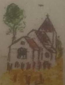
St Margaret's Church

Some of the main attractive buildings in this area are the Plough Inn, The Church of St Margaret (which dates from the 13th Century) and the Ifield Barn Theatre, a former threshing barn which is now used as a delightful setting for a local theatre.