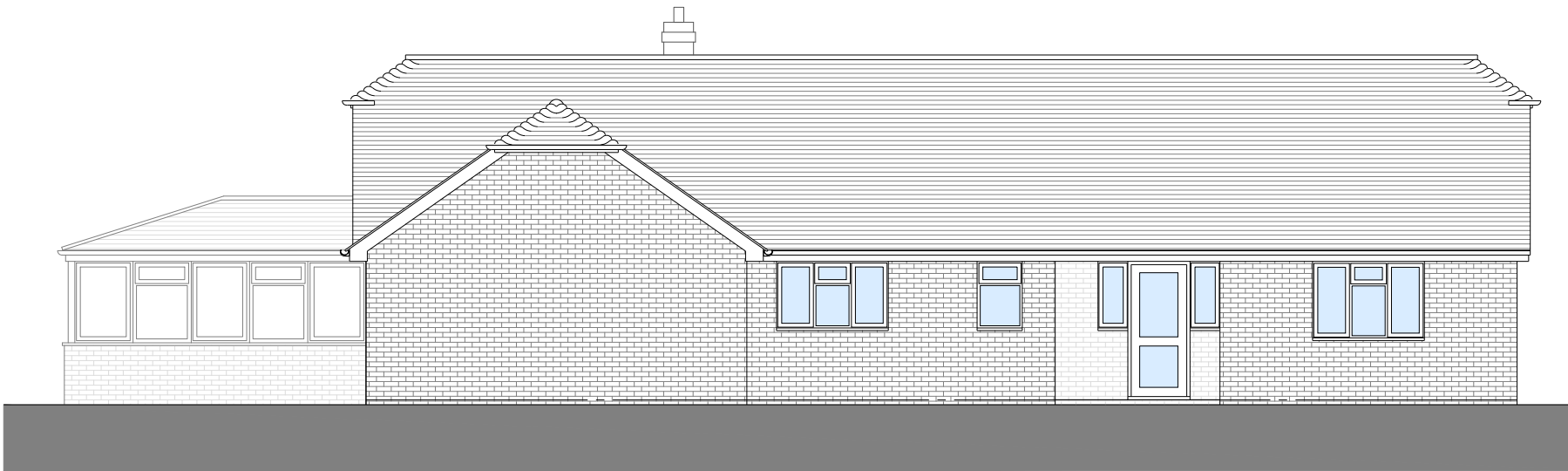
EXISTING FRONT ELEVATION (North)