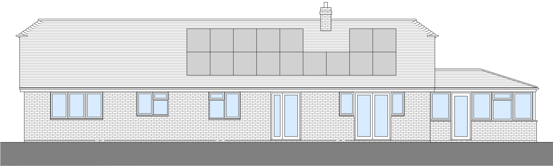
EXISTING REAR ELEVATION (South)