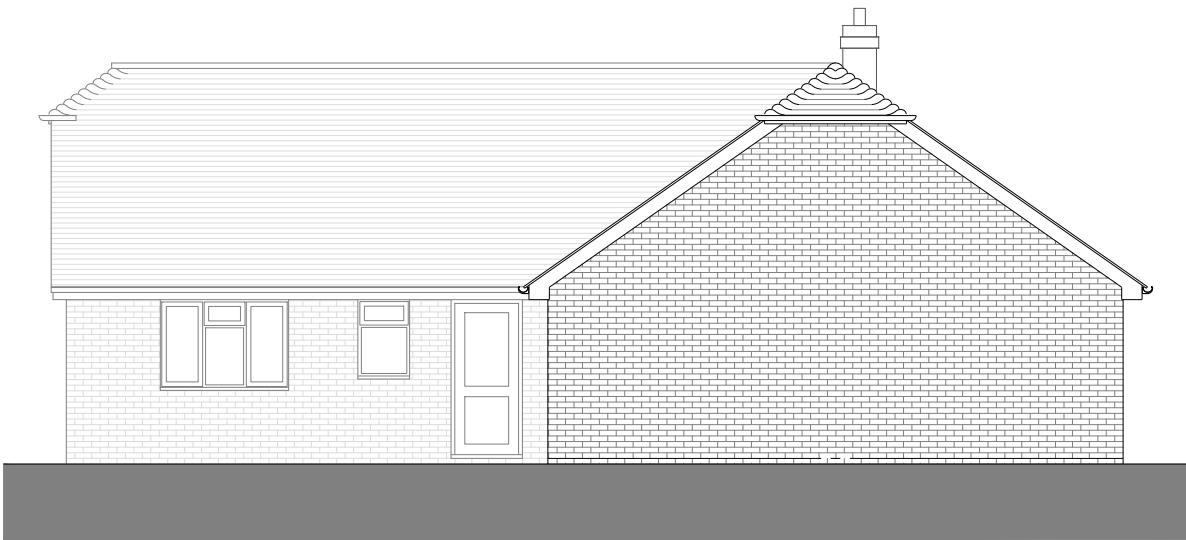
EXISTING SIDE ELEVATION (West)