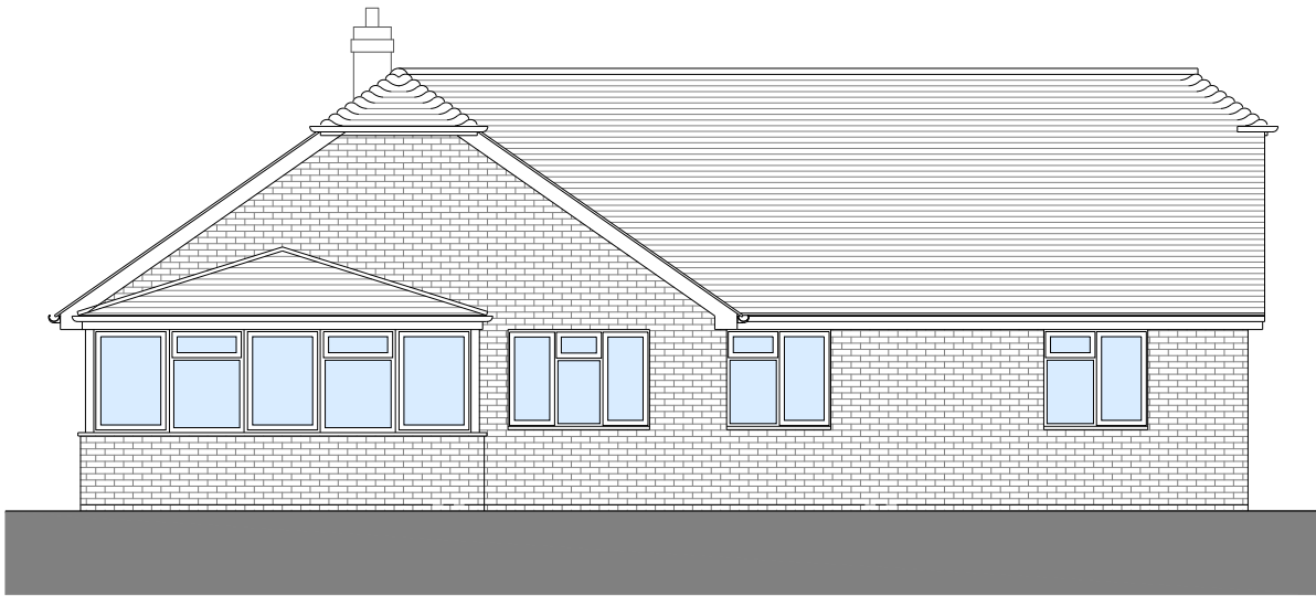
EXISTING SIDE ELEVATION (East)