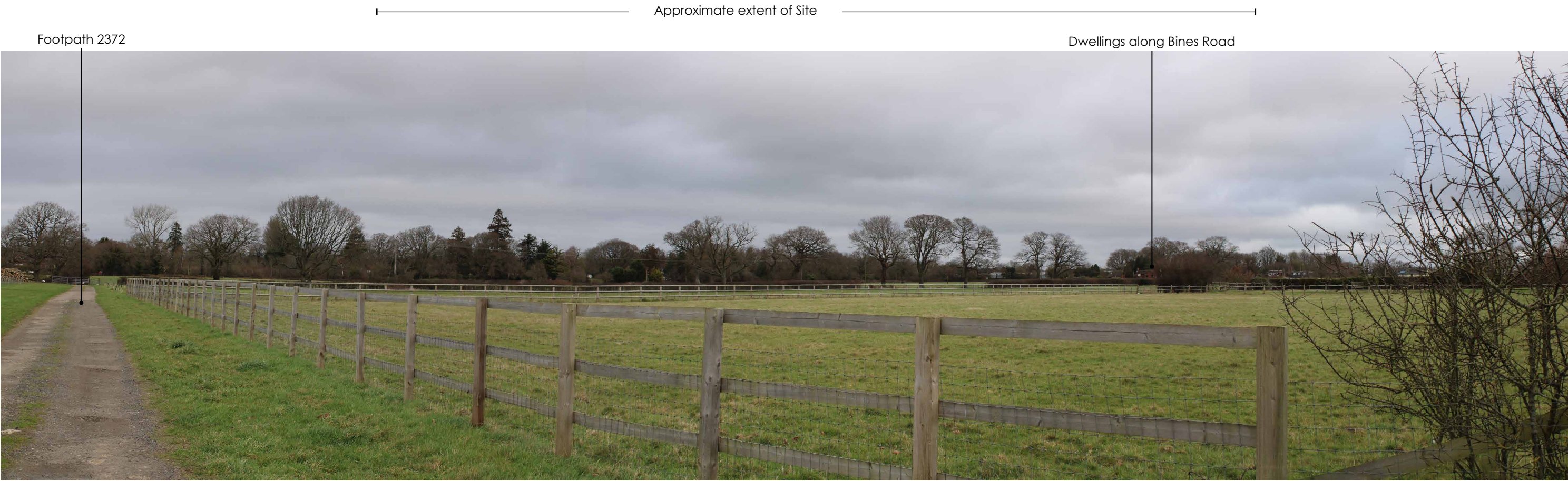
Photograph 19 View from Footpath 2372 south west of Site

Visualisation Type 3 - Existing View Cylindrical projection 48% @ A3, 96% @ A1 05.02.2024, 10:21 Canon 2000D 1.6x, Canon EF-S 18-55mm HfoV 90° Viewpoint Location (Lat, Long): 50.9529, -0.3131 Viewpoint altitude 8m AOD plus 1.5m (approx, rounded to nearest 0.5m) Location data based on Samsung F21 SE GPS & Google Earth Distance to closest boundary edge (approx): 195m Looking direction: NE