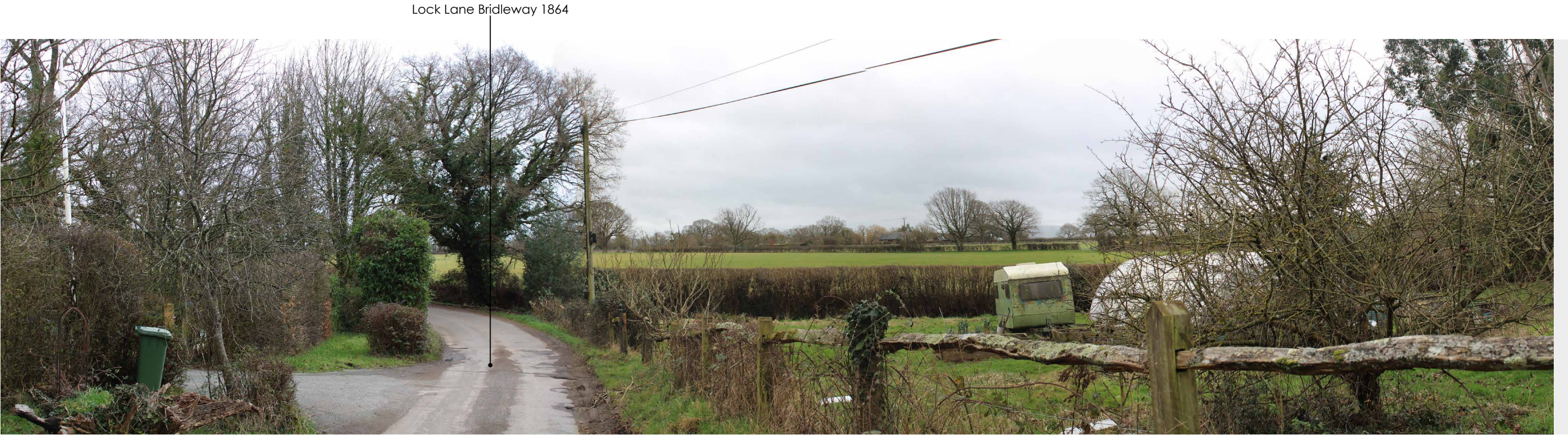
Photograph 14 View from Lock Lane Bridleway 1864 north west of Site

Visualisation Type 3 - Existing View Cylindrical projection 48% @ A3, 96% @ A1 05.02.2024, 11:29 Canon 2000D 1.6x, Canon EF-S 18-55mm HfoV 90° Viewpoint Location (Lat, Long): 50.9561, -0.3147 Viewpoint altitude 9m AOD plus 1.5m (approx, rounded to nearest 0.5m) Location data based on Samsung F21 SE GPS & Google Earth Distance to closest boundary edge (approx): 180m Looking direction: SE