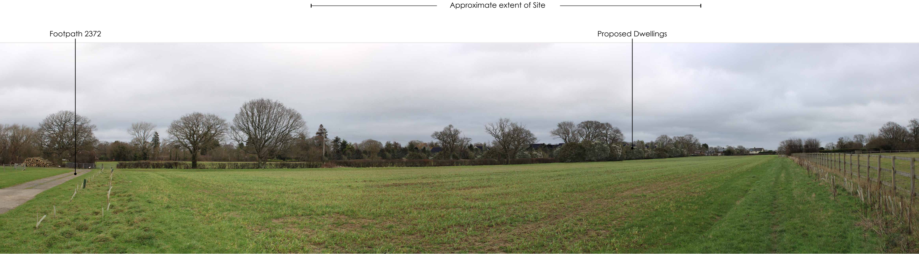
Photograph 13 View from south-west corner of field south of Site, immediately adjacent to Footpath 2372

Visualisation Type 3 - Proposed View Year 15 Cylindrical projection 48% @ A3, 96% @ A1 Based of photography taken on 05.02.2024 at 11:04 Canon 2000D 1.6x, Canon EF-S 18-55mm HfoV 90° Viewpoint Location (Lat, Long): 50.9535, -0.3132 Viewpoint altitude 8m AOD plus 1.5m (approx, rounded to nearest 0.5m) Location data based on Samsung F21 SE GPS & Google Earth Distance to closest boundary edge (approx): 315m Looking direction: NE