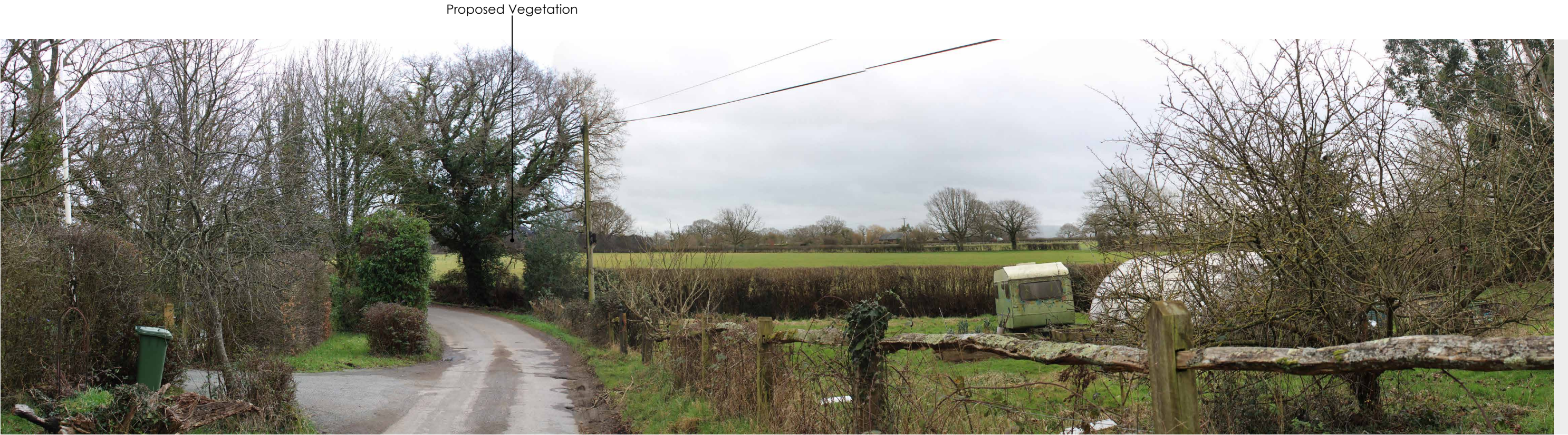
Photograph 14 View from Lock Lane Bridleway 1864 north west of Site

Visualisation Type 3 - Proposed View Year 15 Cylindrical projection 48% @ A3, 96% @ A1 Based on photography taken on 05.02.2024 at 11:29 Canon 2000D 1.6x, Canon EF-S 18-55mm HfoV 90° Viewpoint Location (Lat, Long): 50.9561, -0.3147 Viewpoint altitude 9m AOD plus 1.5m (approx, rounded to nearest 0.5m) Location data based on Samsung F21 SE GPS & Google Earth Distance to closest boundary edge (approx): 180m Looking direction: SE