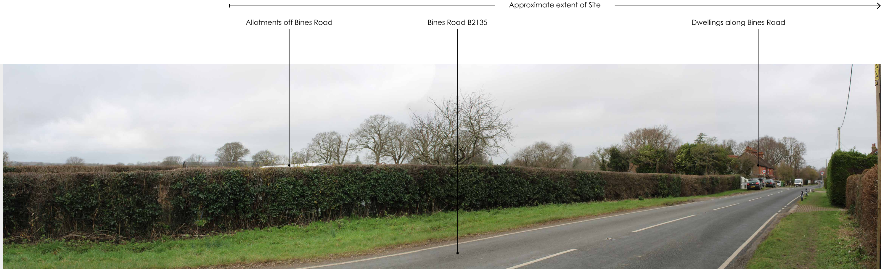
Photograph 18 View from Bines Road B2135 south east of Site

Visualisation Type 3 - Existing View Cylindrical projection 48% @ A3, 96% @ A1 05.02.2024, 12:02 Canon 2000D 1.6x, Canon EF-S 18-55mm Hfov 90° Viewpoint Location (Lat, Long): 50.9533, -0.3074 Viewpoint altitude 10m AOD plus 1.5m (approx, rounded to nearest 0.5m) Location data based on Samsung F21 SE GPS & Google Earth Distance to closest boundary edge (approx): 145m Looking direction: NW