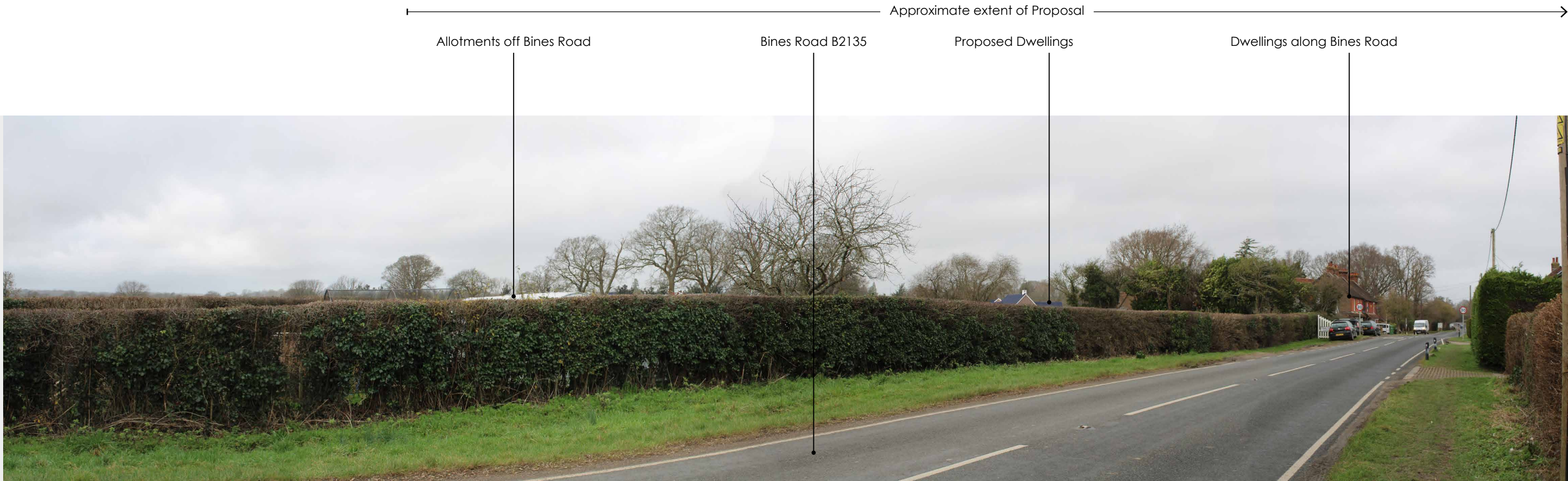
Photograph 18 View from Bines Road B2135 south east of Site

Visualisation Type 3 - Proposed View Year 15 Cylindrical projection 48% @ A3, 96% @ A1 Based on photography taken on 05.02.2024 at 12:02 Canon 2000D 1.6x, Canon EF-S 18-55mm HfoV 90° Viewpoint Location (Lat, Long): 50.9533, -0.3074 Viewpoint altitude 10m AOD plus 1.5m (approx, rounded to nearest 0.5m) Location data based on Samsung F21 SE GPS & Google Earth Distance to closest boundary edge (approx): 145m Looking direction: NW