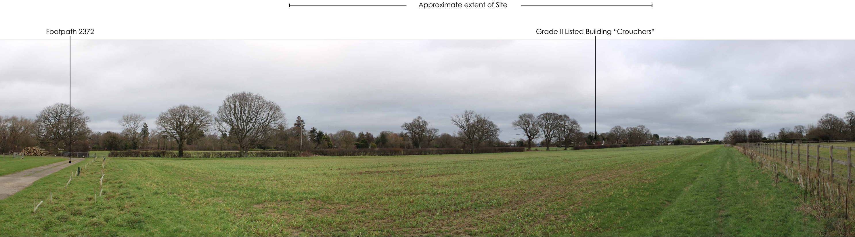
Photograph 13 View from south-west corner of field south of Site, immediately adjacent to Footpath 2372

Visualisation Type 3 - Existing View Cylindrical projection 48% @ A3, 96% @ A1 05.02.2024, 11:04 Canon 2000D 1.6x, Canon EF-S 18-55mm Hfov 90° Viewpoint Location (Lat, Long): 50.9535, -0.3132 Viewpoint altitude 8m AOD plus 1.5m (approx, rounded to nearest 0.5m) Location data based on Samsung F21 SE GPS & Google Earth Distance to closest boundary edge (approx): 315m Looking direction: NE