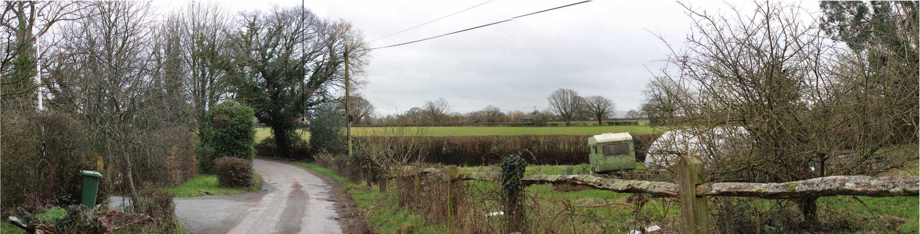
Photograph 14 View from Lock Lane Bridleway 1864 north west of Site

Visualisation Type 3 - Proposed View Year 1 Cylindrical projection 48% @ A3, 96% @ A1 Based on photography taken on 05.02.2024 at 11:29 Canon 2000D 1.6x, Canon EF-S 18-55mm HfoV 90° Viewpoint Location (Lat, Long): 50.9561, -0.3147 Viewpoint altitude 9m AOD plus 1.5m (approx, rounded to nearest 0.5m) Location data based on Samsung F21 SE GPS & Google Earth Distance to closest boundary edge (approx): 180m Looking direction: SE