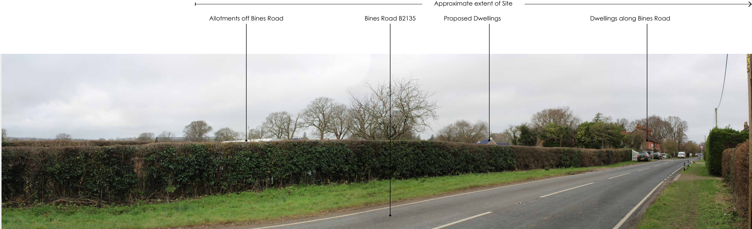
Photograph 18 View from Bines Road B2135 south east of Site

Visualisation Type 3 - Proposed View Year 1 Cylindrical projection 48% @ A3, 96% @ A1 Based on photography taken on 05.02.2024 at 12:02 Canon 2000D 1.6x, Canon EF-S 18-55mm HfoV 90° Viewpoint Location (Lat, Long): 50.9533, -0.3074 Viewpoint altitude 10m AOD plus 1.5m (approx, rounded to nearest 0.5m) Location data based on Samsung F21 SE GPS & Google Earth Distance to closest boundary edge (approx): 145m Looking direction: NW