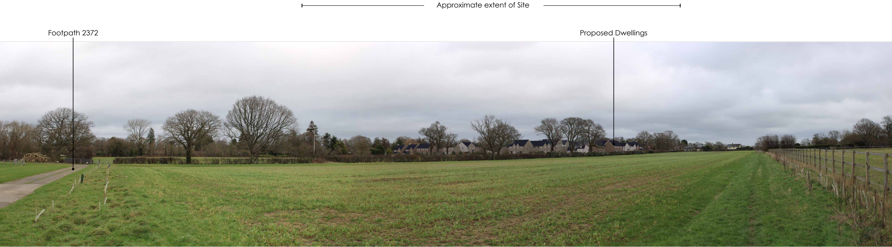
Photograph 13 View from south-west corner of field south of Site, immediately adjacent to Footpath 2372

Visualisation Type 3 - Proposed View Year 1 Cylindrical projection 48% @ A3, 96% @ A1 Based of photography taken on 05.02.2024 at 11:04 Canon 2000D 1.6x, Canon EF-S 18-55mm HfoV 90° Viewpoint Location (Lat, Long): 50.9535, -0.3132 Viewpoint altitude 8m AOD plus 1.5m (approx, rounded to nearest 0.5m) Location data based on Samsung F21 SE GPS & Google Earth Distance to closest boundary edge (approx): 315m Looking direction: NE