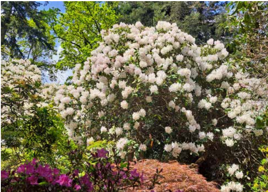
Fig.13 Rhododendrons flowering in May