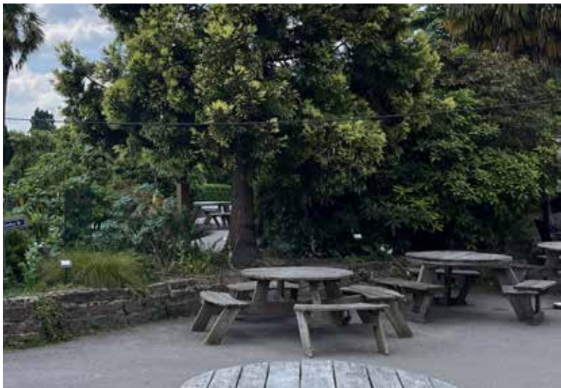
Fig. 10 Zone D - Planting in central public area near cafe