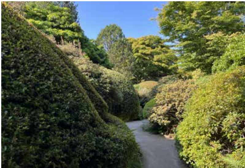
Fig. 8 Zone B - Rock gardens with Azaleas and path