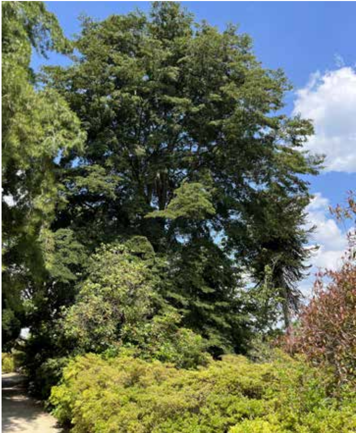
Fig.19 Nothofagus sp. - Champion Tree