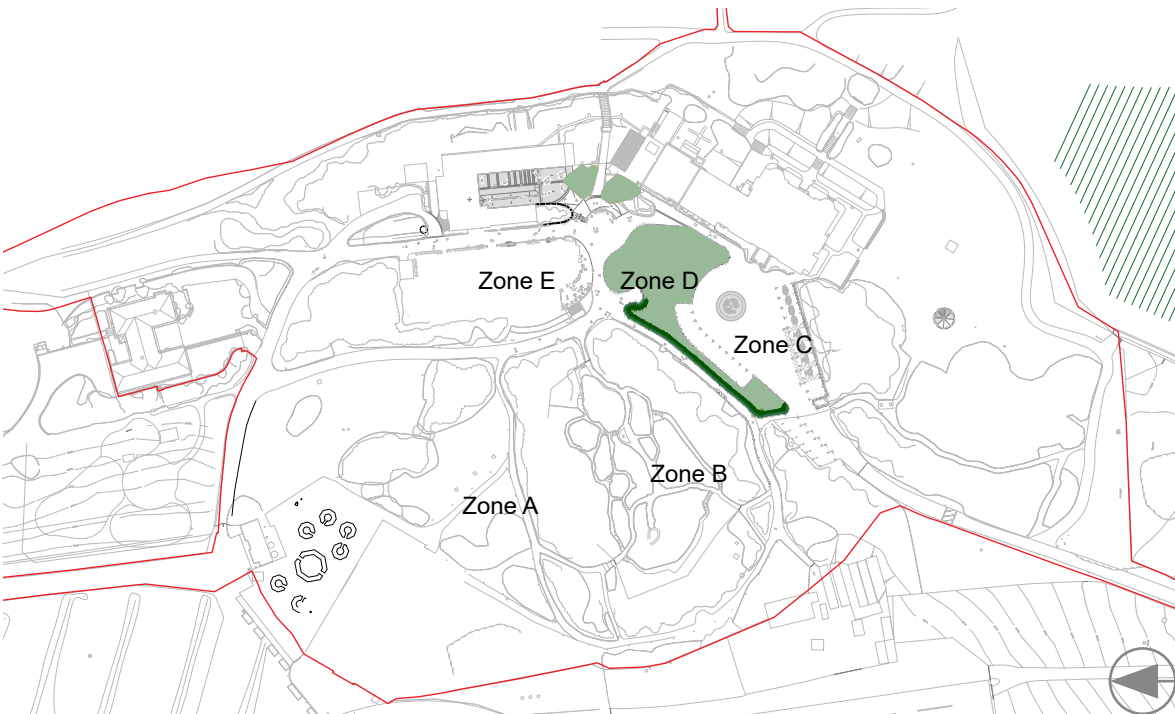
Fig. 6 All zones plan

The east facing wall to the former Generator Block has a collection of early flowering Japanese Camellia sasanqua varieties. These have grown to fully cover most of the side of the building. Mixed shrub borders face the sides of the stable block.