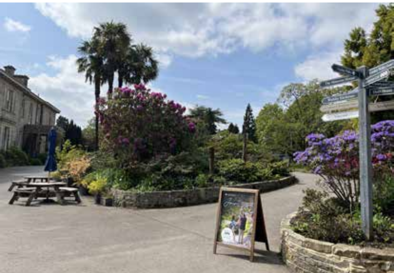
Fig. 11 Zone D - Planting in central public area near cafe