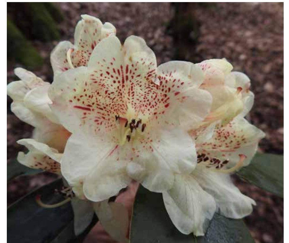
Fig. 5 Rhododendron 'Leonardslee Primrose'