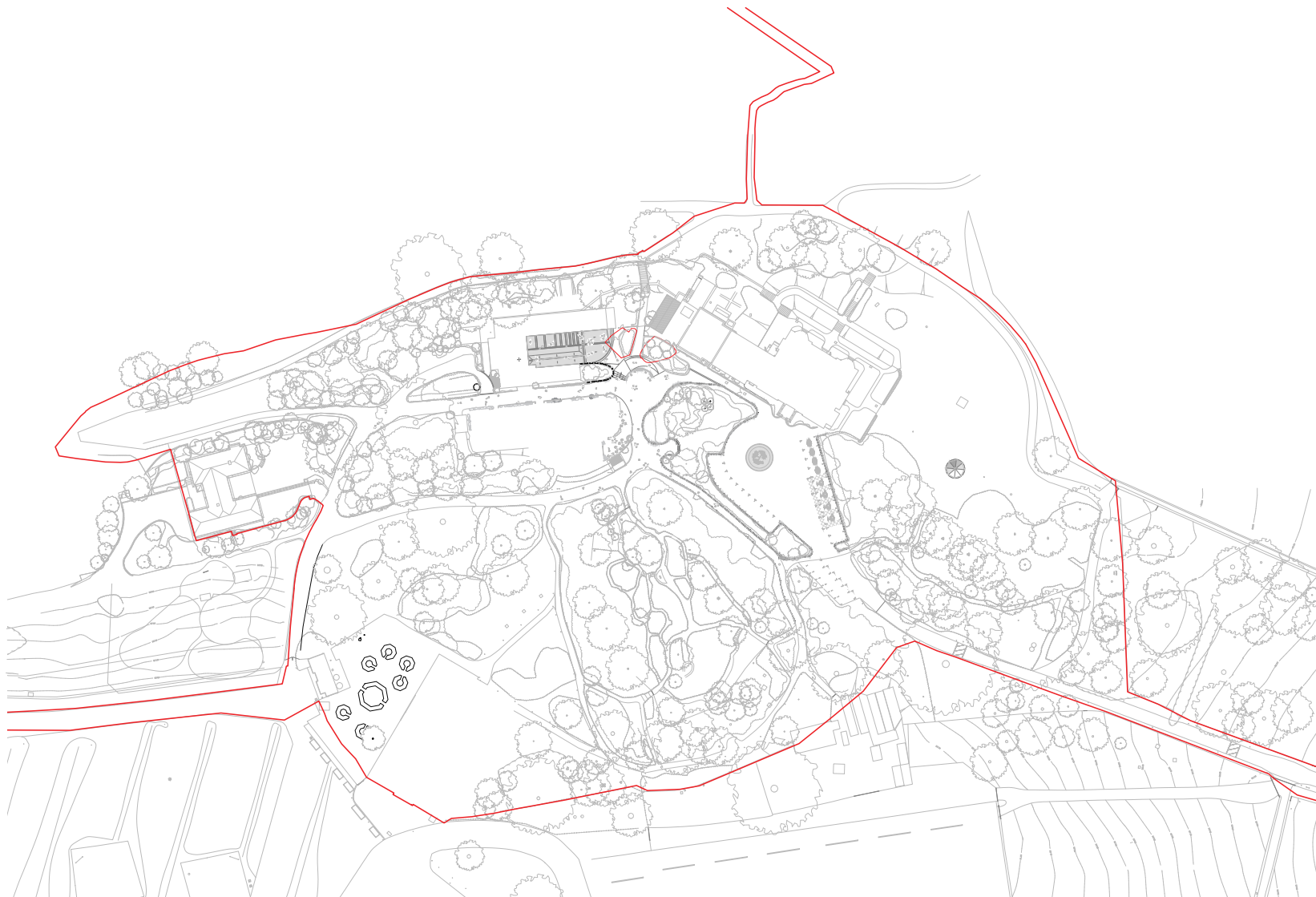
Fig. 1 Plan of proposed public realm area with red line boundary