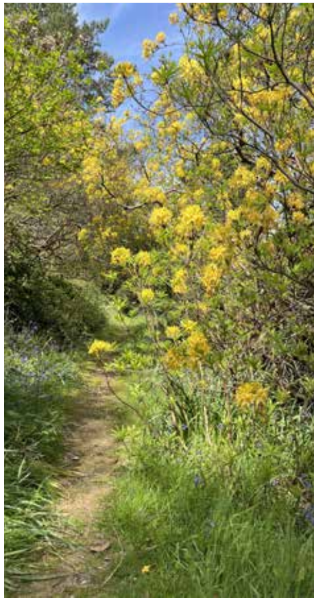
Fig.15 Azalea mollis along path and in clearings