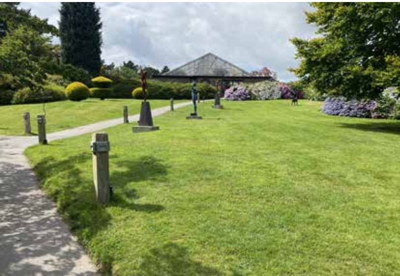
Fig.7 Zone A - View from path due west and looking up to the glasshouse