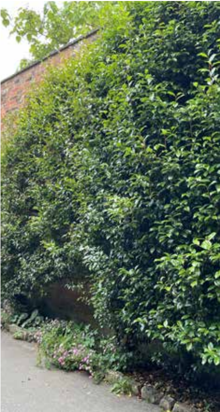
Fig.18 Camellia sasanqua varieties on Engine House