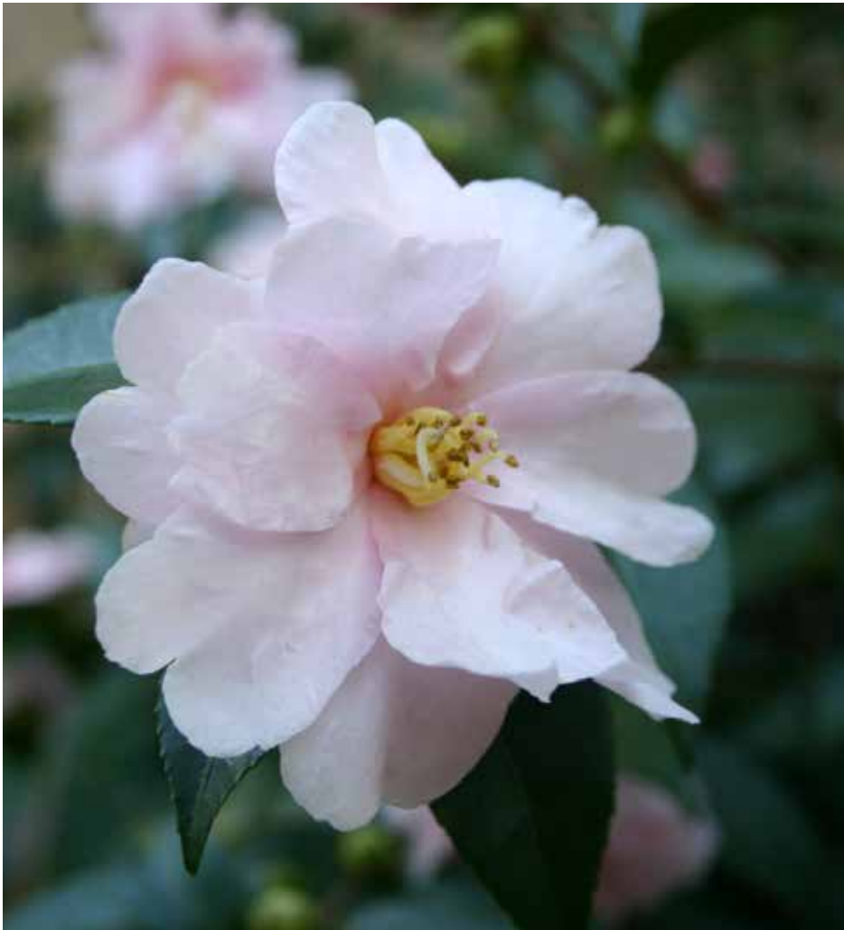
Fig.17 Camellia sasanqua