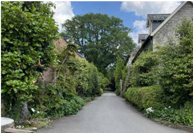
Fig. 12 Zone E - Camellias on Engine House with shrubs to east side