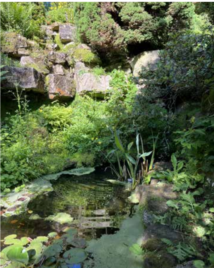
Fig.14 Pool in the rock garden