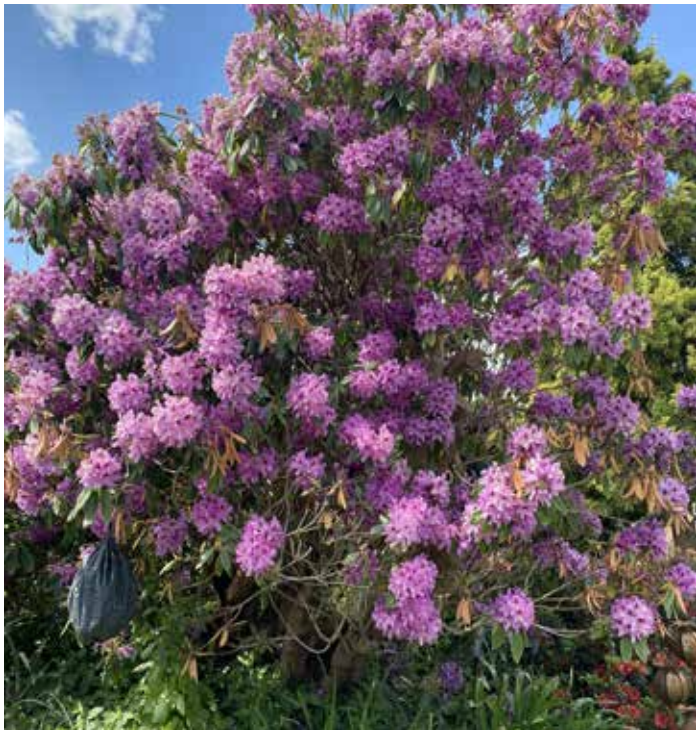
Fig.20 Rhododendron var. (unknown)