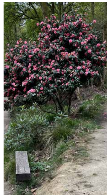
Fig. 4 Camellia japonica var. along Camellia Grove