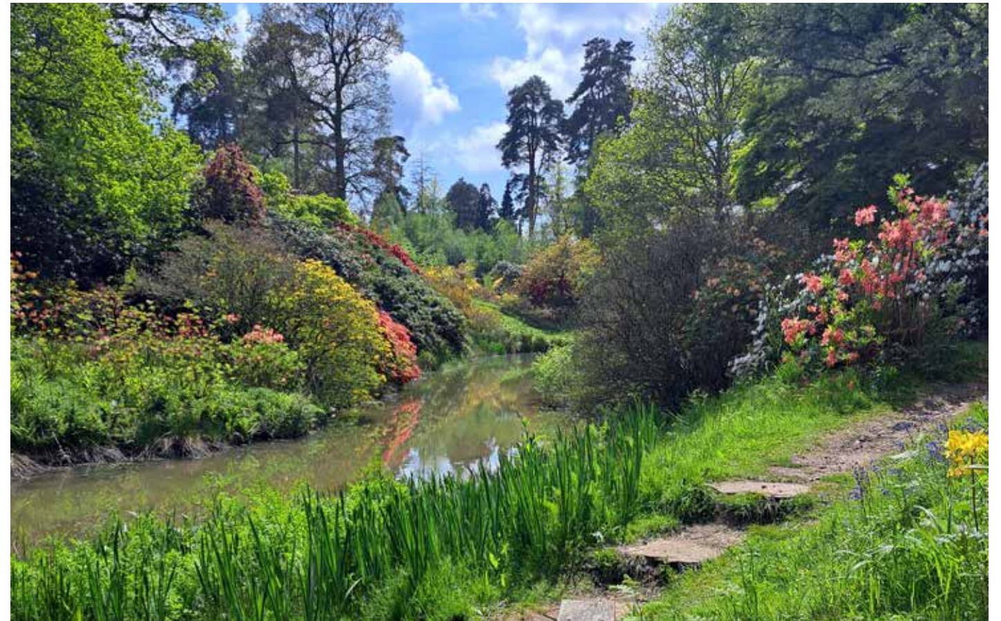
Fig. 3 Typical view south along Leucathoe Pond in valley