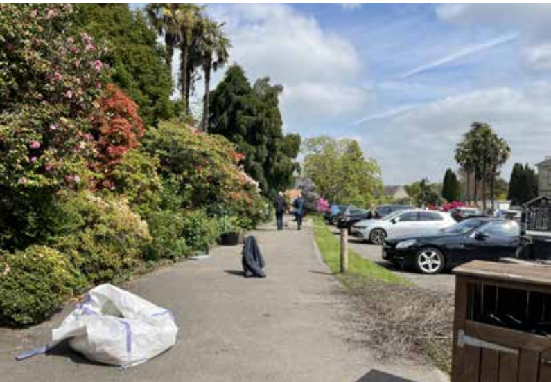
Fig. 9 Zone C - Planting in central public area near cafe