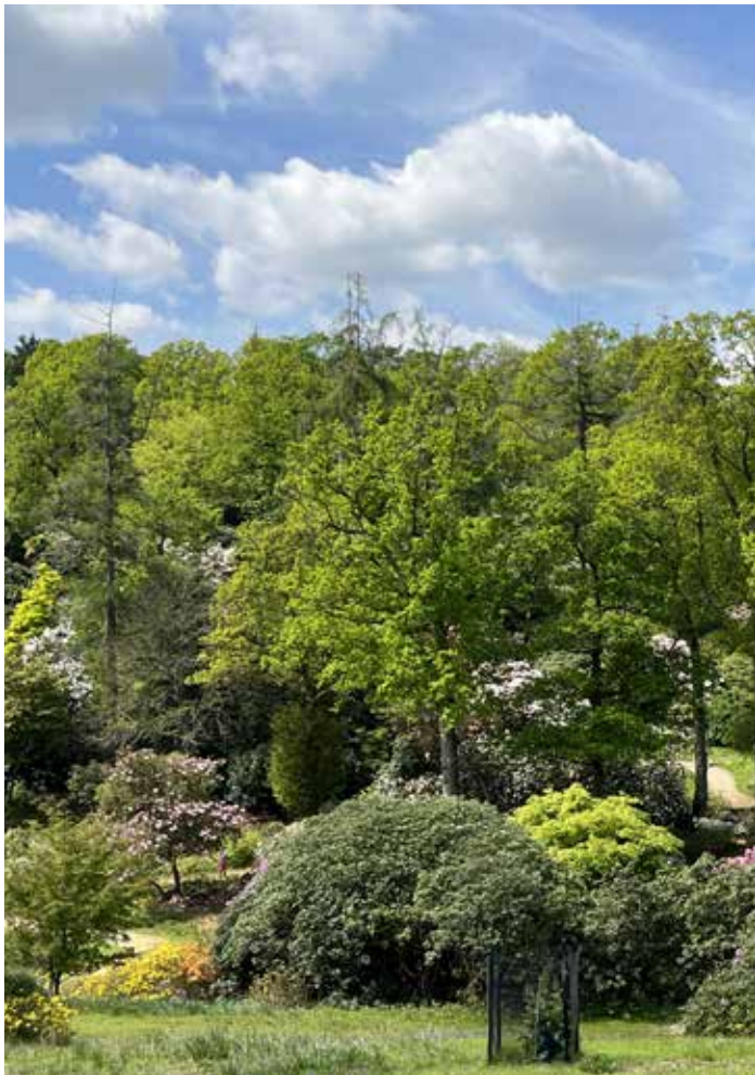
Fig.16 View east across valley to Hogstolt Hill