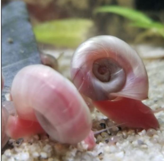
Little Whirlpool Ramshorn Snail - a rare, protected species. Its future is “uncertain”.