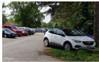
Ifield Golf Club car park - Typical day

It is clearly needed as a quality golf course which is confirmed by the number of visitors shown above. It is required as the most accessible golf course in the area because you can get there by car, bike, foot, bus and train. All of this is available to non-golfing social members. By comparison, Tilgate Forest Golf Centre has sat alongside Ifield GC for 50 years and despite having a driving range and until recently a lovely 9 hole par golf course, its membership last year was only c120.