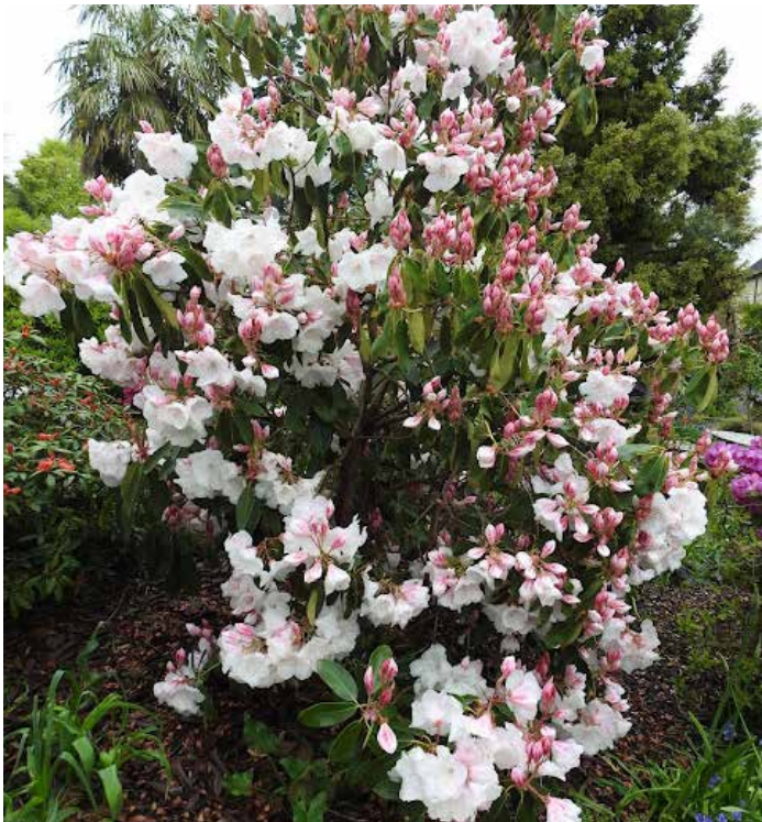
Fig. 37 R. Leonardslee Giles