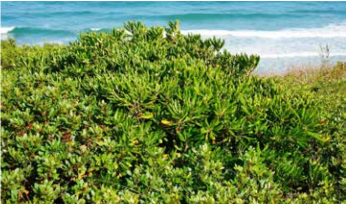
Fig. 46 Pittosporum tobira nanum