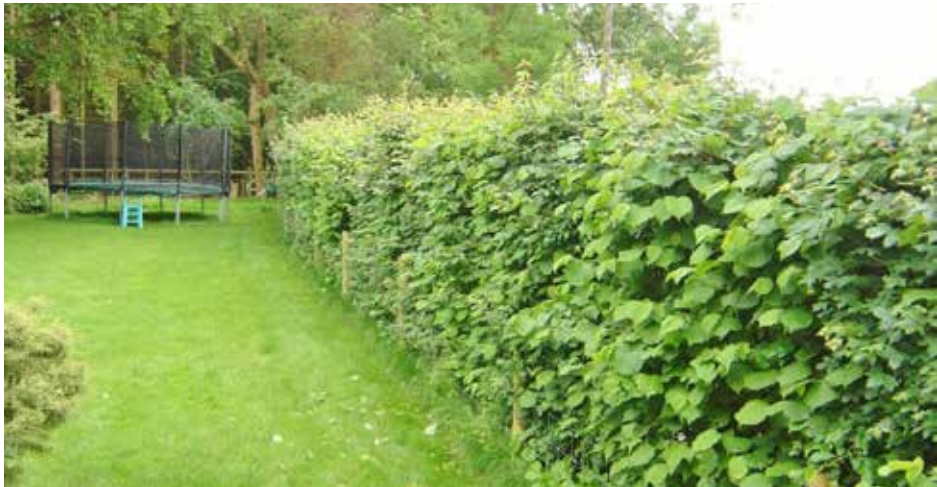
Fig. 35 Native hedgerow