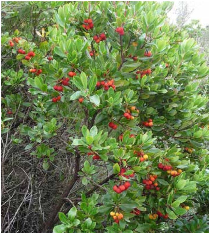
Fig. 42 Arbutus unedo

Shrubs- Pittosporum vars, Corokia x virgata, Coprosma vars., Myrtus vars., Erica canaliculata.