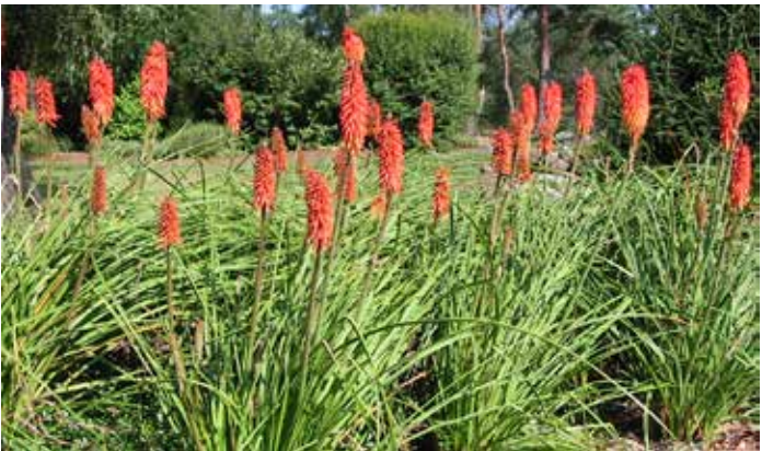
Fig. 44 Kniphophia vars.