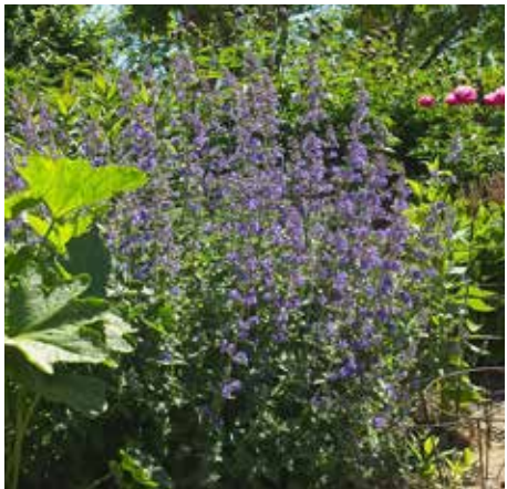
Fig. 30 Nepeta 'Walkers Low'