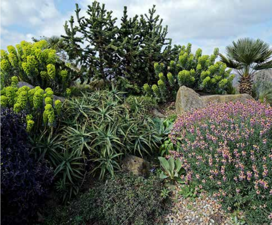
Fig. 40 The dry garden at RHS Hyde Hall