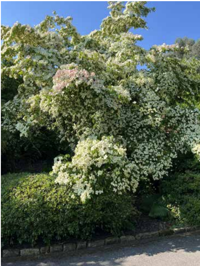
Fig. 29 Cornus kousa var. © LUC