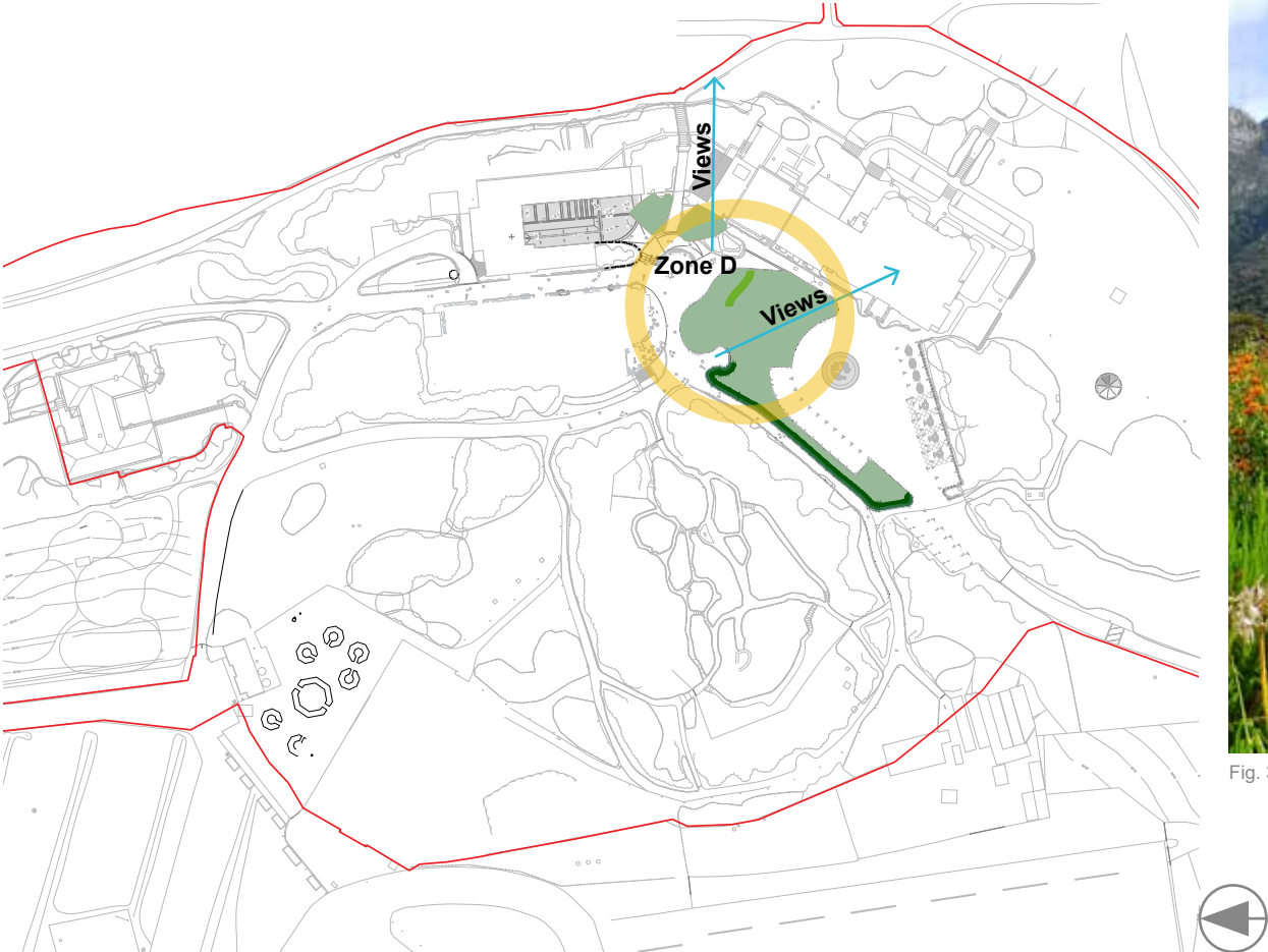
Fig. 36 Village Centre and Car Park area