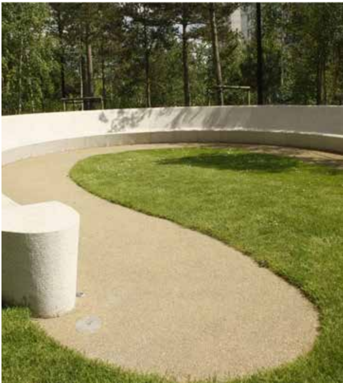
Fig. 41 Species rich lawn turf © London Turf Company

To ensure good sight lines to the Mansion and also provide a route for maintenance, the central area of the main bed will contain a species rich lawn turf (Fig. 41) comprising of over 26 species of wildflowers which can be mown regularly and kept tidy. This will also provide good BNG value.