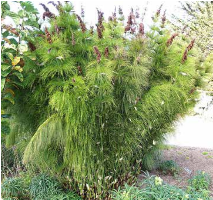
Fig. 48 Elegia capensis