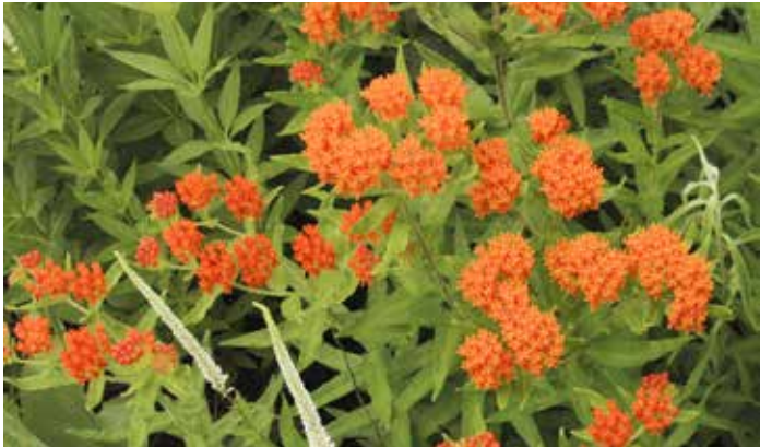
Fig. 45 Asclepias tuberosa