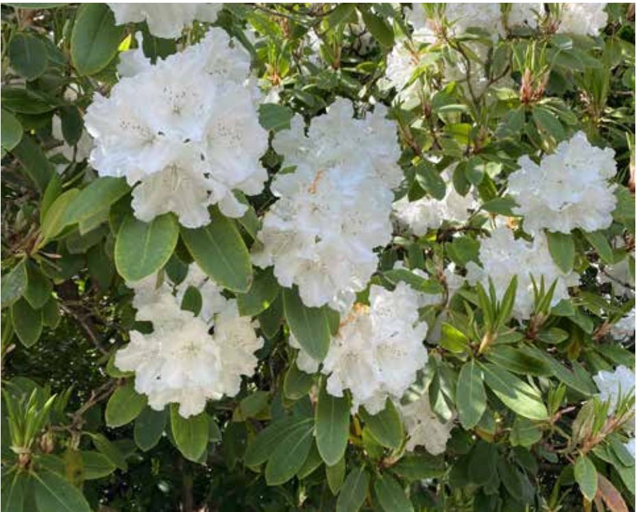
Fig. 38 R. Loders White