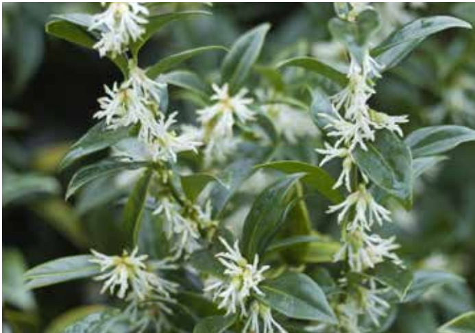
Fig. 34 Sarcococca confusa for hedge