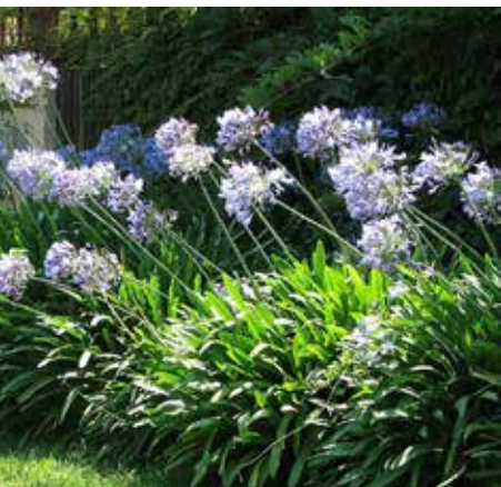
Fig. 33 Agapanthus vars.