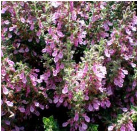
Fig. 32 Teucrium x lucidrys