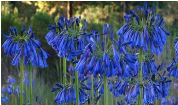
Fig. 43 Agapanthus inapertus