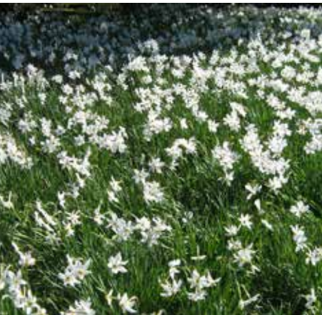
Fig. 31 Narcissus 'Thalia'