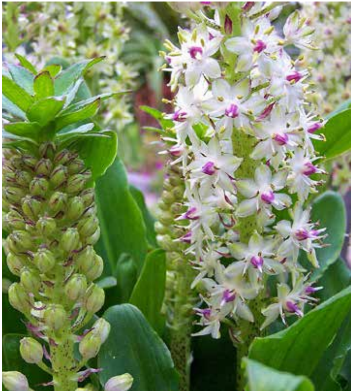
Fig. 47 Eucomis bicolor