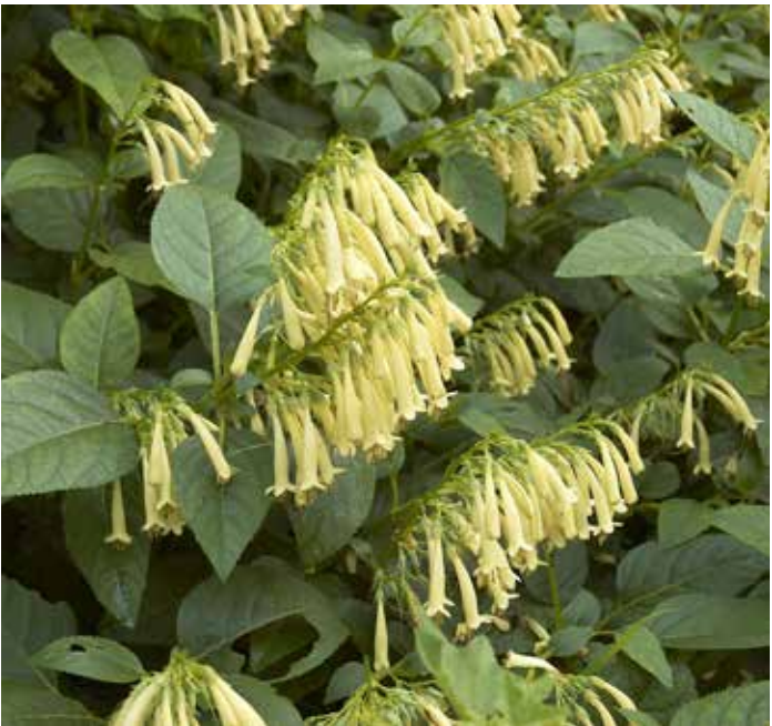
Fig. 49 Phygelius Yellow Trumpet