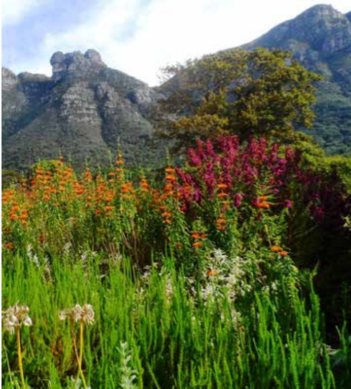
Fig. 39 Kirstenbosch Botanical Gardens