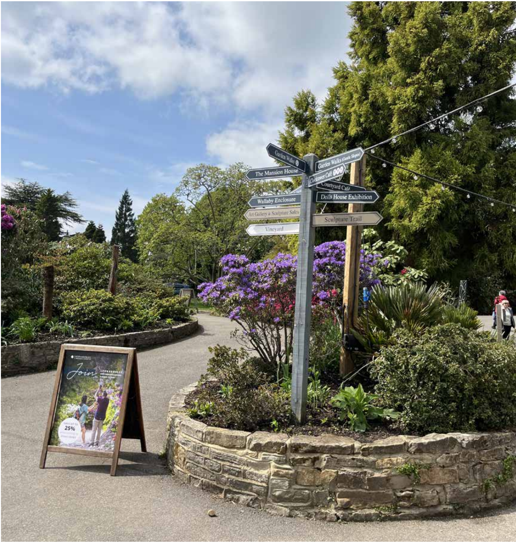
Fig.22 View of existing bed in Zone D