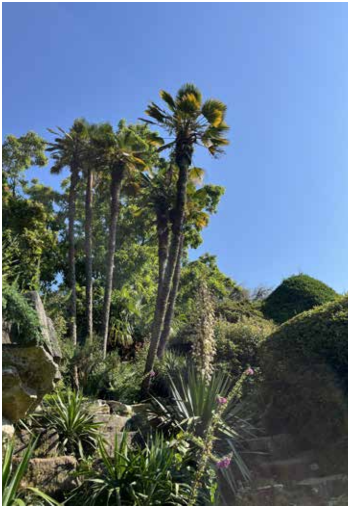
Fig.27 Mature specimen planting with Chusan Palms and very few alpine plants