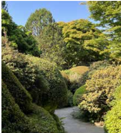
Fig.26 Cloud pruned shrubs and Azaleas