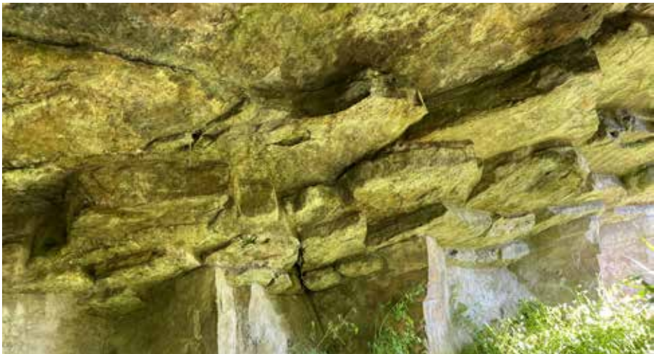
Fig.24 Pulhamite over rock structure