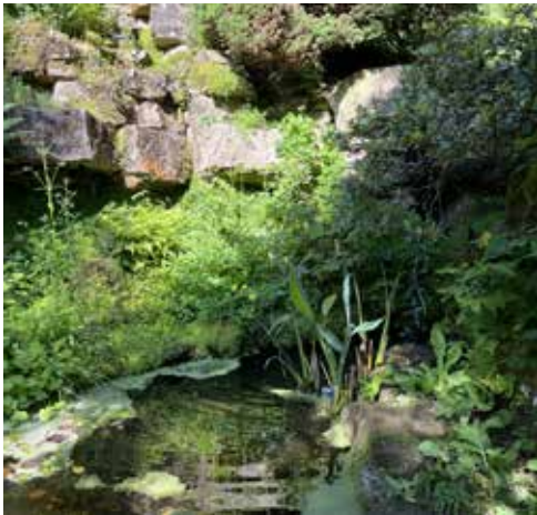
Fig.25 Restored pool with planting