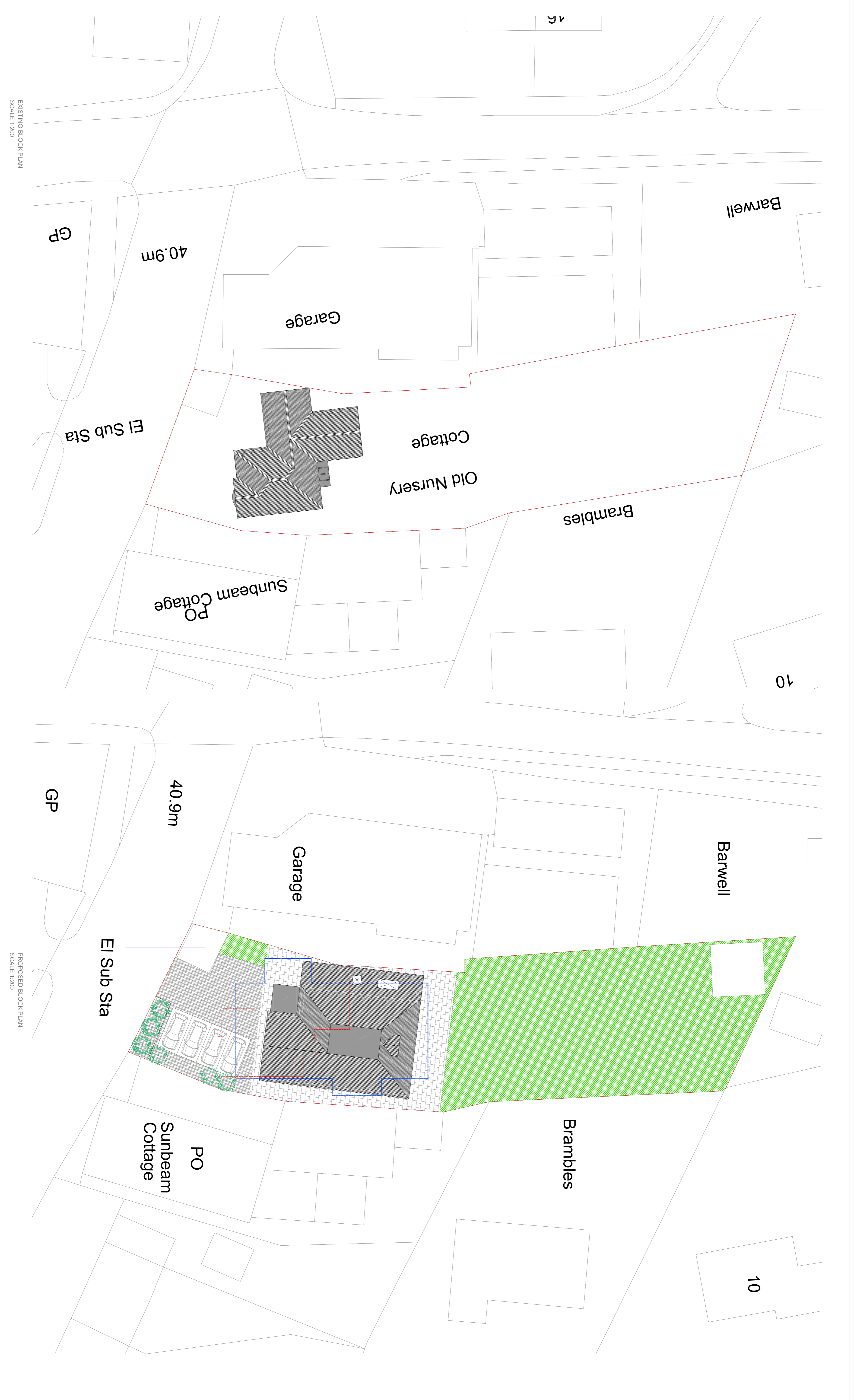
EXISTING BLOCK PLAN SCALE 1:200