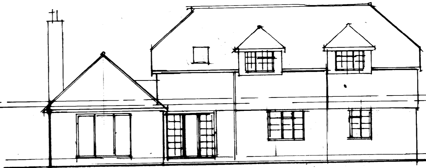
REAR ELEVATION (South)