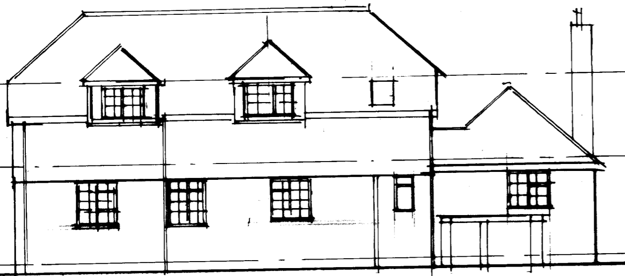
FRONT ELEVATION (N)