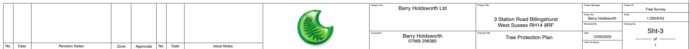
1 Tree Protection Plan Scale: 1:200