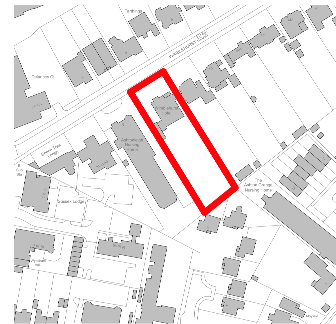
Existing Location Plan