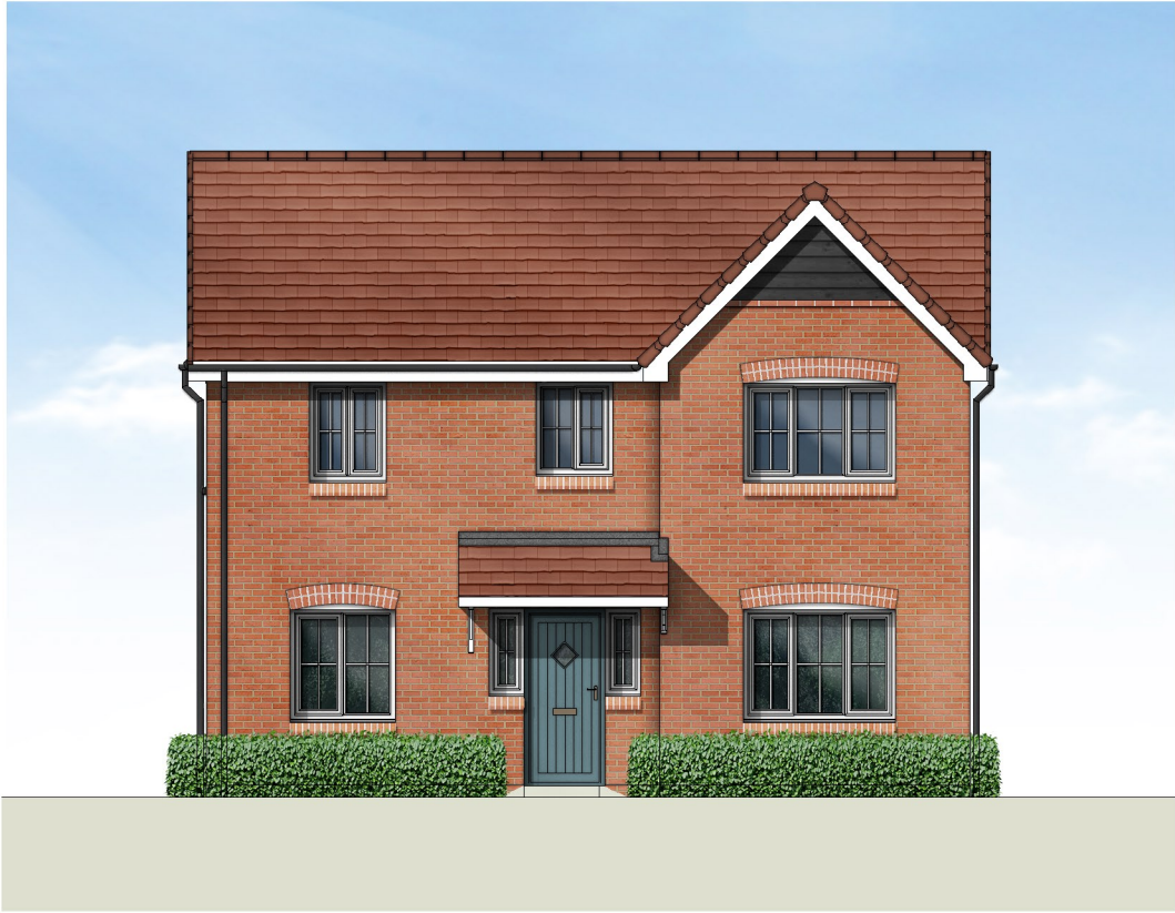
1 Front Elevation 1 : 100