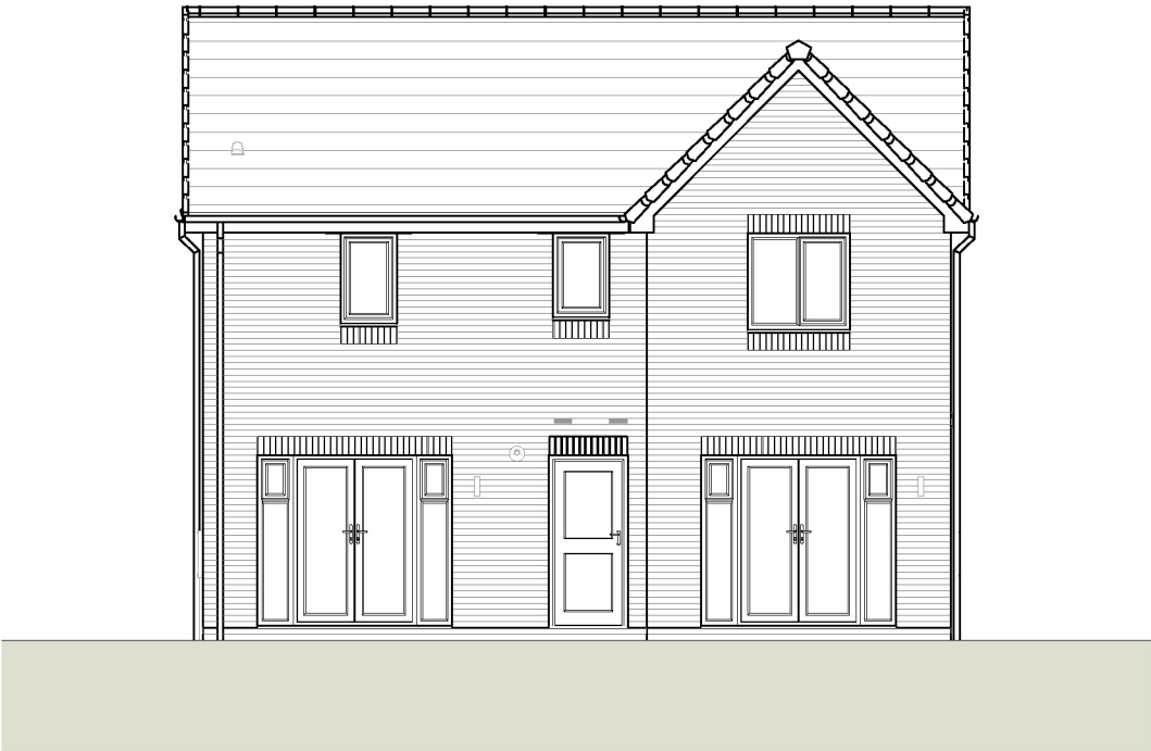
3 Rear Elevation 1 : 100