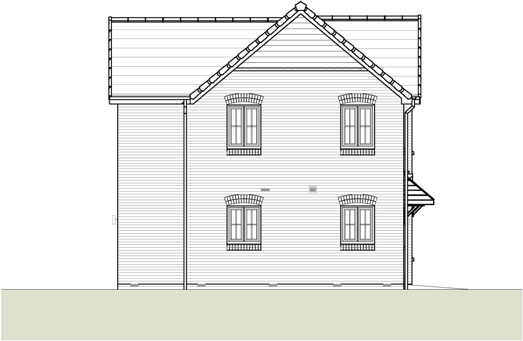
2 Gable Elevation 1 : 100