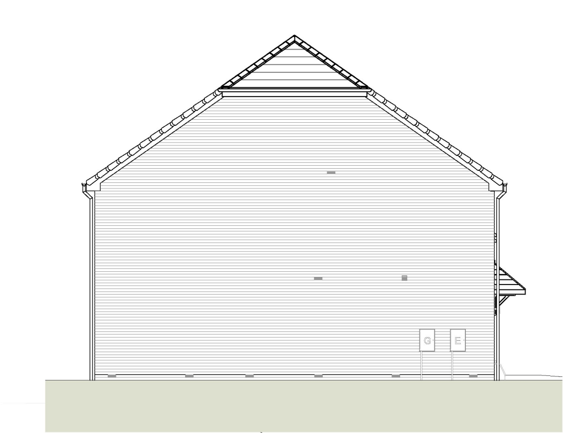
2 Gable Elevation 1 : 100