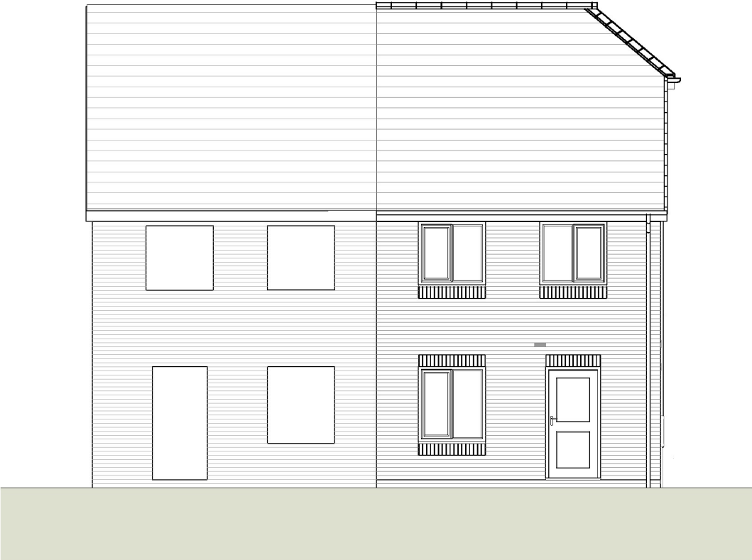
3 Rear Elevation 1 : 100