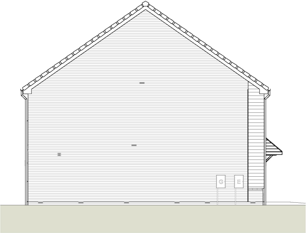
2 Gable Elevation 1 : 100