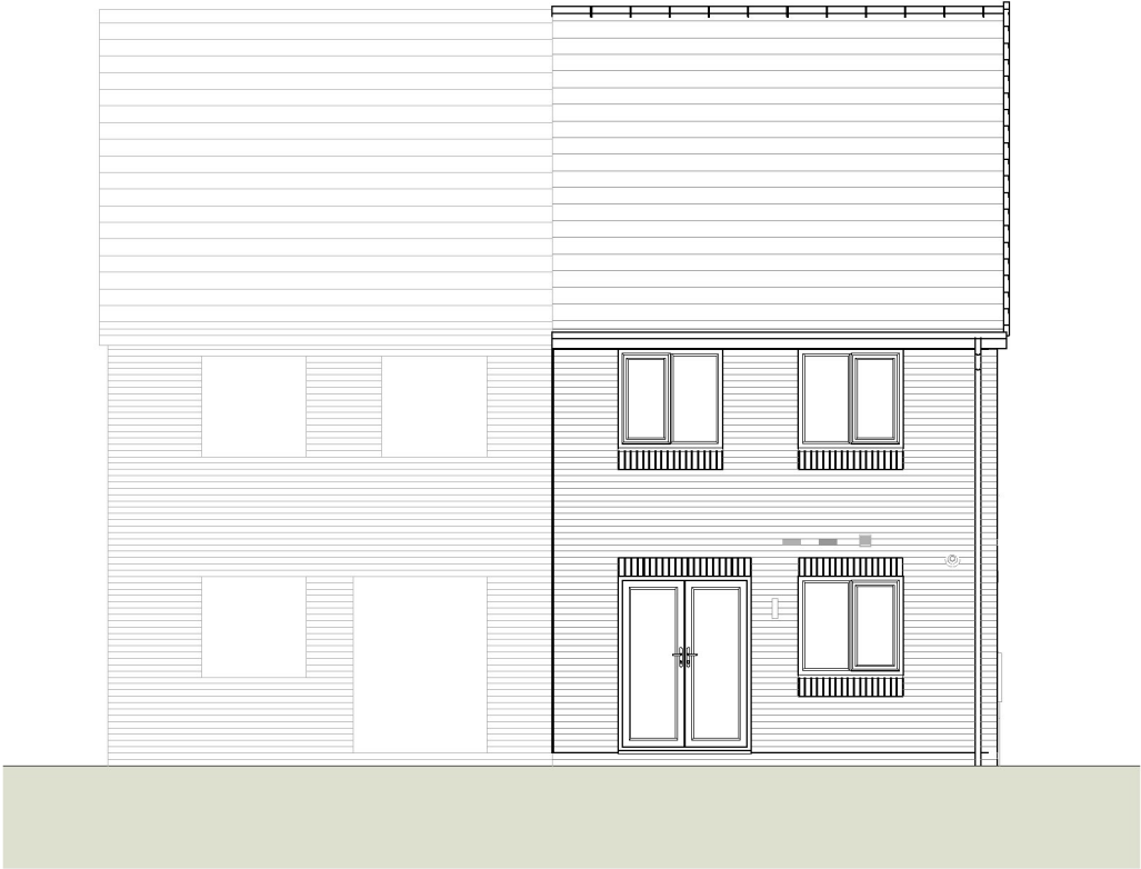
3 Rear Elevation 1 : 100