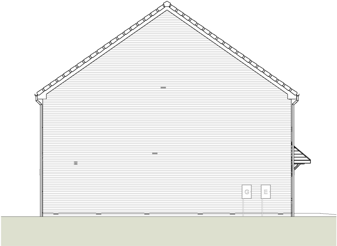
2 Gable Elevation 1 : 100