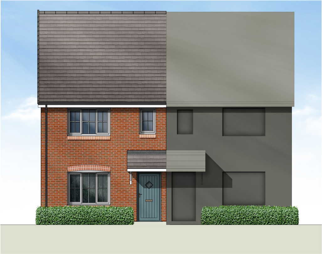
1 Front Elevation 1 : 100