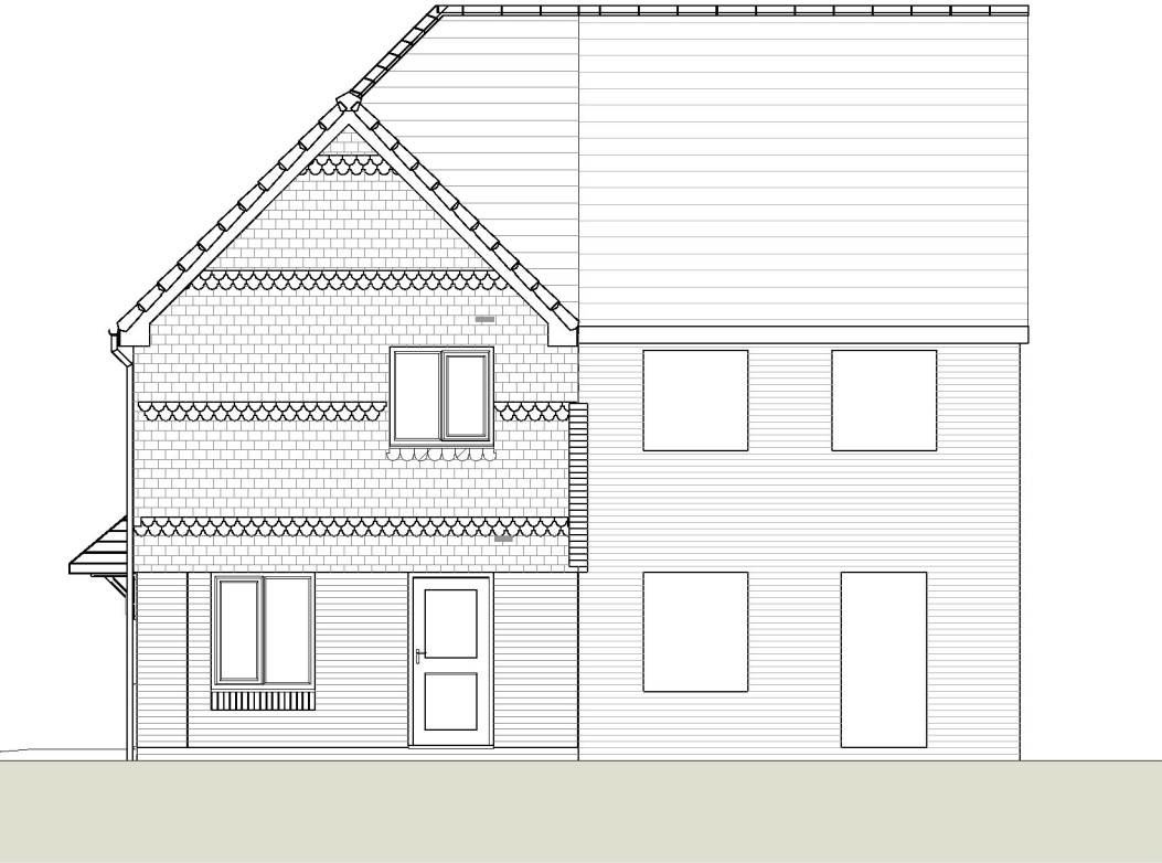
3 Rear Elevation 1 : 100