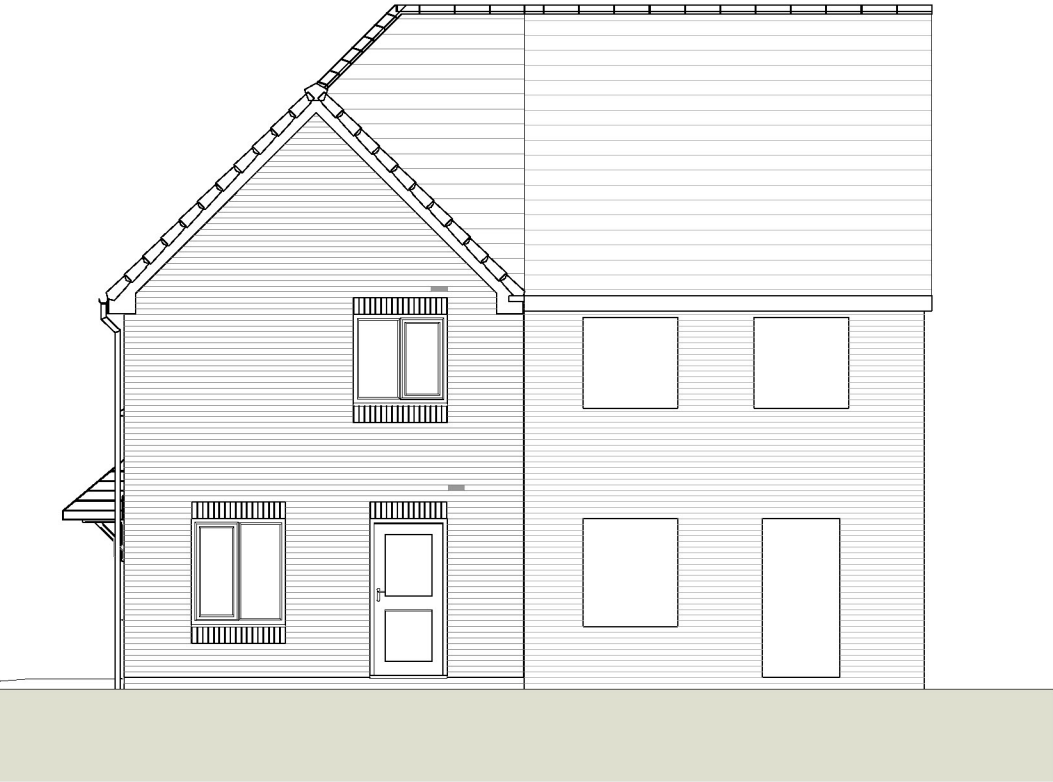
3 Rear Elevation 1 : 100