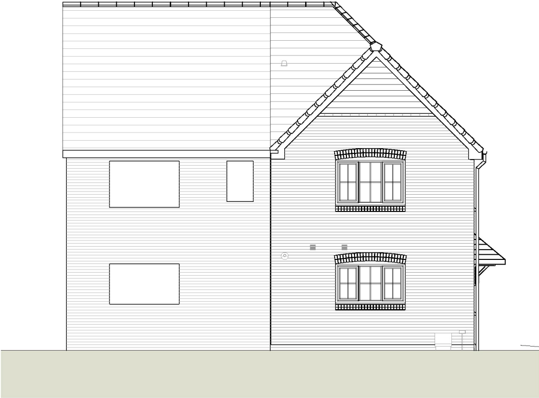
2 Gable Elevation 1 : 100