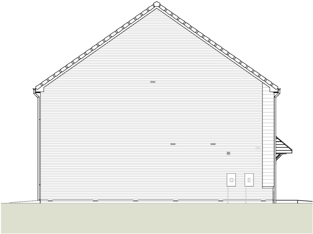
2 Gable Elevation 1 : 100