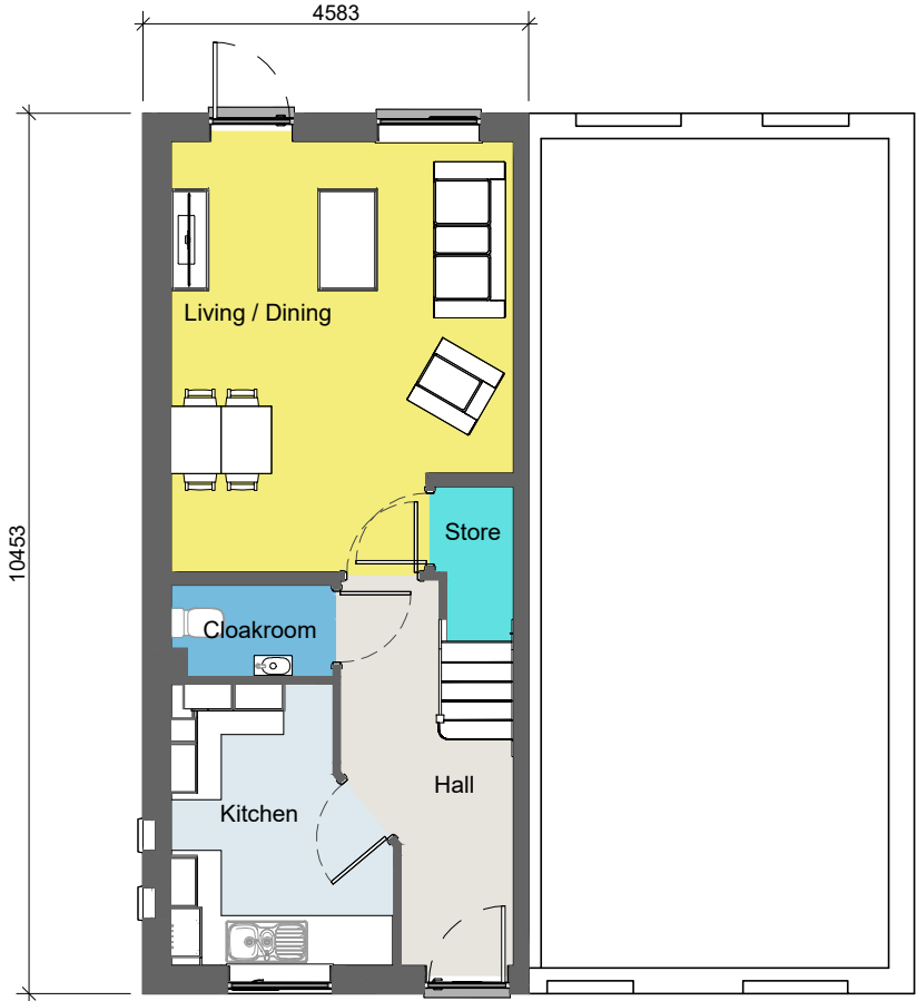
1 Ground Floor 1 : 100